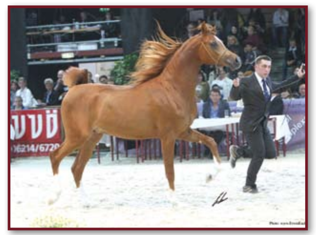
ETERNAL TOP FIVE COLTS Breeder/Owner: Glowacki/PL