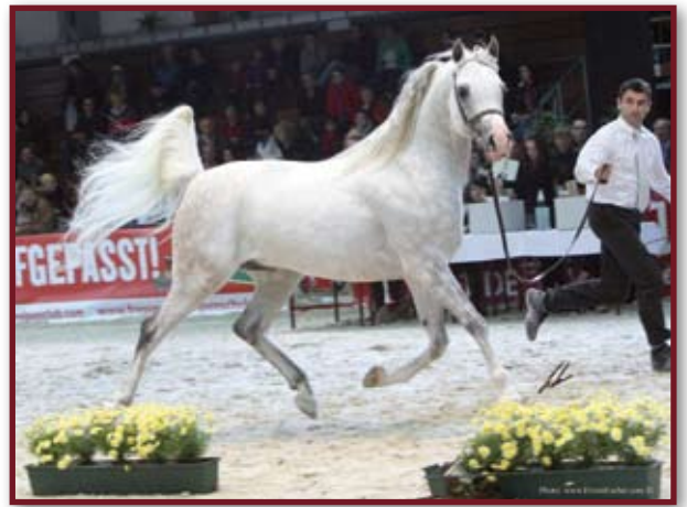
GALINKA EL SHEIKH TOP FIVE STALLIONS Breeder/Owner: Rongits/AT

PALMIRA** TOP FIVE MARES Breeder/Owner: Michalow/PL