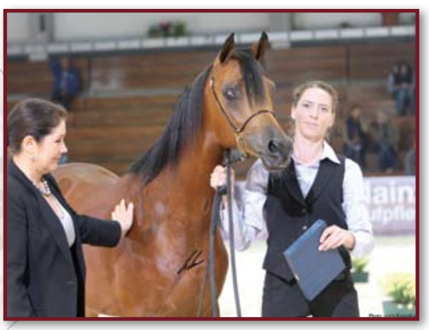
ARIA SANTINO RA TOP FIVE COLTS Breeder/Owner: Rosenau/USA