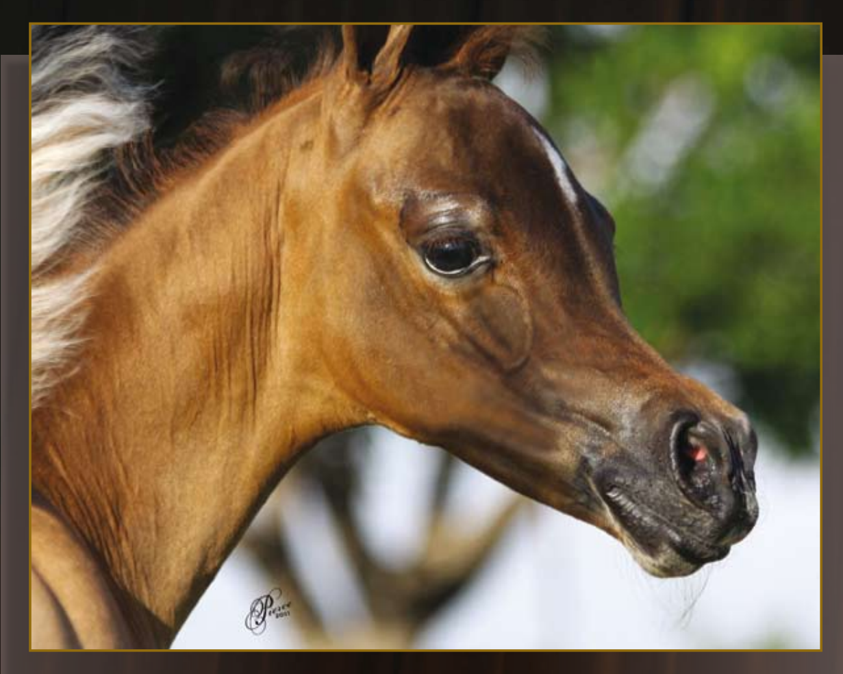
WC Ciao Magnifficaa (Marwan Al Magnifficoo x WC Ciao Bella+/)