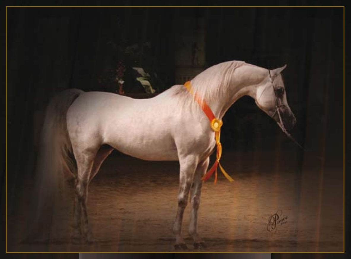
REA El Kaream (PVA Kariim x REA Nisrs Angel)

A lifelong horse lover, artist, and Arabian horse breeder since 1979, photography was never a consideration in my list of possible occupations. An English/journalism/ art teacher by profession, I had dabbled in web site design for a time, but only after I was unable to find a photographer to shoot a client's horses in November of 2006 did I pick up a camera. Always a late bloomer, I discovered THIS was my passion!