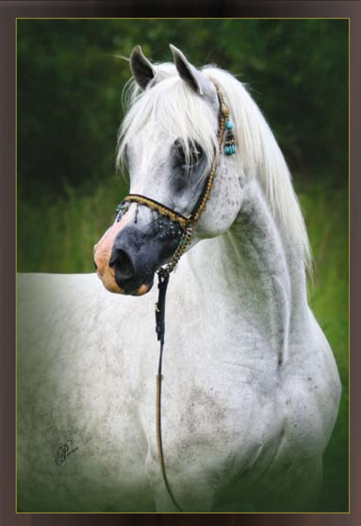
Felicity BHF (Falcon BHF x BH Royal Westonia)