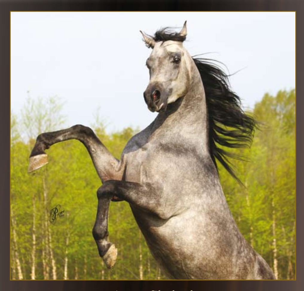
Amer Shahed (Imperial Shehaab x Imperial Kameesha)