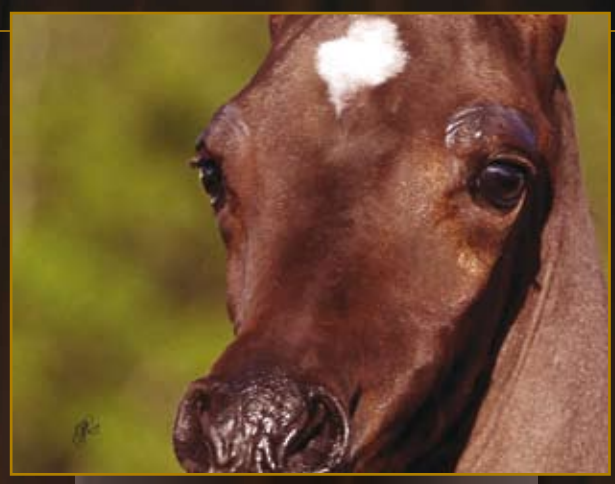
Bocelli (Versace x Famiss FM)