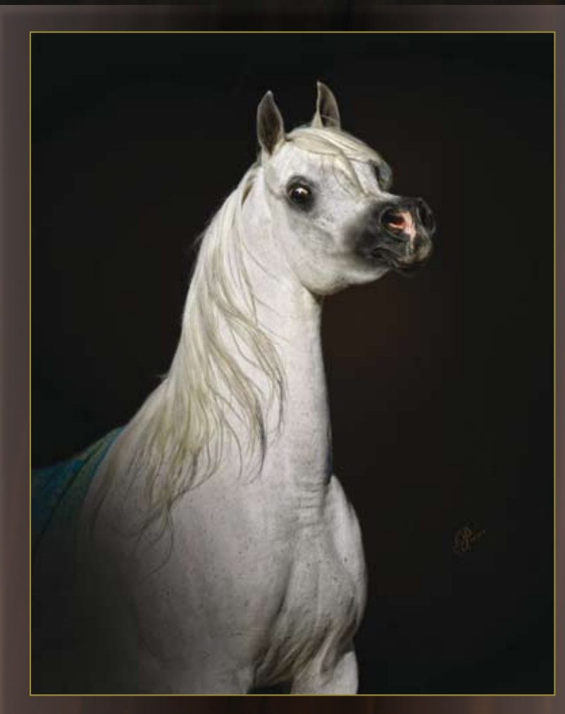
Gatsby CC (*Shahir IASB x Miss Maggie Mae)