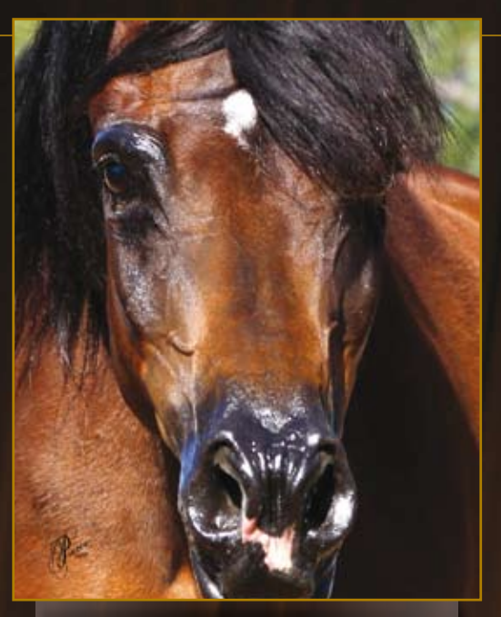
Imay Bold Princess (Psymadre x A Bold Beauty)