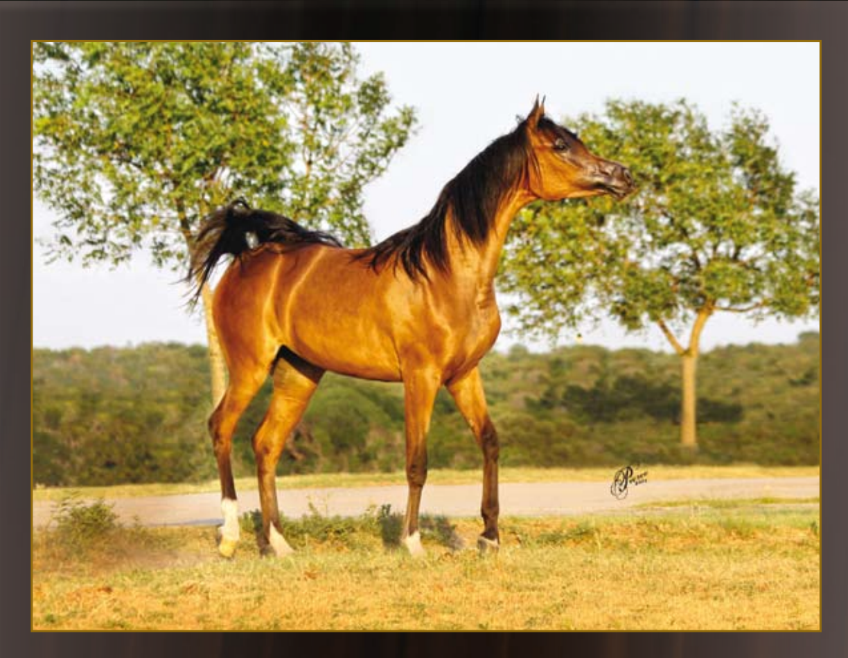
WC Marissa (Marwan Al Magnifficoo x WC Gorgeous Gazal)