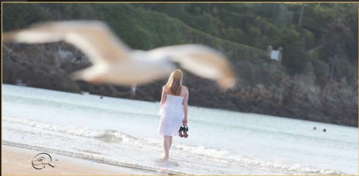
Seasight of The famous «Cap L'Herel», Brittany