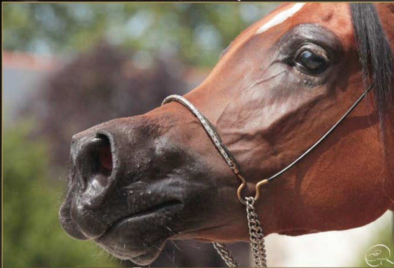
Kahil Al Shaqab