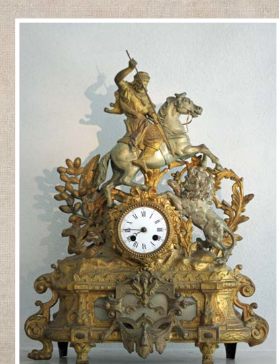
A charming sculpture by Pierre-Jules Mène

The patination is a very important part of a piece of art. It can enhance or even break the total look of a bronze. Patination of a sculpture was not an easy task. A considerable amount of skill and experience was needed to receive a successful result. It was said to have been a five to seven year apprenticeship