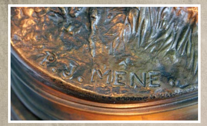
Signature of the famous Animalier Pierre-Jules Mène.

iron models can reach a high standard. They should be handled with more care than bronzes. Cast-iron is brittle and will shatter easily when dropped to the ground. By the way, a horse sculpture should never be lifted by the tail. The tail was often cast separately and will break easily. Of course this can be repaired by a restorer but it is always nicer to have a fine, untouched piece.