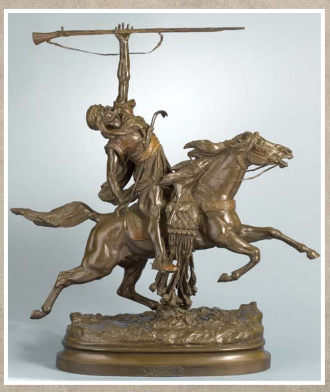
Prosper Le Courtier: "La Fantasia Arabe" (Arab Warrior on Horseback) bronze ca. 1890, signed "Le Courtier" on base

sculpture in the narrow sense was produced for almost 2.000 years. Interestingly, although animals were almost completely neglected by sculptors during that time, they continued to be regarded as proper subjects for painting. Then from Renaissance times on, equestrian statues became highly popular. More than any other animal, the horse can be found in European sculpture. However, the horse was usually destined to play a secondary role. Most often it was a status symbol, underlining the wealth, power and virility of a kind or leader. Only here and there we can find rare pieces of artwork created purely