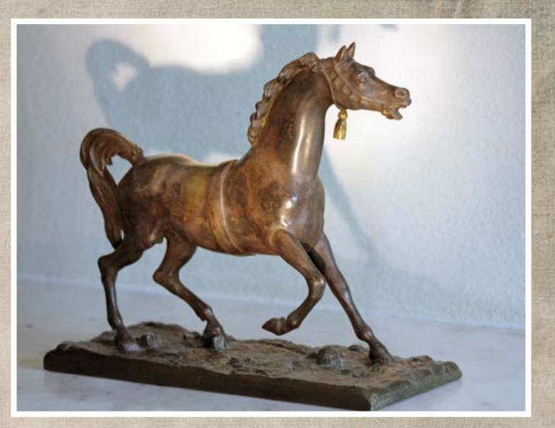
Bronze sculpture "Arabian Stallion with Halter" 19th century, from the collection of Judith Wich-Wenning.

As bronze was also expensive in the 19th century, artists often worked with alternatives as for example spelter and cast-iron. Spelter is a mixture of zinc alloyed with other soft metals. It has a lower melting point compared to bronze and is far softer. Spelter was invented around 1850 and was especially popular