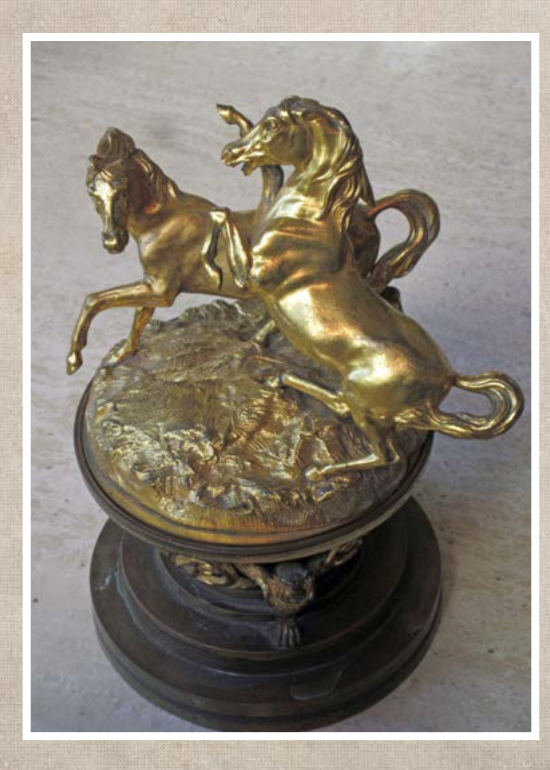
A very decorative object from 19th century: Two fighting stallions standing on a receptacle; made in fire-gilded bronze.

There are several ways of casting a sculpture. The so-called "cire perdue" ("lost wax") process is a method, which was discovered circa 4.000 years ago. It leads to the loss of the original model and could be used only for producing single casts. Here a mould was formed over a wax model, which was then melted out. This created a hollow space for the bronze. As the wax model liquefied, it was of course no longer to be used. This way of casting is considered the most satisfactory method, despite being also the most expensive. Antoine-Louis Barye was one of the few Animalier sculptors who had their work cast by the