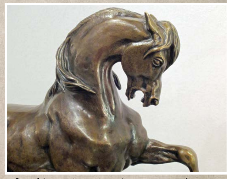
One of the most impressive sculptures ever created: Antoine-Louis Barye's work "Cheval Turc", casted by the famous foundry Barbédienne.

among German artists. Generally speaking, spelter sculptures are often lighter than bronze models of equivalent size. When tapped with a fingernail, spelter will give a different sound compared to bronze: it has virtually no ring.