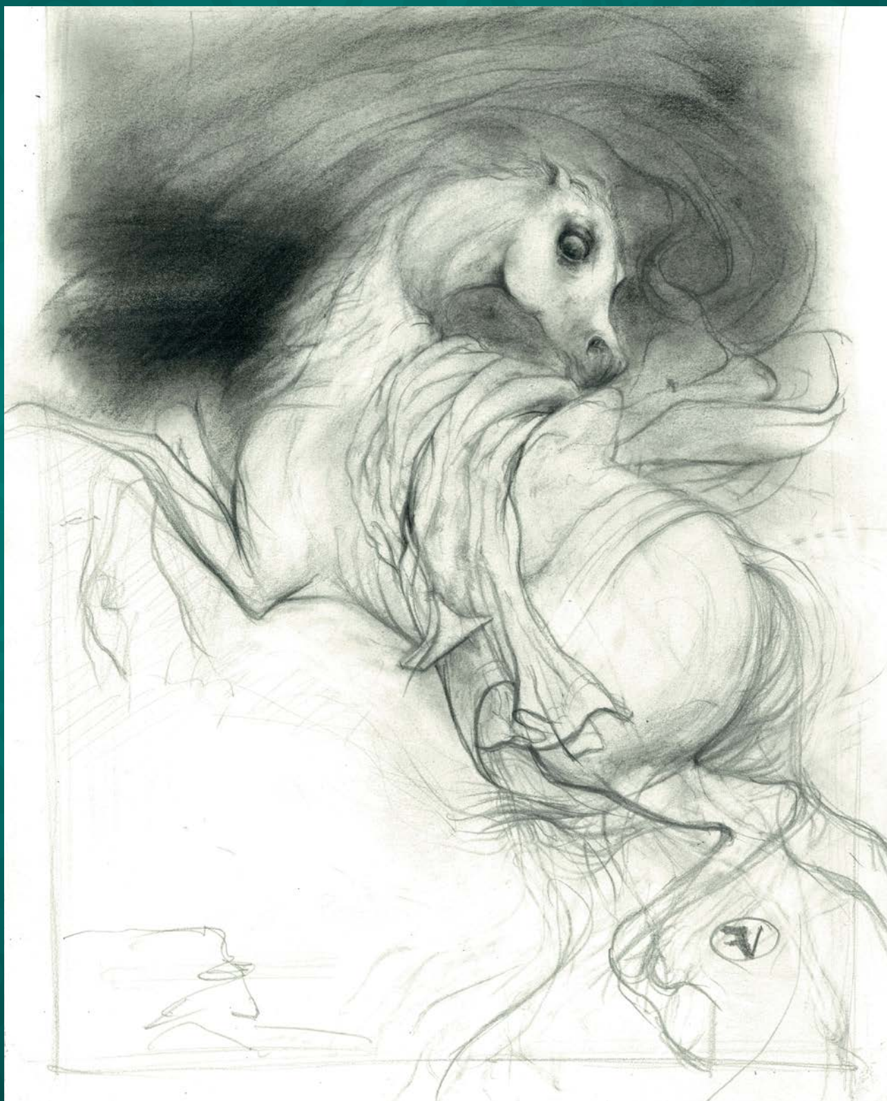
“Dance Of The Gods” 2013 Drawing graphit and charcoal on paper mounted on MDF panel size: height 150 cm x width 110 cm