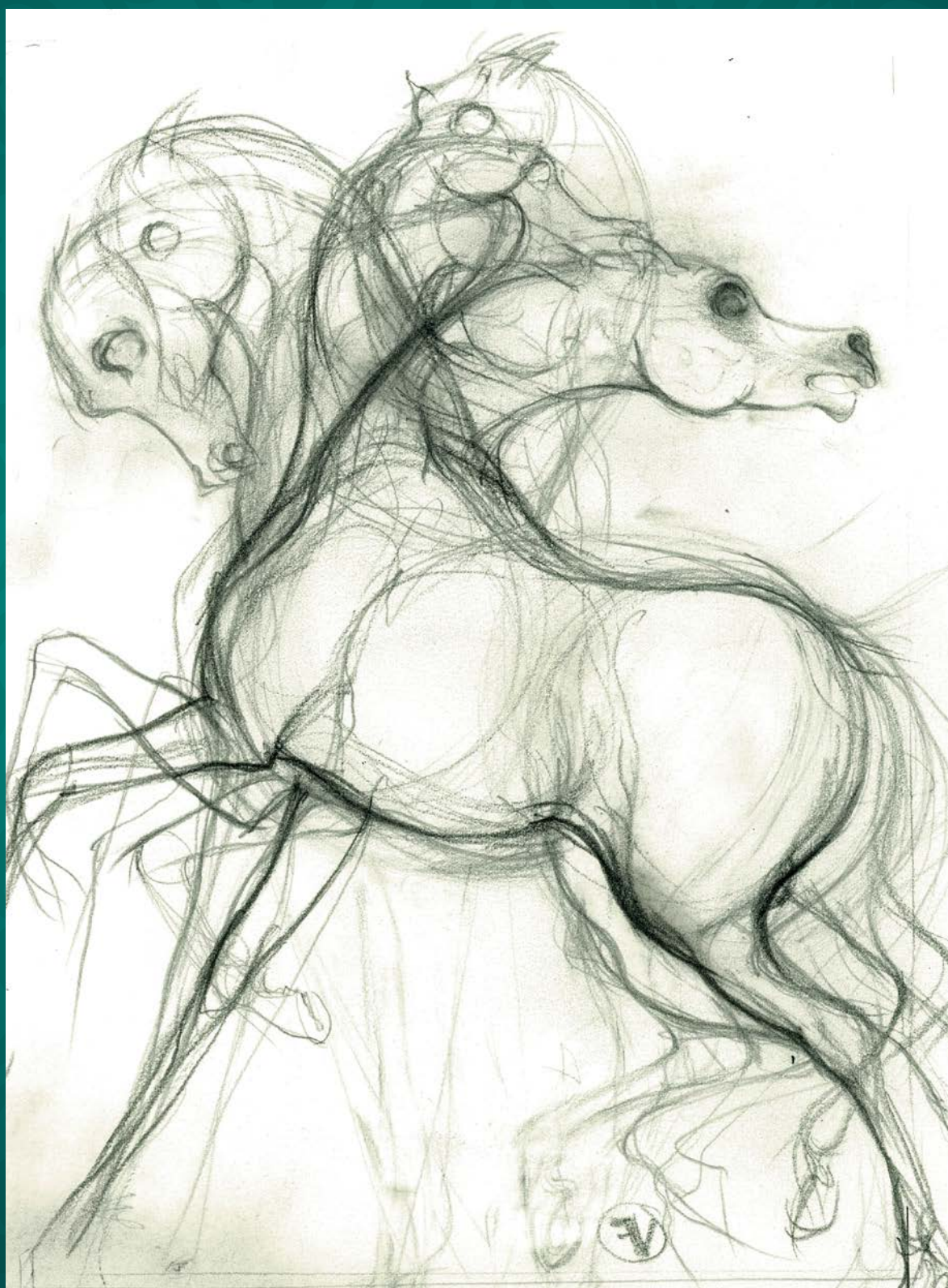
“Dance Of The Gods” 2012 Drawing/study graphit and charcoal on paper size: height 126 cm x width 89 cm