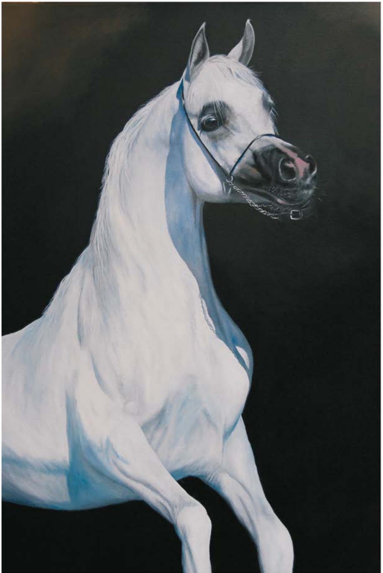
"Arabian Stallion" by Jonathan Truss, Oil on canvas, 36 x 24 inches