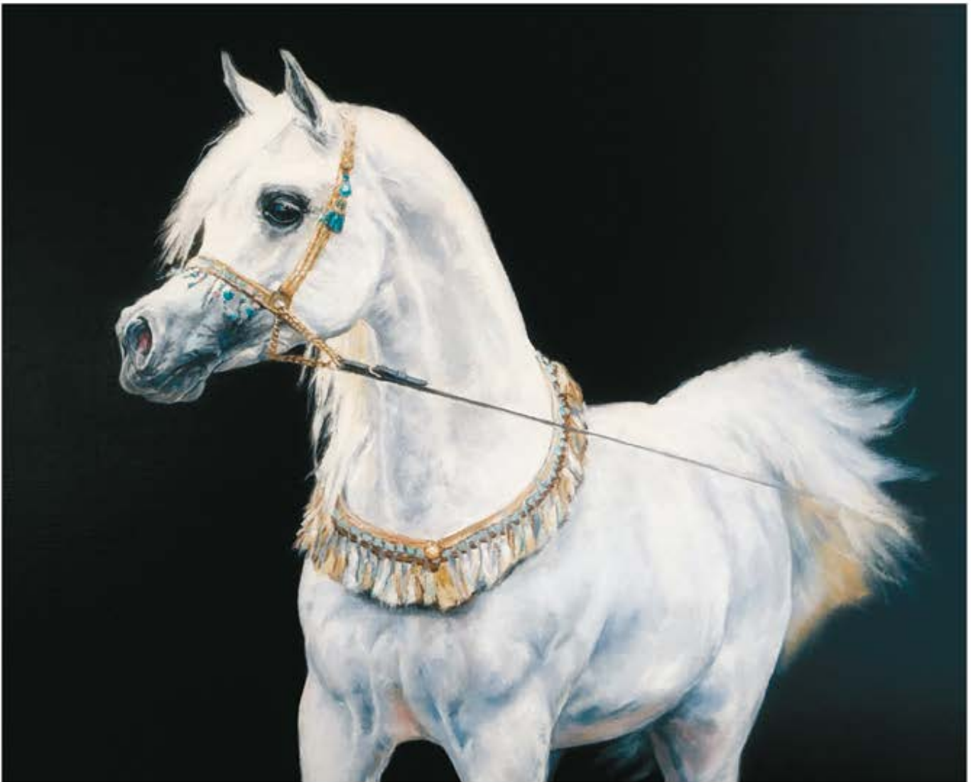
"Arabian Beauty" by Jacqueline McAteer, Oil on canvas, 27 x 30 inches