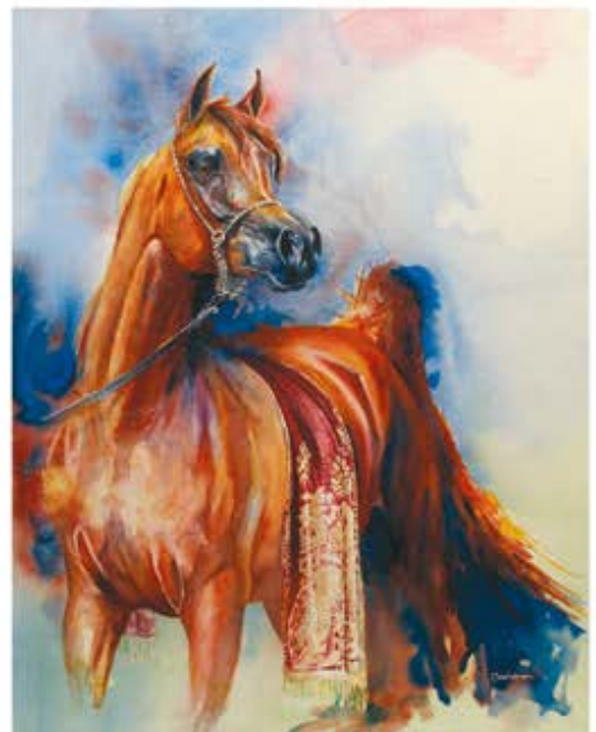
"Silk & Gold" by Ruth Buchanan Watercolor on paper, 30 x 22 inches