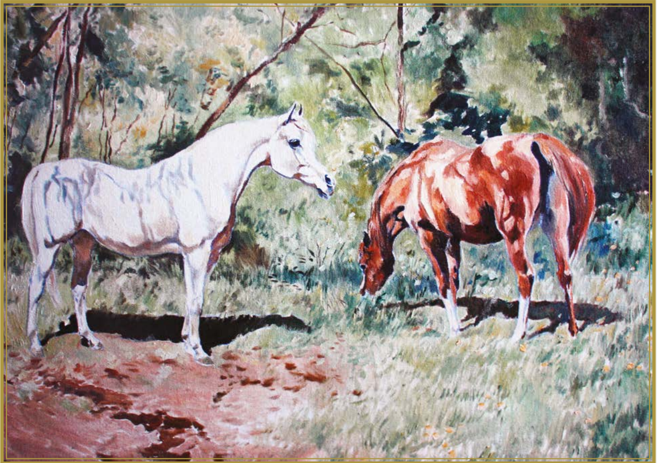
“Sunlight Patterns: two Mares”