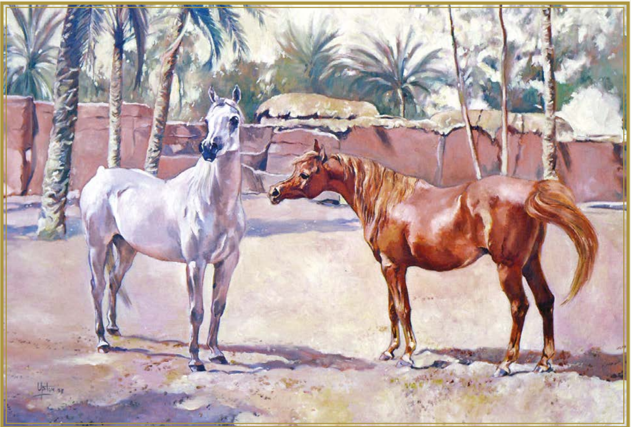
“A Chestnut and a Grey Arab”