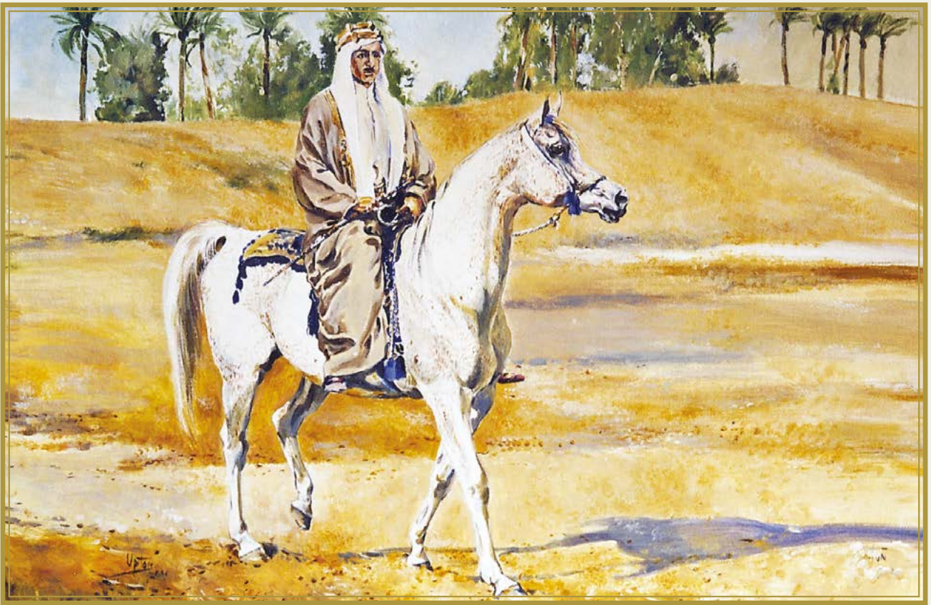
“The Sheykh’s Favorite”