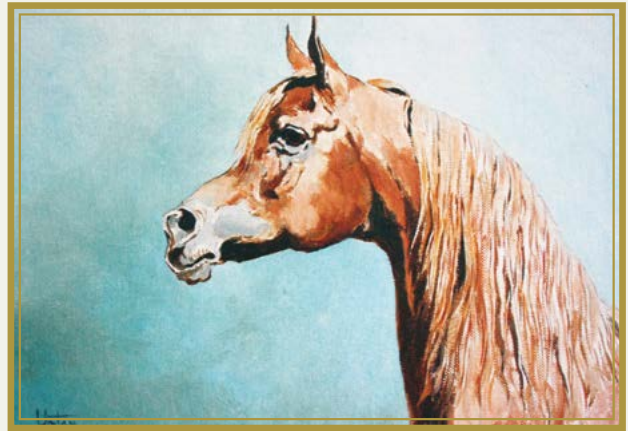
“A Chestnut Mare – head study”