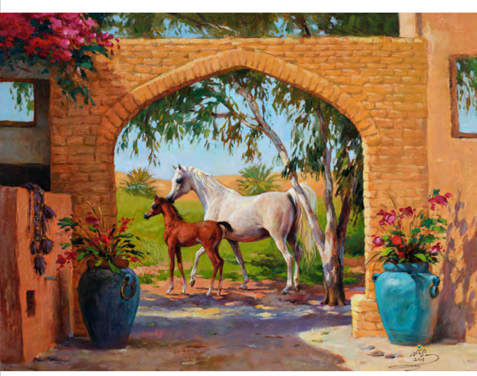
A Tale from Alzobair