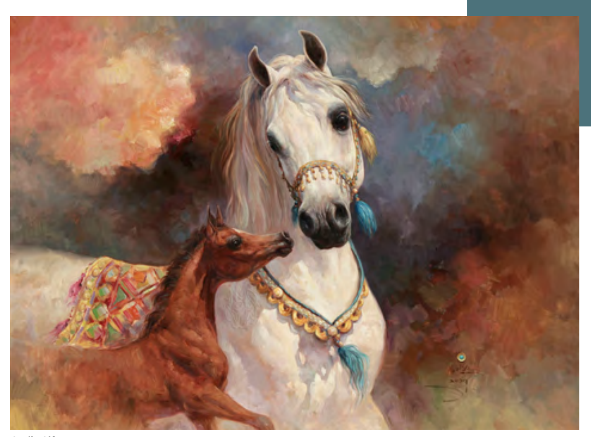
God's Gift An Unconditional Love