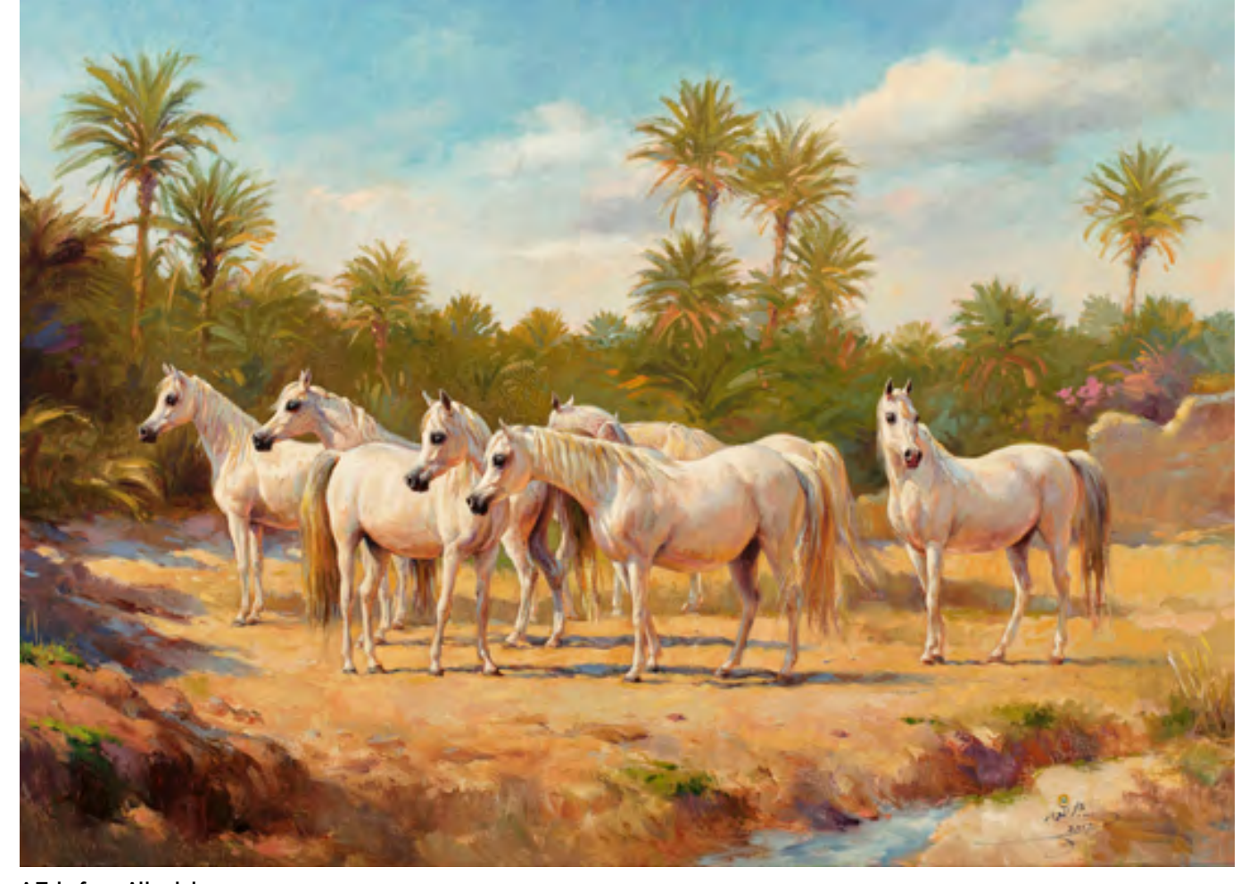
A Tale from Albadeia Dreamy Visions