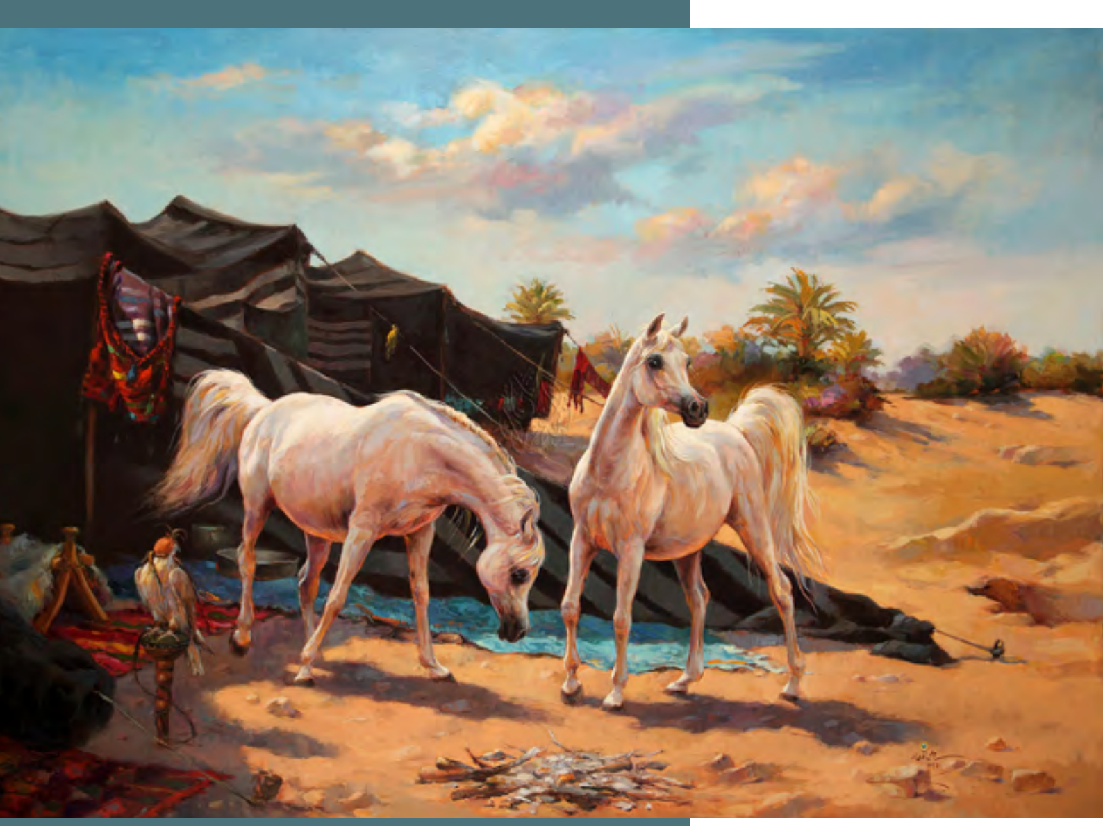
Longing For The Past