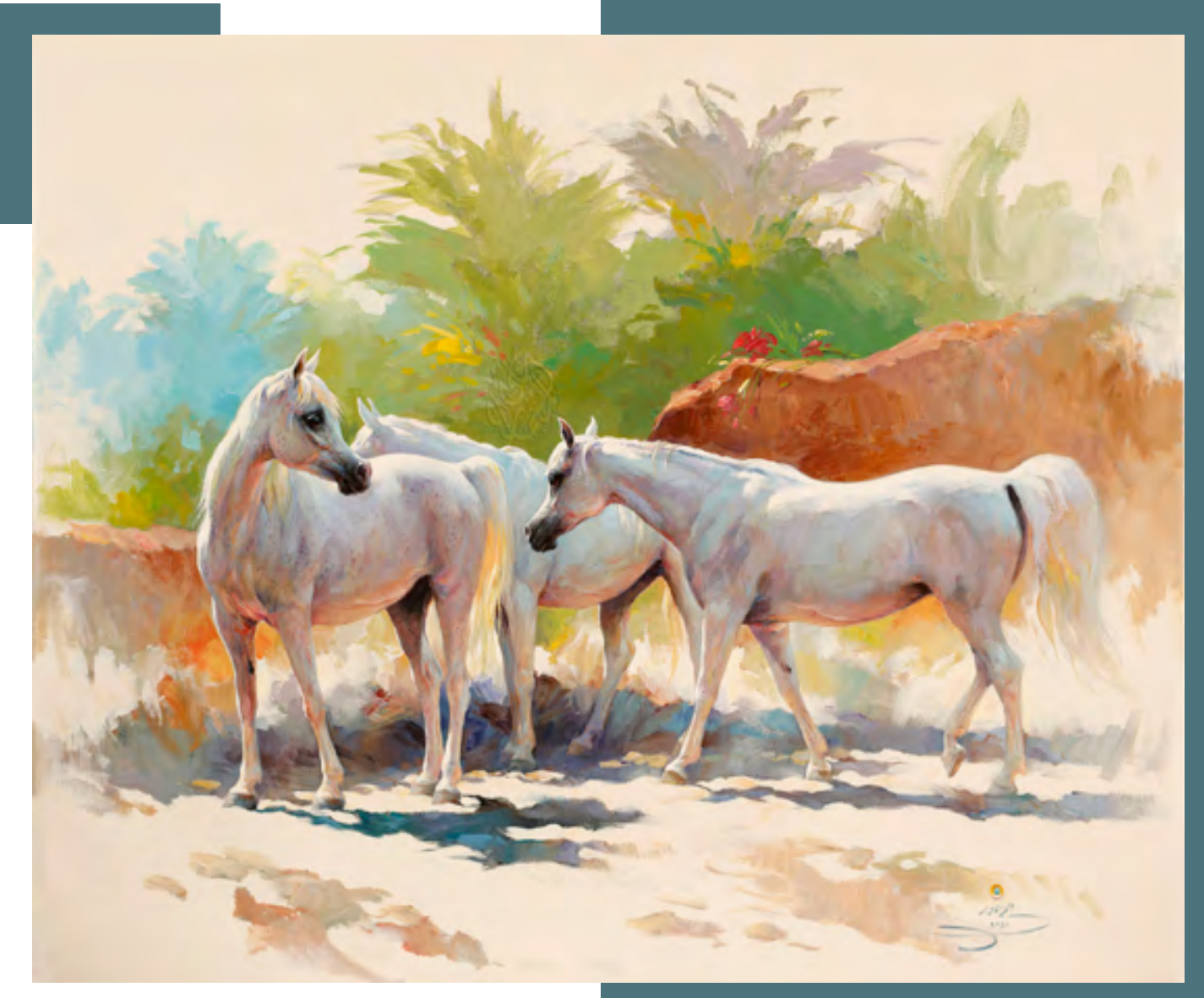
Journey with the sun