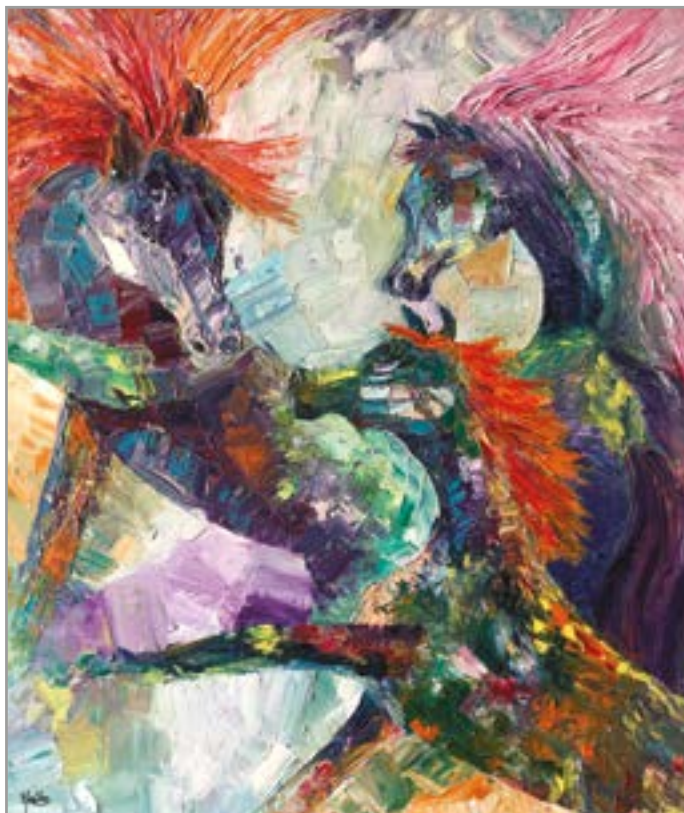
Sweet Time 2019 Oil on Canvas | 46x 55 cm