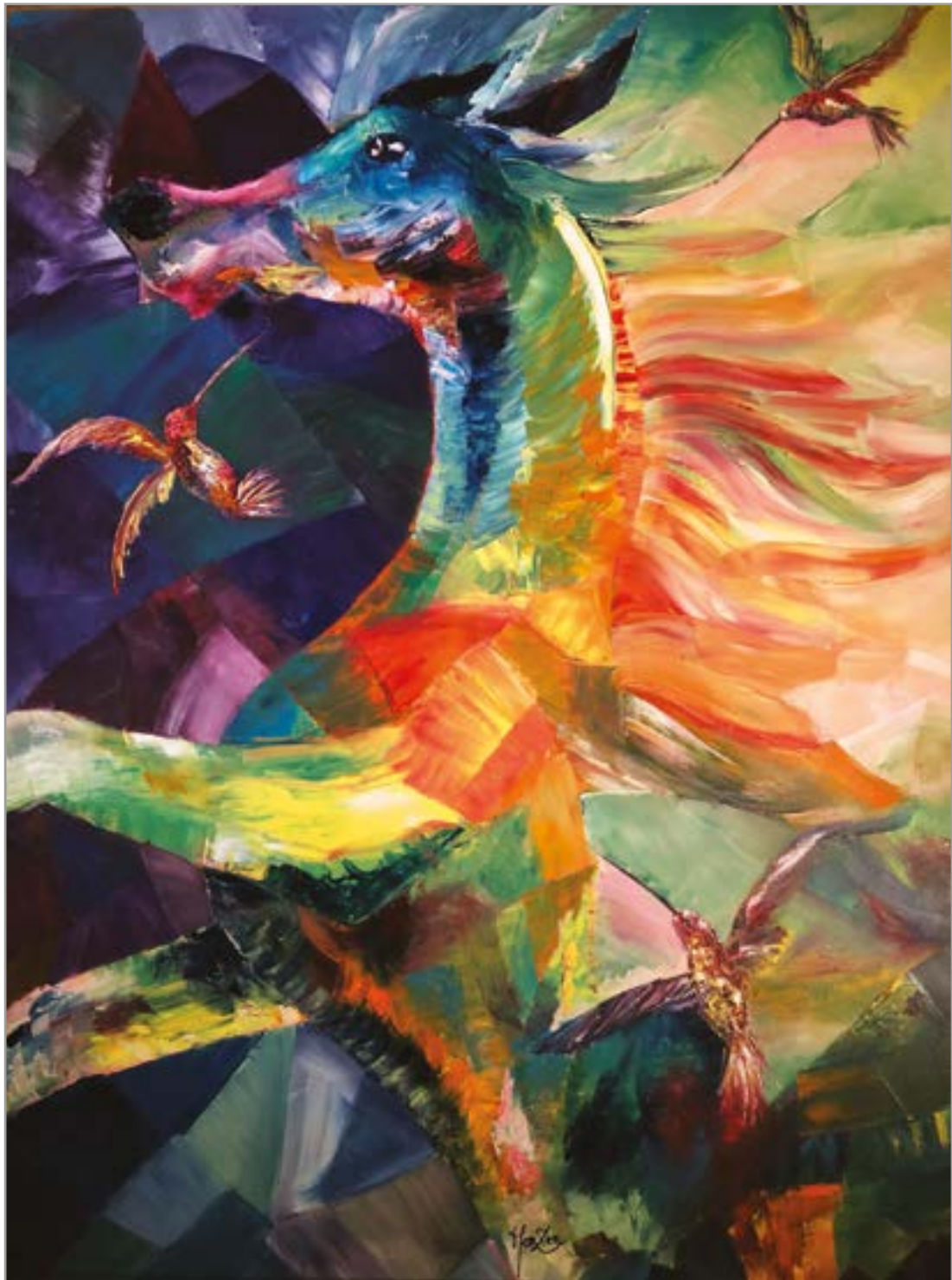
Horse Power 2019 | Oil on Canvas 30x40 inches