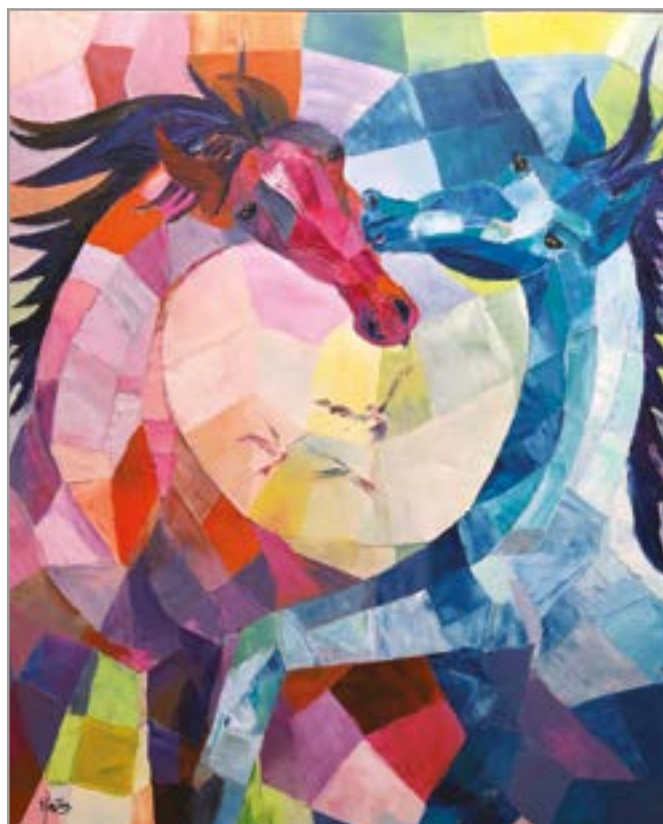
Love in the Air 2020 Oil on Canvas | 71x100 cm