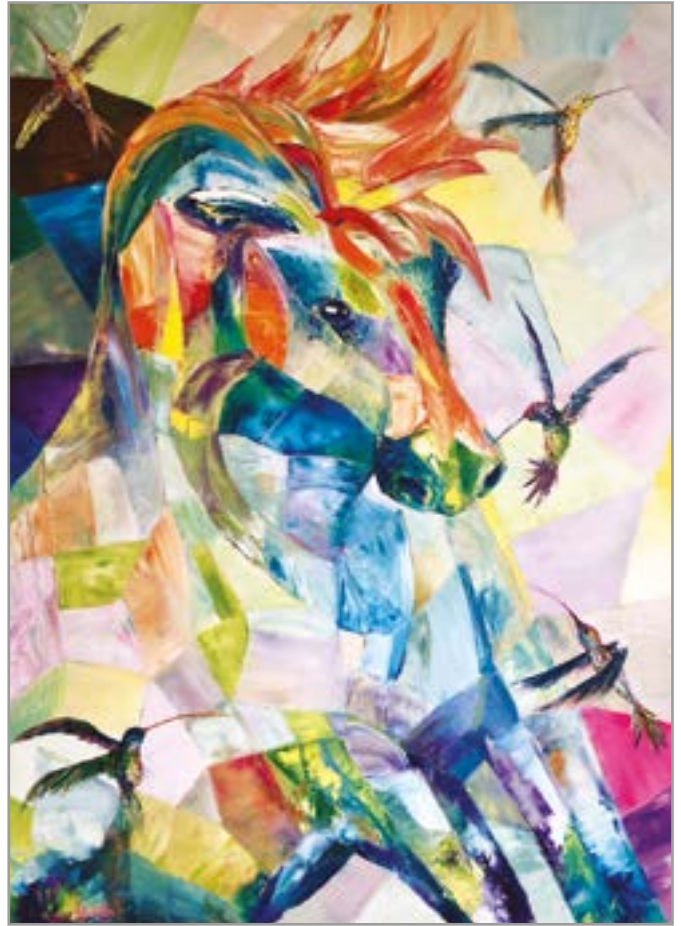
The First Lady Oil on Canvas | 30x40 inches