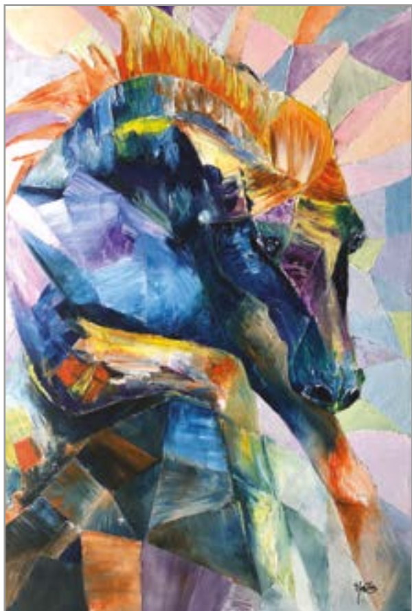
Horse on Fire 2018 Oil on Canvas | 24x36 inches