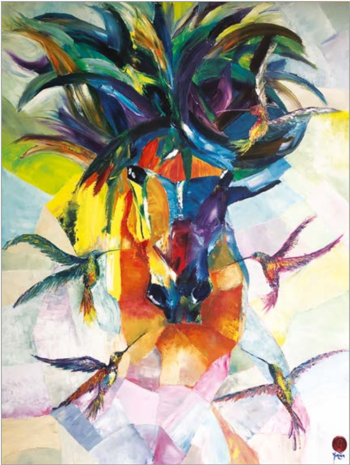
Le Magnifique | Oil on Canvas 30x40 inches