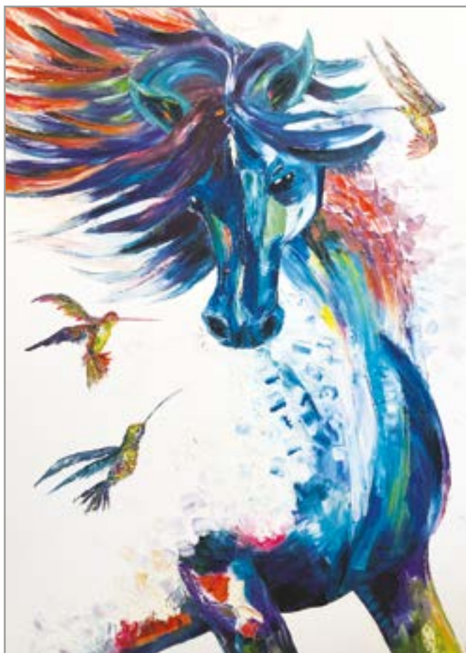
Free Spirit 2019 Oil on Canvas | 30x40 inches