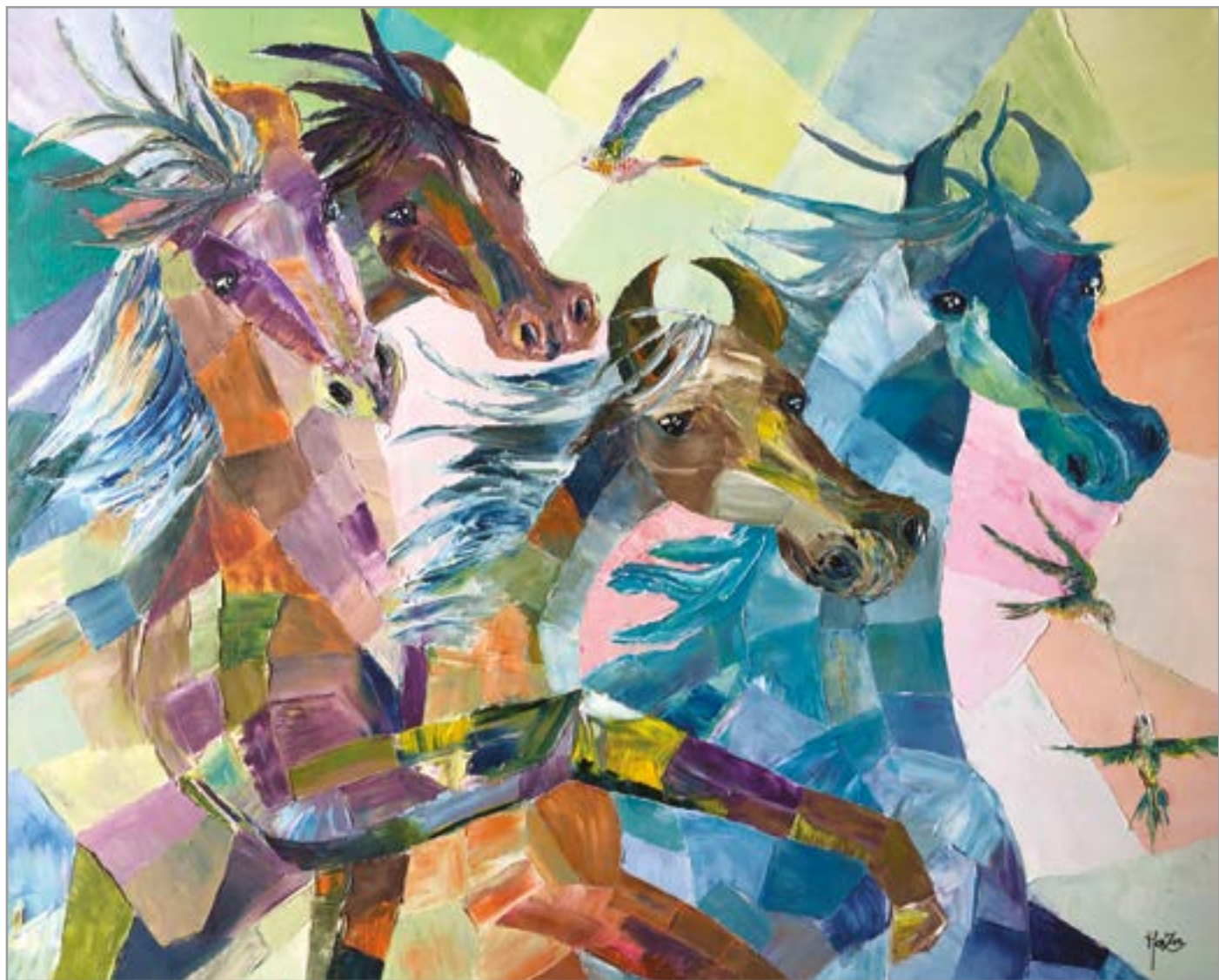
Four Generations 2020 | Oil on Canvas 80x100 cm