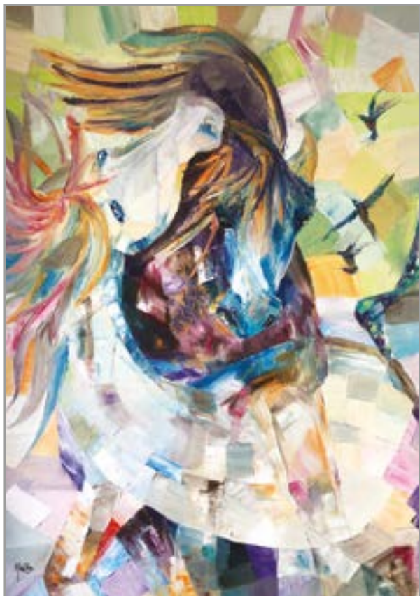
Play Ground 2020 Oil on Canvas | 92x65 cm