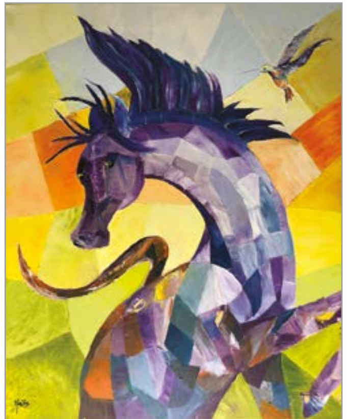
Joyful Moment 2020 Oil on Canvas | 81x100 cm