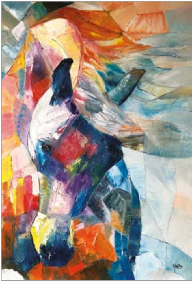
Heritage 2018 Oil on Canvas | 24x36 inches Award: 2019 GAMMA Best Young Artist of the year, Paris, France