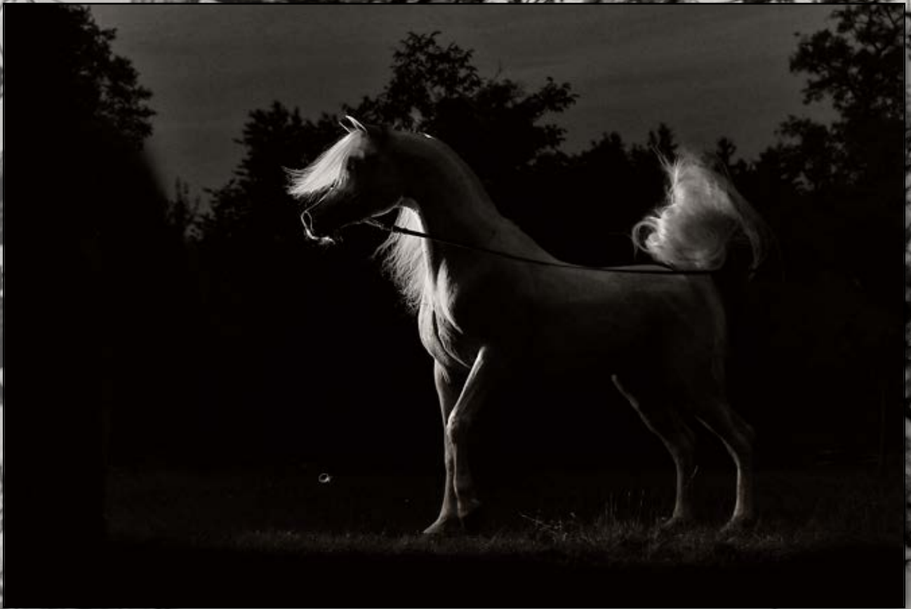
Al Ayal AA