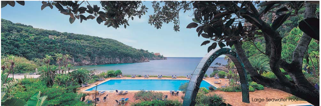
Large Seawater Pool