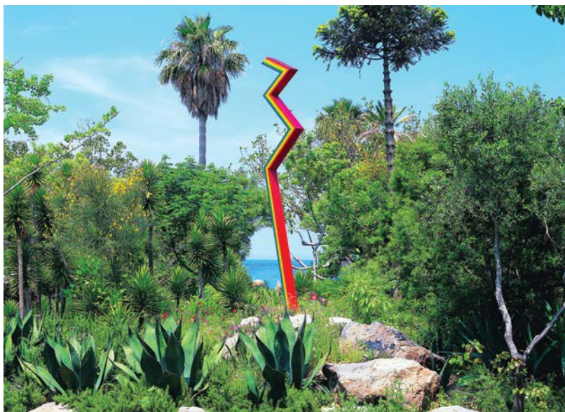
"Strale per il Negombo" - Lucio Del Pezzo, 2003