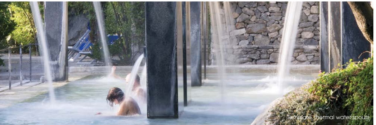
Templars, thermal water spouts