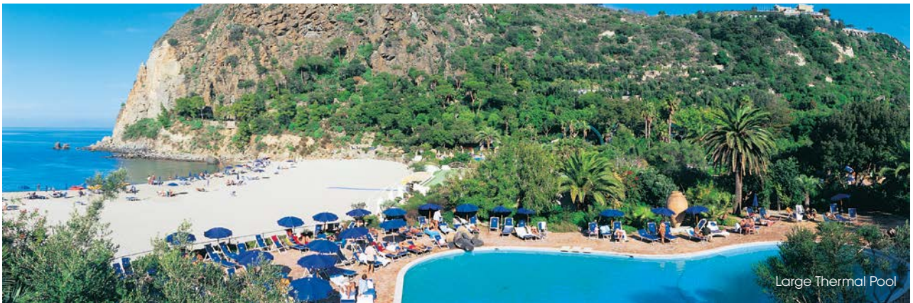
Large Thermal Pool