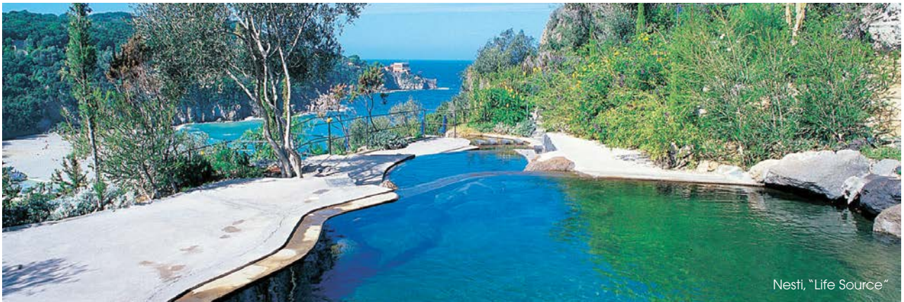
Nesti, "Life Source"