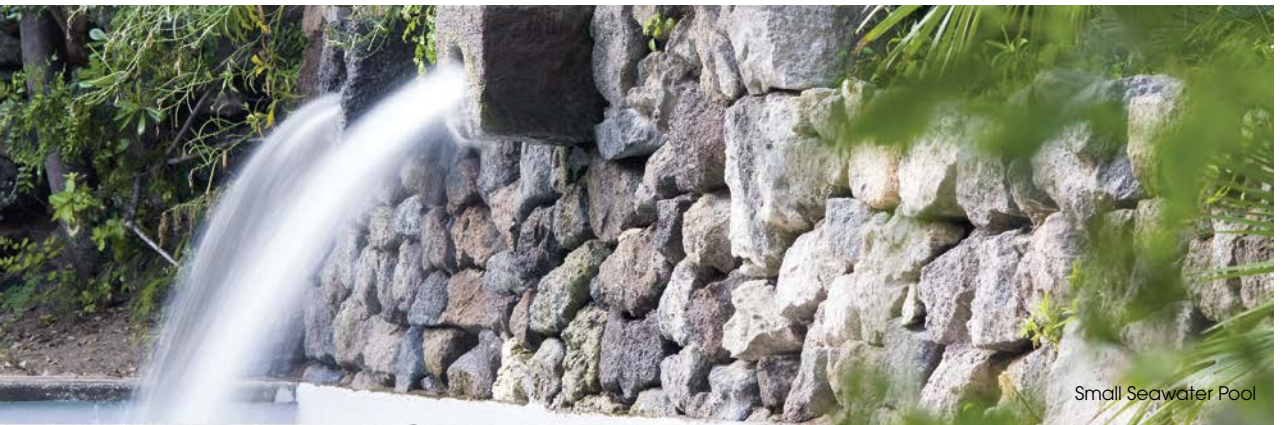
Small Seawater Pool