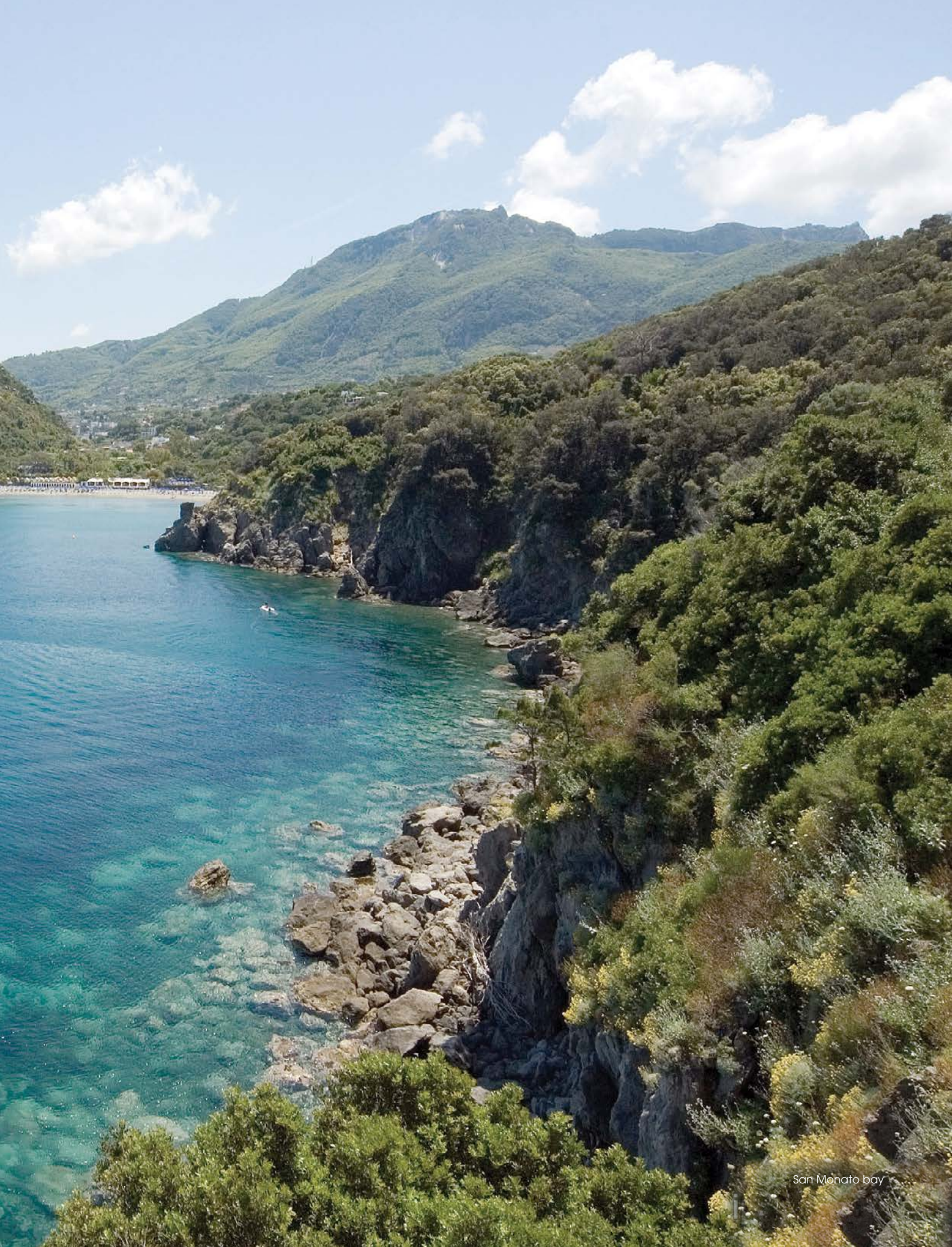
San Monato bay