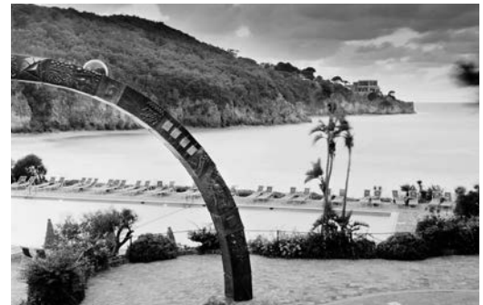
"Arco in Cielo" - Arnaldo Pomodoro, 1998