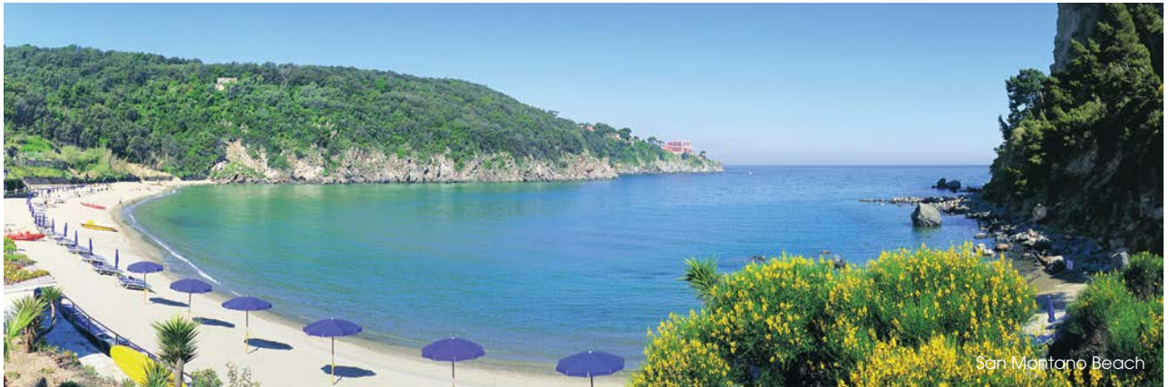
San Montano Beach