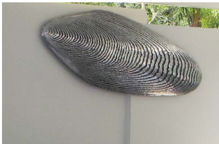
"Rive dei Mari" - Arnaldo Pomodoro, 2015