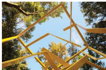
"Sprigionamenti" - Gianfranco Pardi, 2015