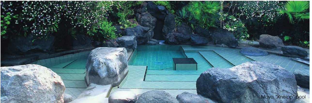
Maya, "Kneipp" pool