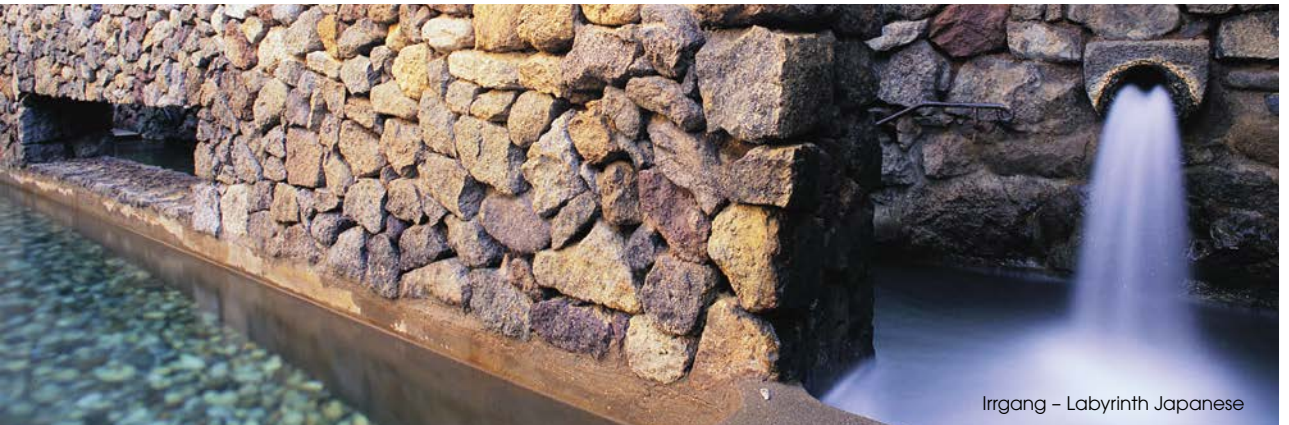
Irrgang - Labyrinth Japanese