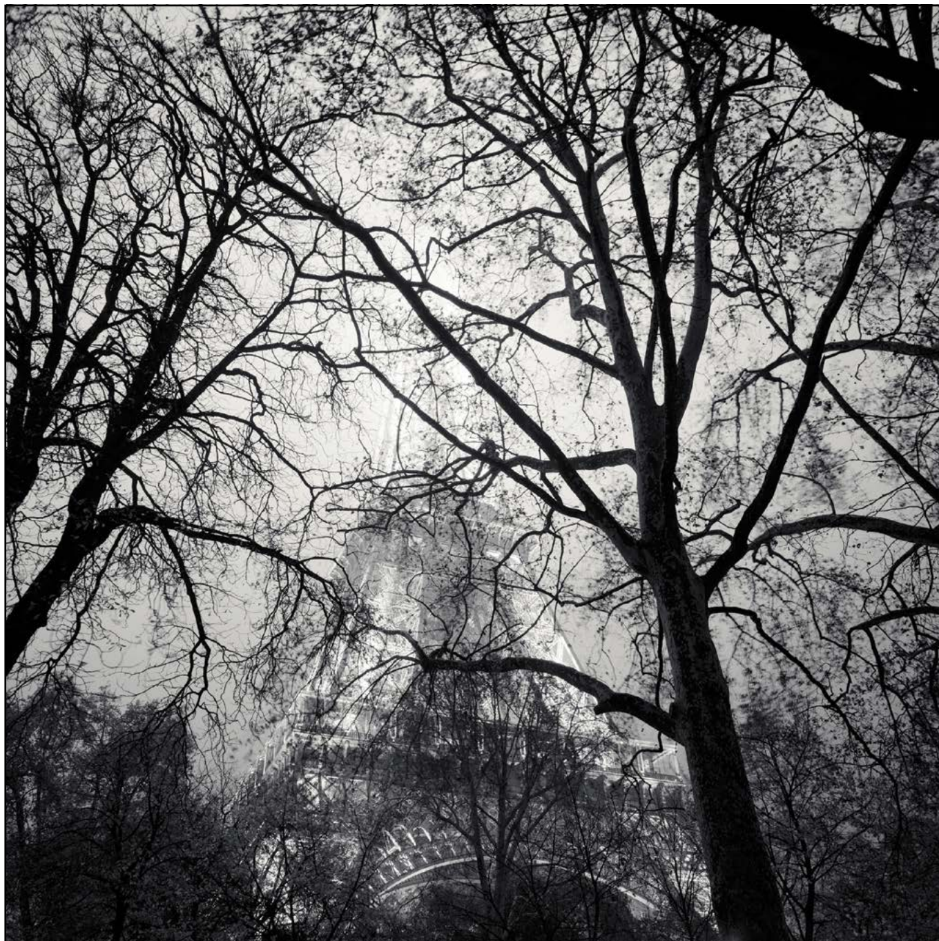
Paris, La Tour Eiffel La Nuit