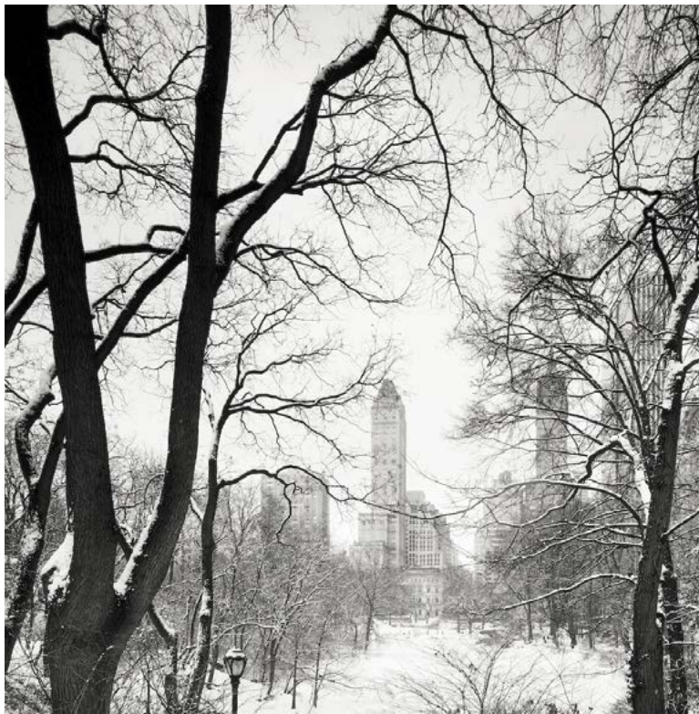
New York City, Central Park, 2011