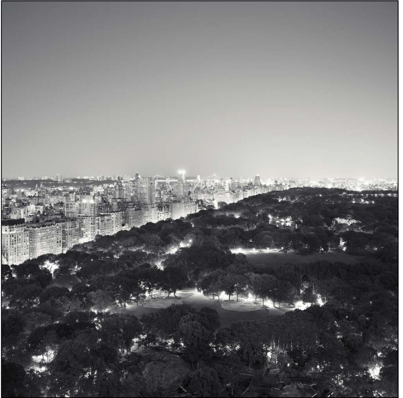
New York, Central Park Nights West