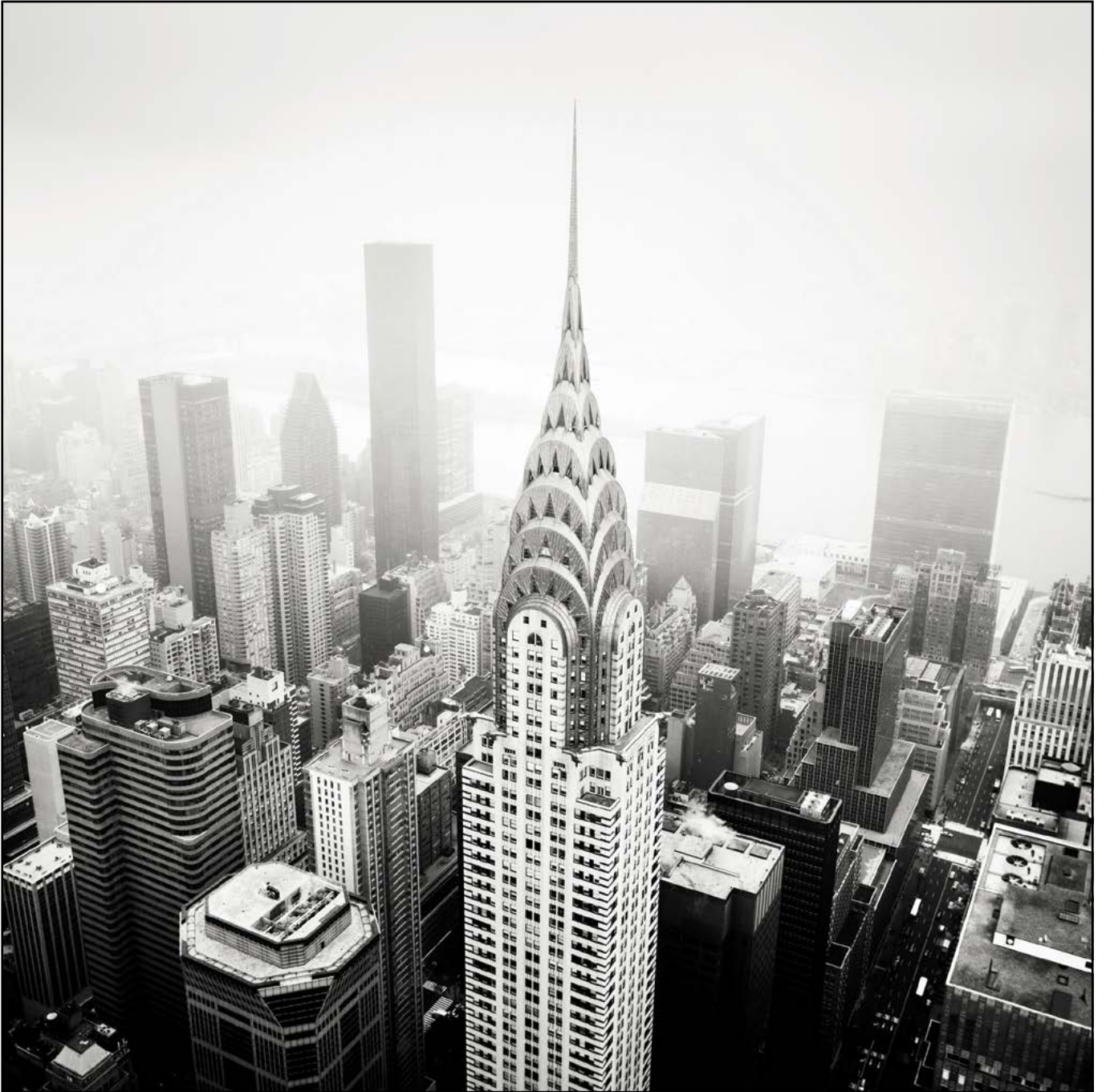
New York City, Chrysler