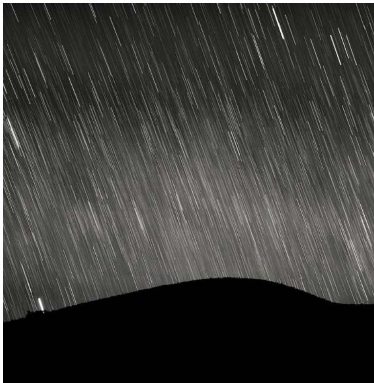
Hawaii, Stargazer Mauna Kea Volcano