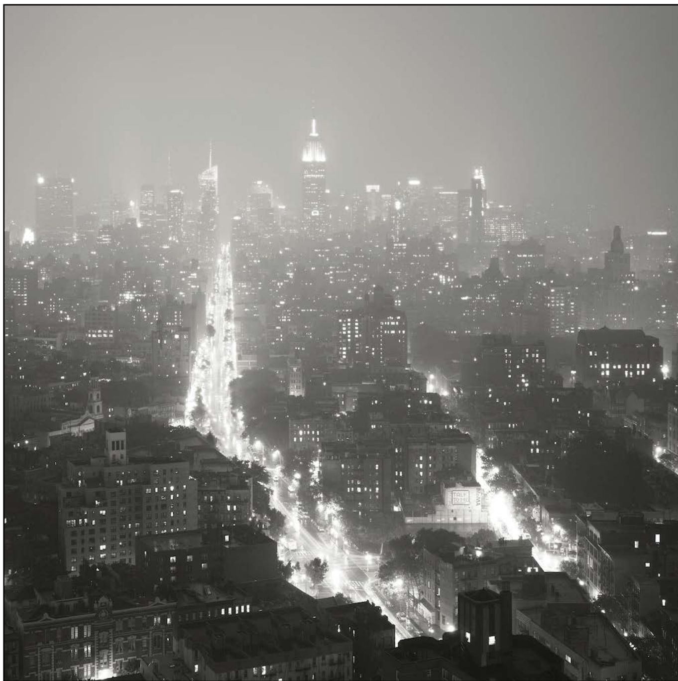
Gotham City, 2011