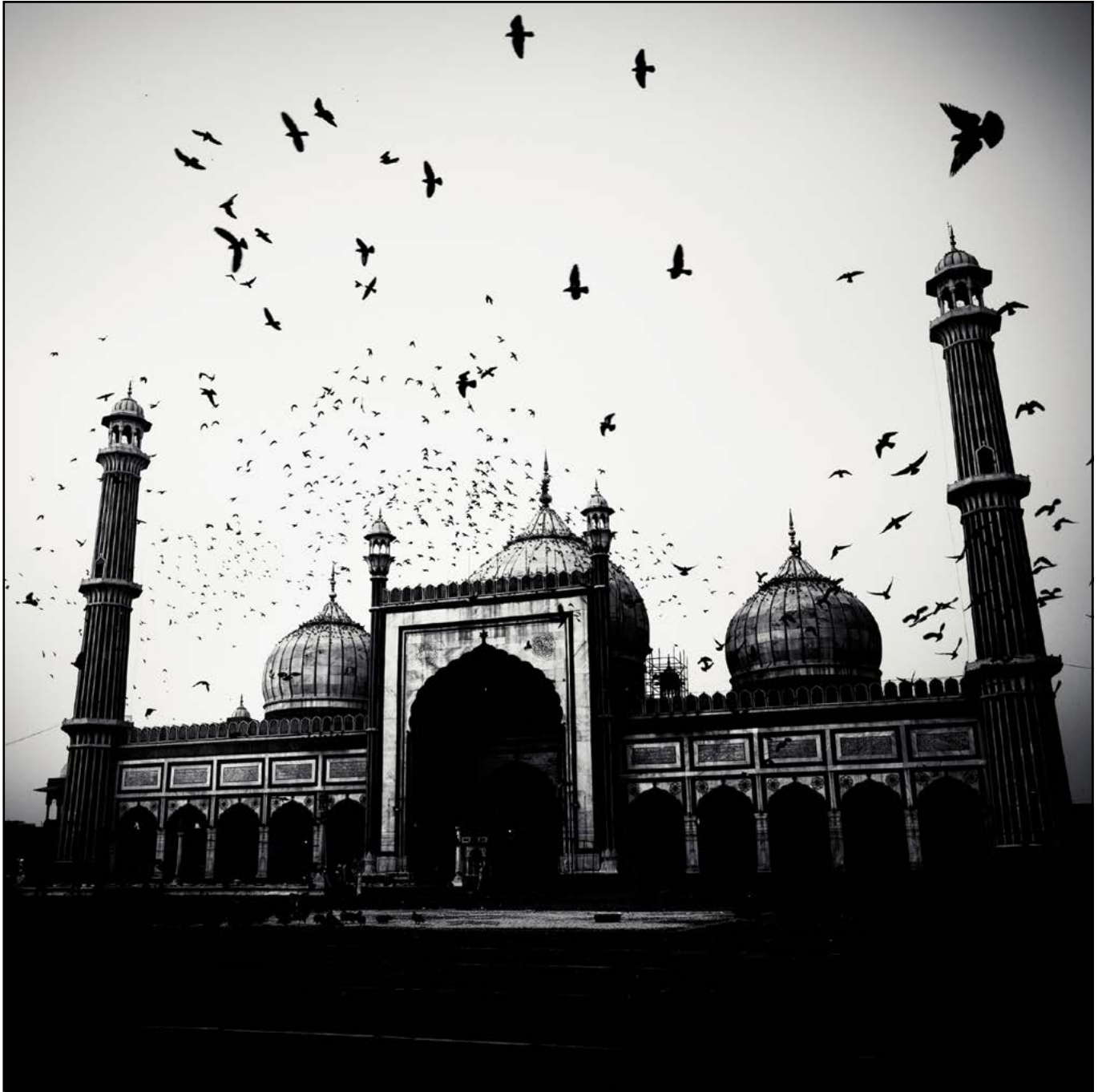
Mosque and Birds