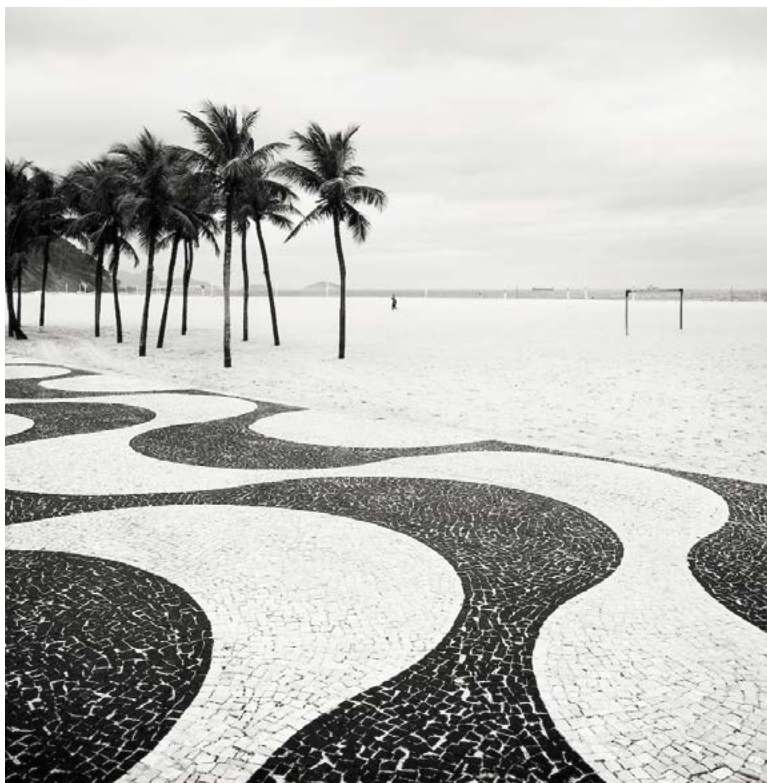
Copacabana, palms, 2010

Each of Hoflehner's photographs achieves a perfection of composition that seems to defy the possibility that it could ever be seen any other way. Gripping in their ultimate solitude and the unexpected natural beauty they capture, Hoflehner's photographs take his earthly subject matter to raise it to an almost mythical level, defining the essence of the place. In these rare and elusive moments, the natural and the man made are brought together in a poetic interplay of light and shadow, emptiness and structure. Through his images, we are moved to a new level of observation and exposed to a world where the chance and an underlying natural order coexist with our own built environment.