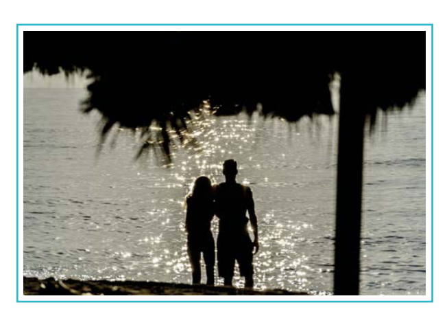
VISIT ForteVillage .com