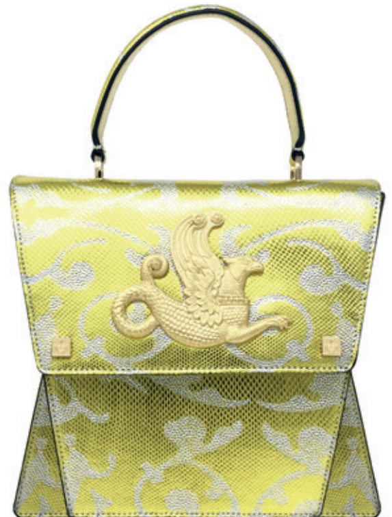
HOURGLASS Bag in Karung Snake

Italy Bag: is a bag dedicated to Italy, its beauty and its diversity in the world. It is composed of three distinct parts, linked to the colors of the Italian flag but also to the three Italian forces, north, center and south that together create a reality unobtainable in the rest of the world, a reality in which art, history and culture are born.