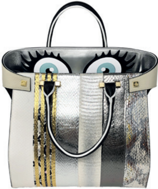
Paloma Bag in Metallic Snake

A collection that celebrates good taste for ideas, filtered through the joyful irony characteristic of the brand, which shuns any garment of excessive seriousness. A research that is expressed in its highest degree with a new decoration, which celebrates the brand's iconic Griffin logo in a rampant guise, to protect a fluid world in constant evolution and change.