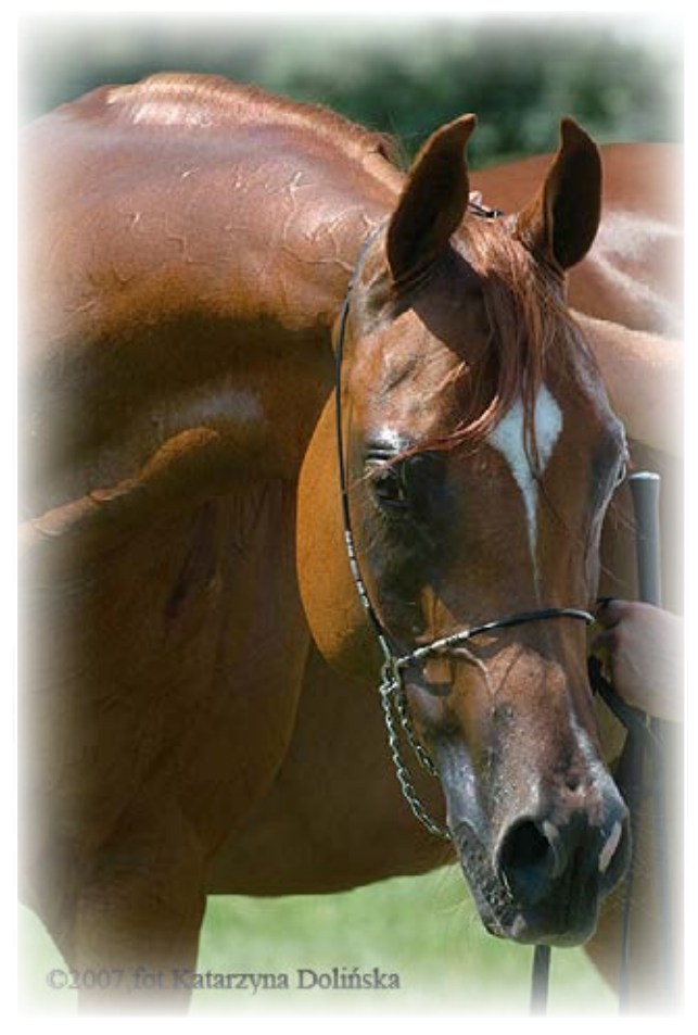
PRIMADONNA (PADRONS PSYCHE X PELARGONIA)

What we can suggest you is a visit at his farm on the occasion of one of the many important shows that are held in Poland every year. Wish you to enjoy the atmosphere at Grabow Nad Pilika Stud!