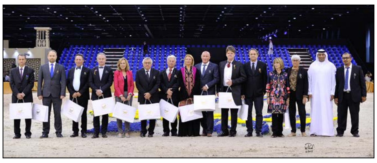
IN DUBAI 2017