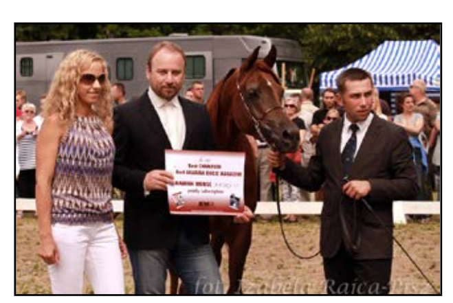
DAISY FF (DA VINCI FM X AP SHEEZ SASSY)