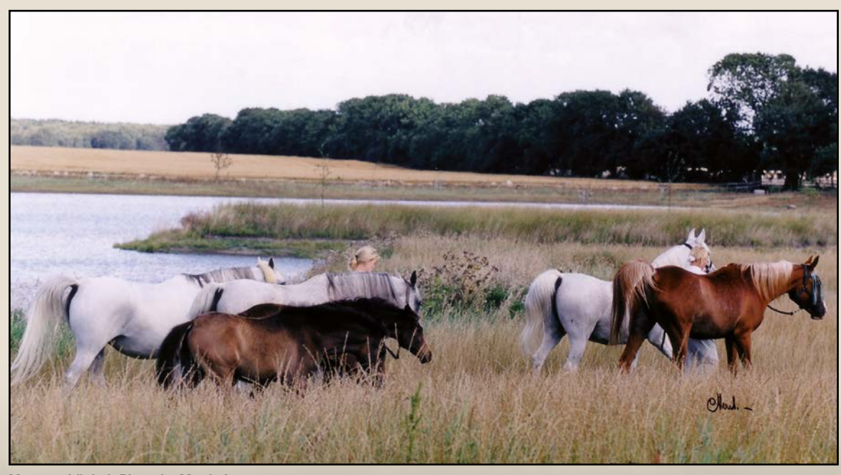
Mares at Lönhult