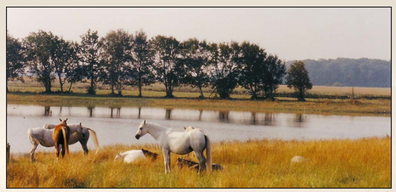
Summer at Lönhult.