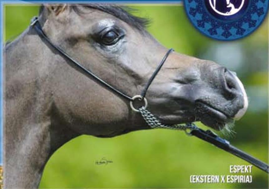
ESPEKT (EKSTERN X ESPIRIA)