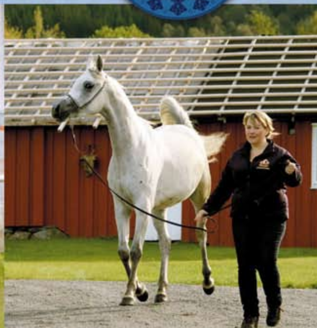
GRACE BINT PACHA (AS SINANS PACHA X MOKSIIS)