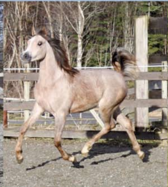
PEARL BINT AJMAN (AJMAN MONISCIONE X PANAKEJA)