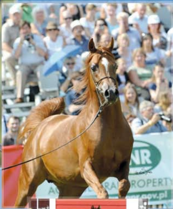
ETERNAL (FS BENGALI X EWITACJA)

FIRST ETERNAL FOAL BORN IN NORWAY 3 DAYS OLD