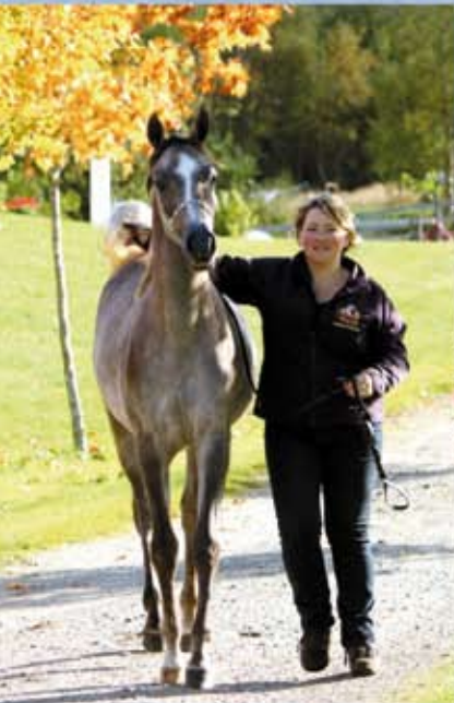
SOPHIA BINT PACHA (AS SINANS PACHA X AR SIDONA)