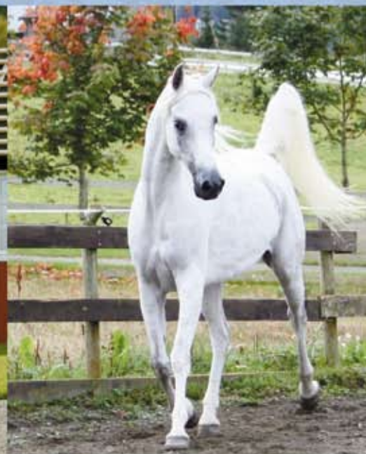
SERAFINA (CLASSIC SHADWAN X SAJIDA)