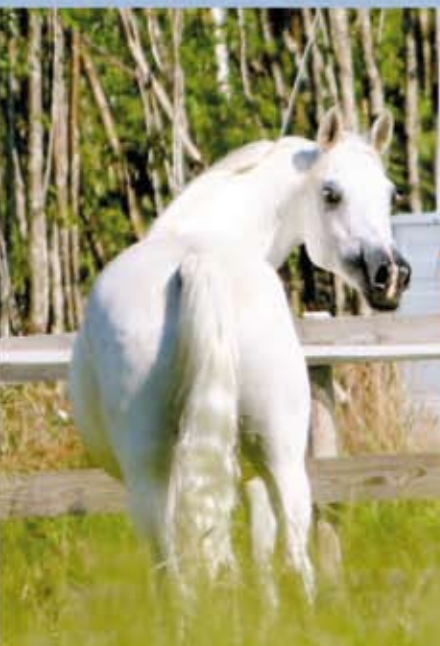
MADONNA BINT PACHA (AS SINANS PACHA X MOKSIIS)