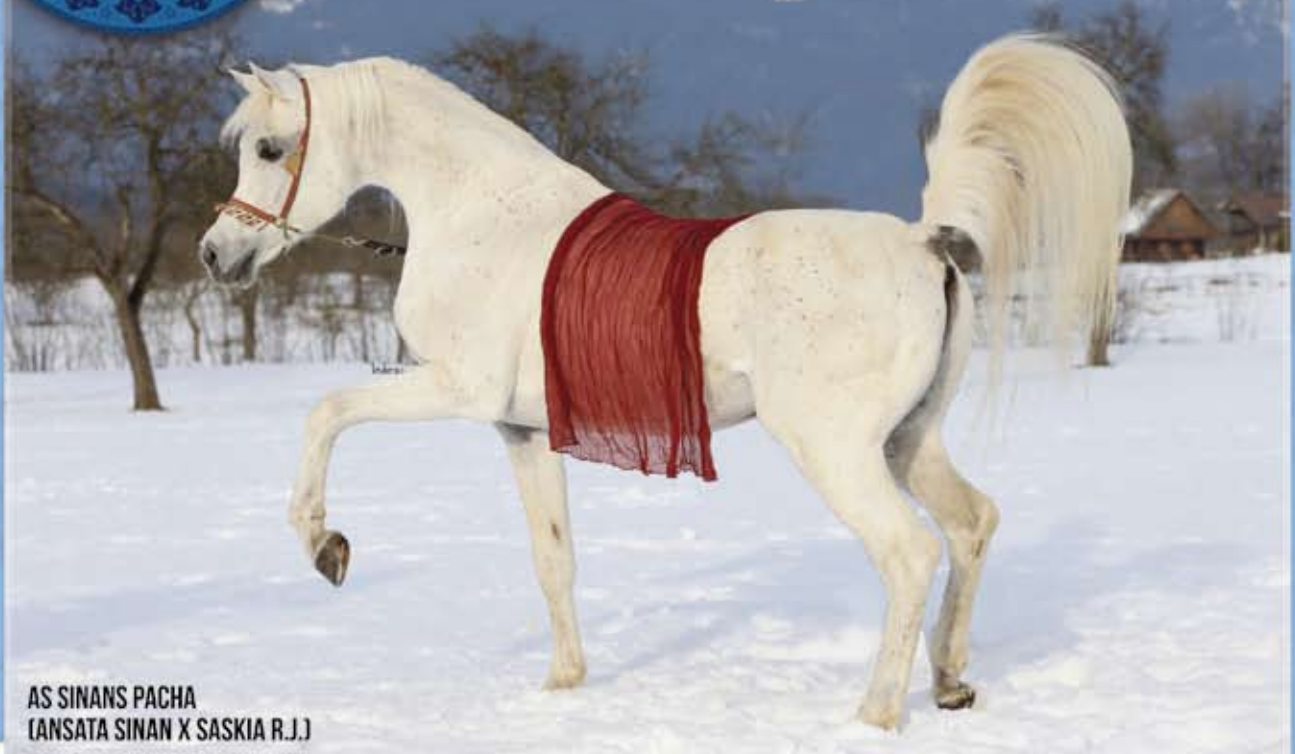
AS SINANS PACHA (ANSATA SINAN X SASKIA R.J.)

Interview by: Urszula Łęczycka-Abdelaziz