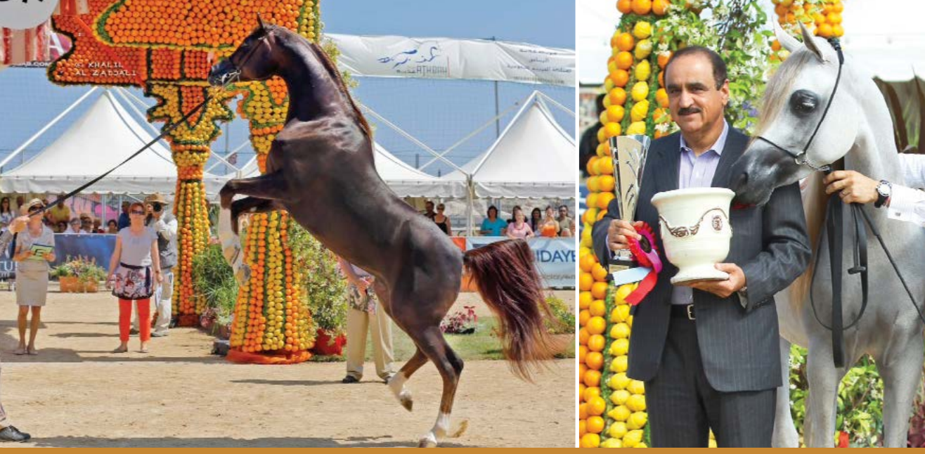
MENTON 2013 AJA EUROPA AND BRIGADIER ABDULLRAZAK AL SHAWARZI FROM THE ROYAL CAVALRY OF OMAN