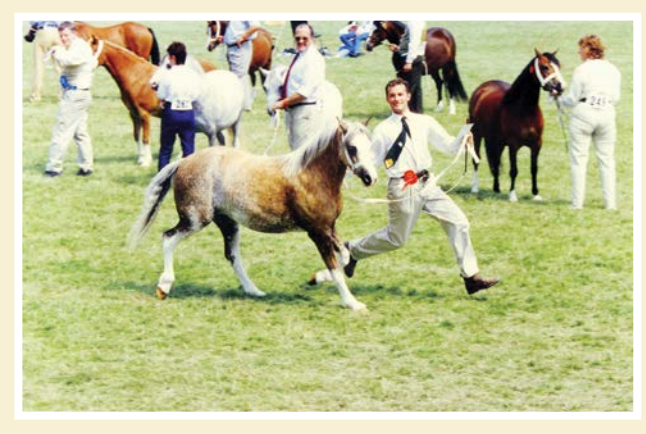
Winning out of 83 entries at the Royal Welsh Show