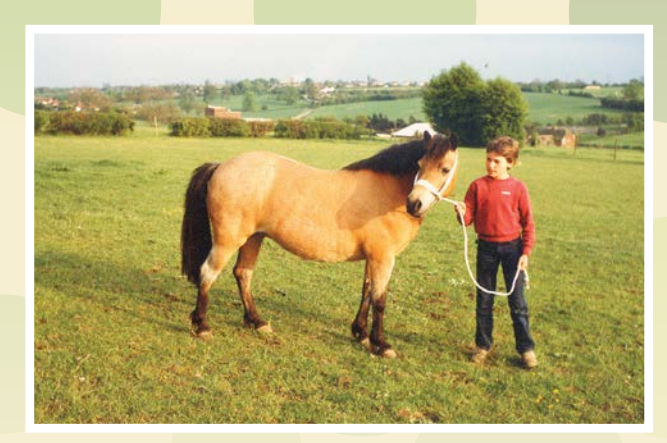
Age 7 with Pontylis Celeste my first pony