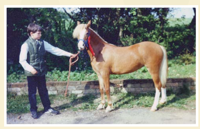
Age 10 with Bengad Red Nerine Reserve Champion