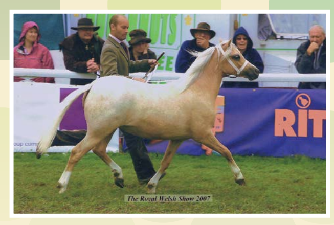
Vervale Gift of Gold