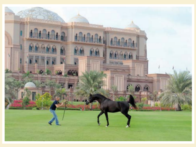
Emirates Palace Hotel