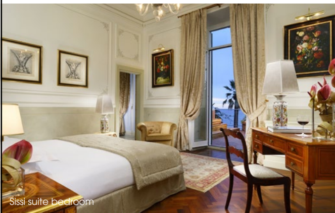
Sissi suite bedroom