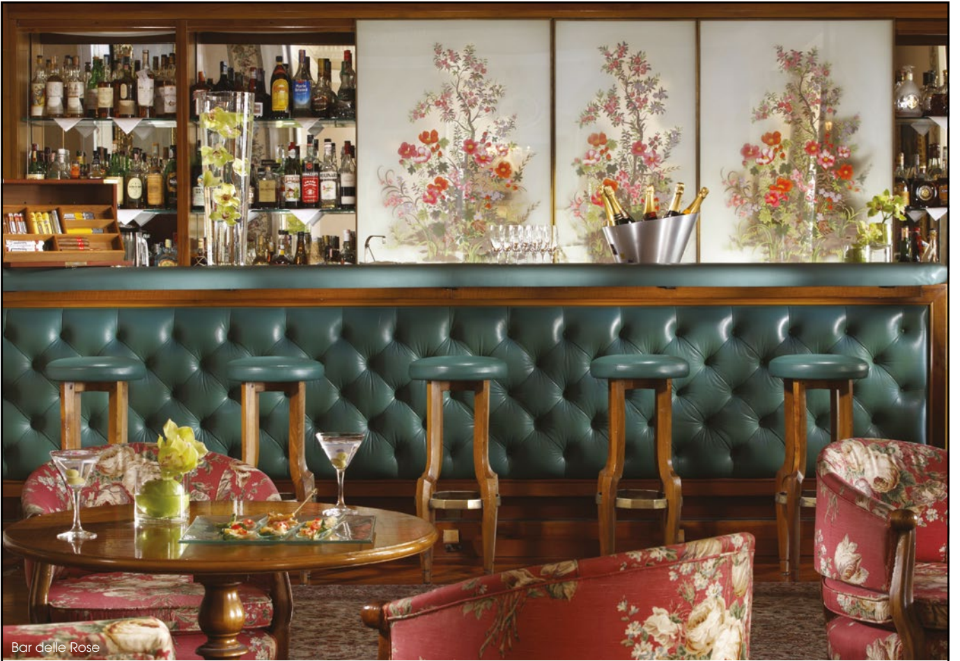
Bar delle Rose