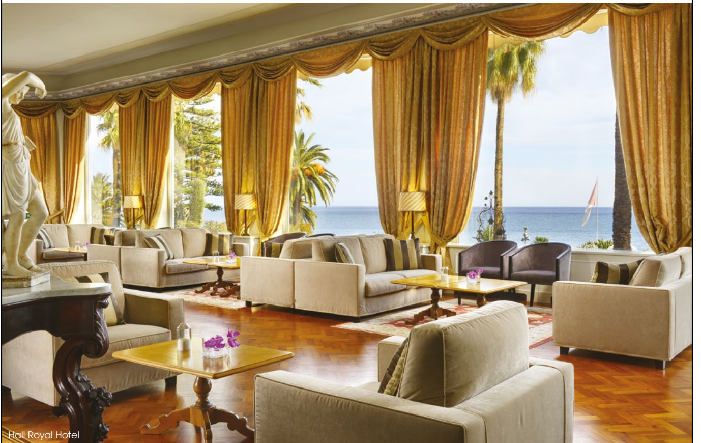
Hall Royal Hotel