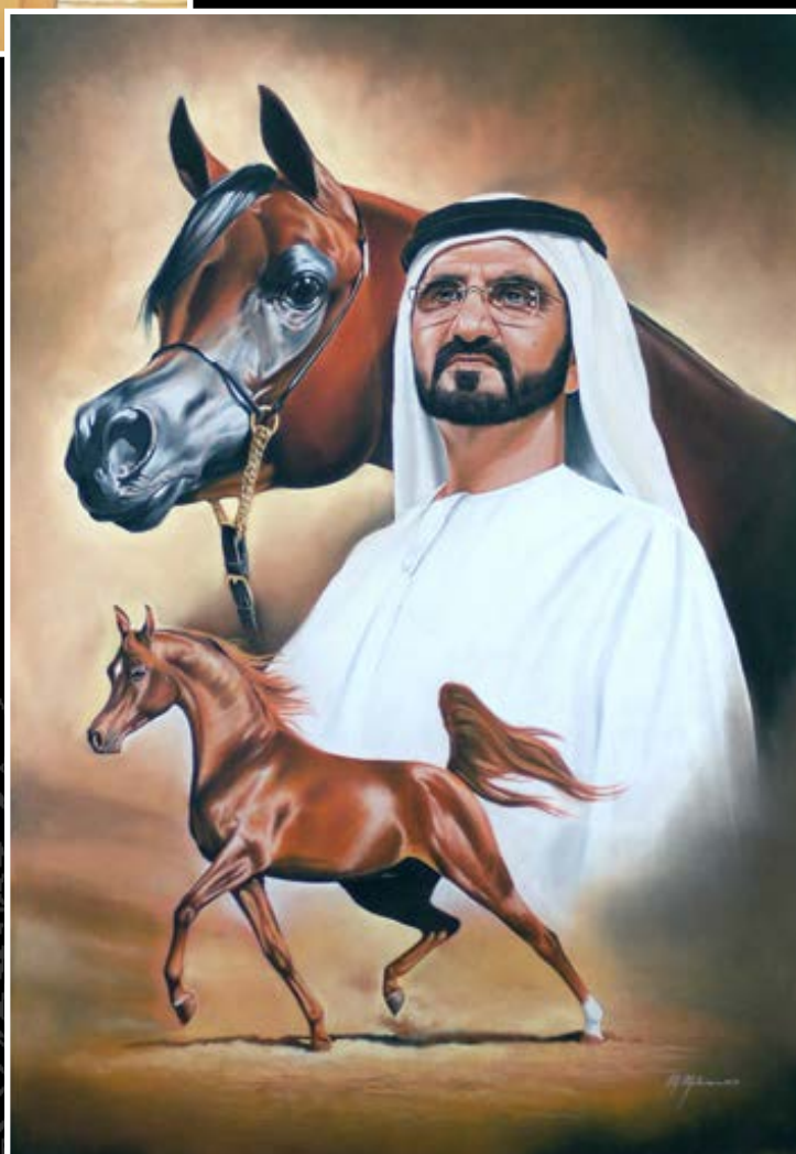
HH Sheikh Mohammed Bin Rashid Al Maktoum Portrait in pastel. Size: cm. 70x100