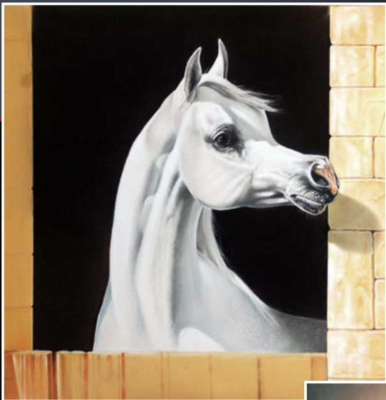
The Stallion Portrait in pastel Size: cm. 80x80