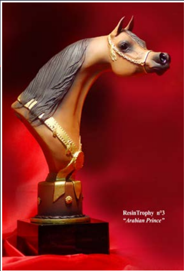
Resin Trophy n°3 "Arabian Prince"