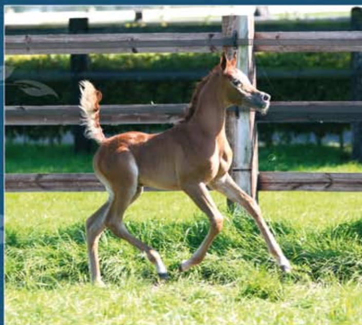
Hanaya Habibtee (El Khaled x 218 Elf Layla Walayla)