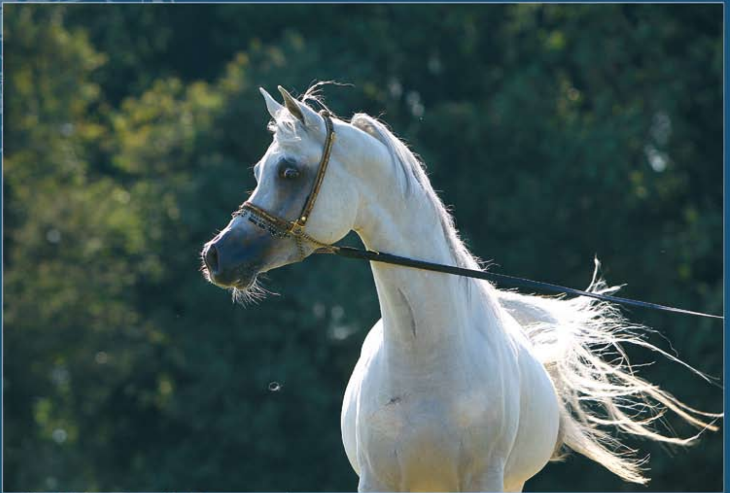
El Khaled (Ansata Sinan x Shahirs Abriel)