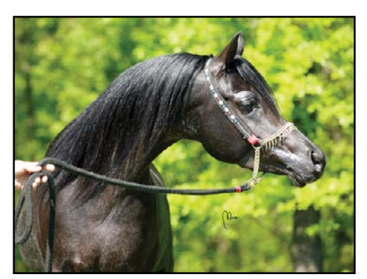
KZ Mash'haar (Al Maraam x Lady of the Evening)