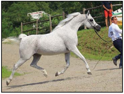
Petit PS (Lucky Dream x Petreena), 2002 grey mare