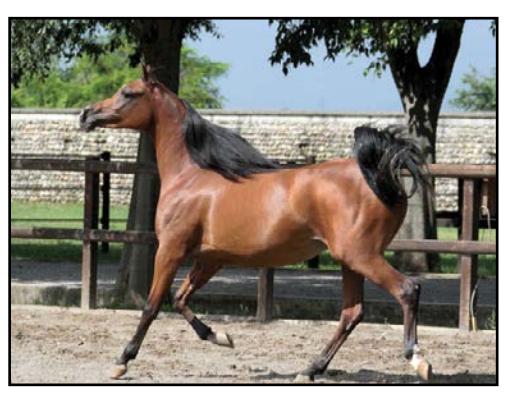
Demetra Regalis (Psyrasic x Chawiy NA), 2010 bay filly