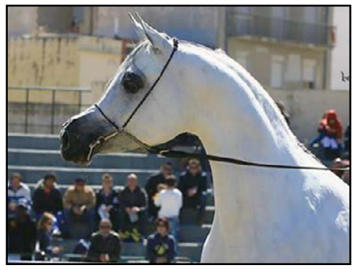
Aretusa MalikShah (Ansata Malik Shah X MB Sateena)