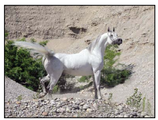
Aretusa Malik Shah (Ansata Malik Shah x MB Sateena), 2005 grey stallion