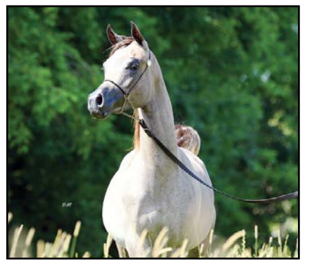
El D'Gyo AO (Makisa Adaggio X Nesj El Kyara)