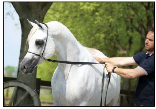
Al Ayal Moniscione (Al Ayal AA x Ariel Moniscione), 2012 grey colt

the breeding game. We have an Egyptian related mare that we breed to our standing stallions and we are trying to lease some mare bred by our friends to get our next champion. We don't follow a particular bloodline but for sure we are looking for show horse lines to obtain a good foal to show.