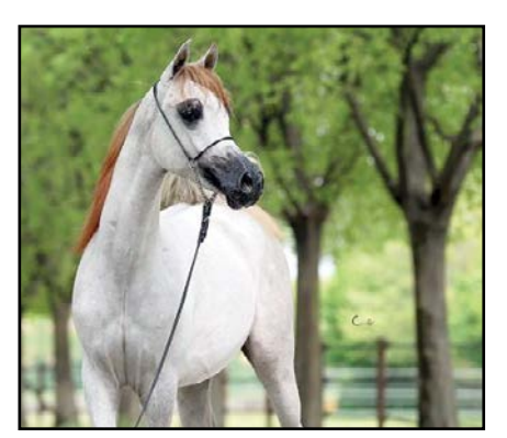
SS Leandro AH (Shanghai EA X Nadara KA)

LO: In the past my father used to breed straight Egyptians but the lack of time and space led us to reduce a lot