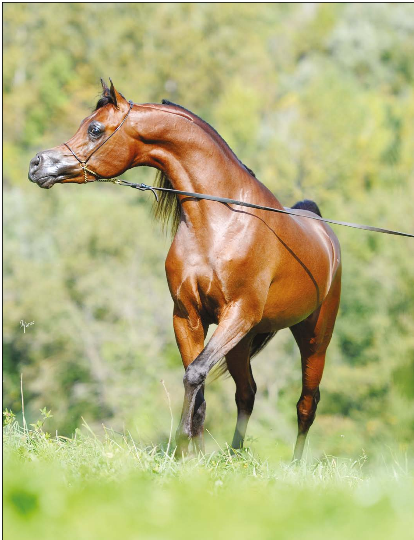
FA El Rasheem