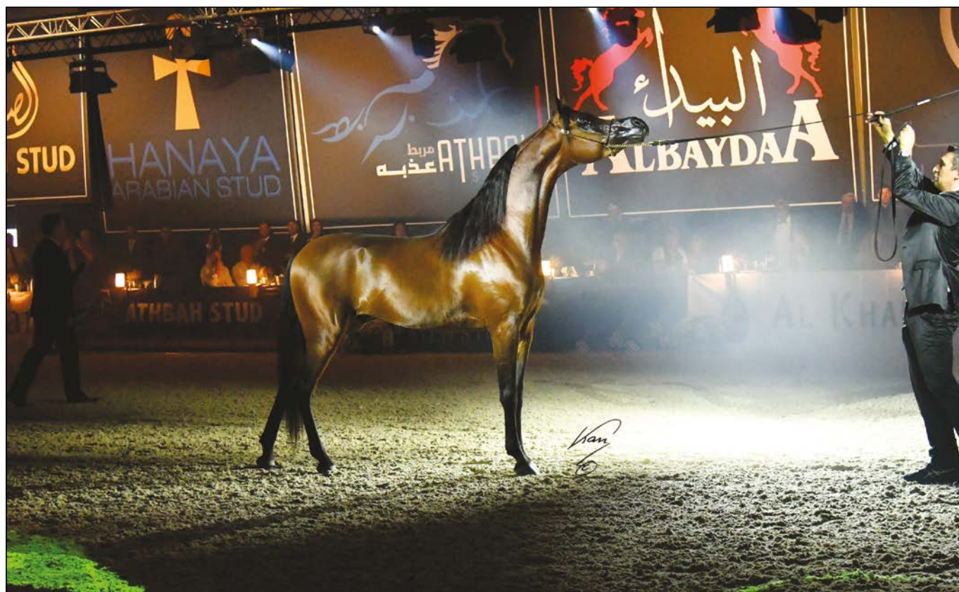
FA El Rasheem

With five crosses to Bey Shah (Bay El Bay x Star of Ofir), three to Nazeer (Mansour x Bint Samiha), three to Fame VF (Bey Shah x Raffoleta-Rose), and two each to Bask (Witraz x Balalajka) and Versace (Fame VF x Precious as Gold), it is clear