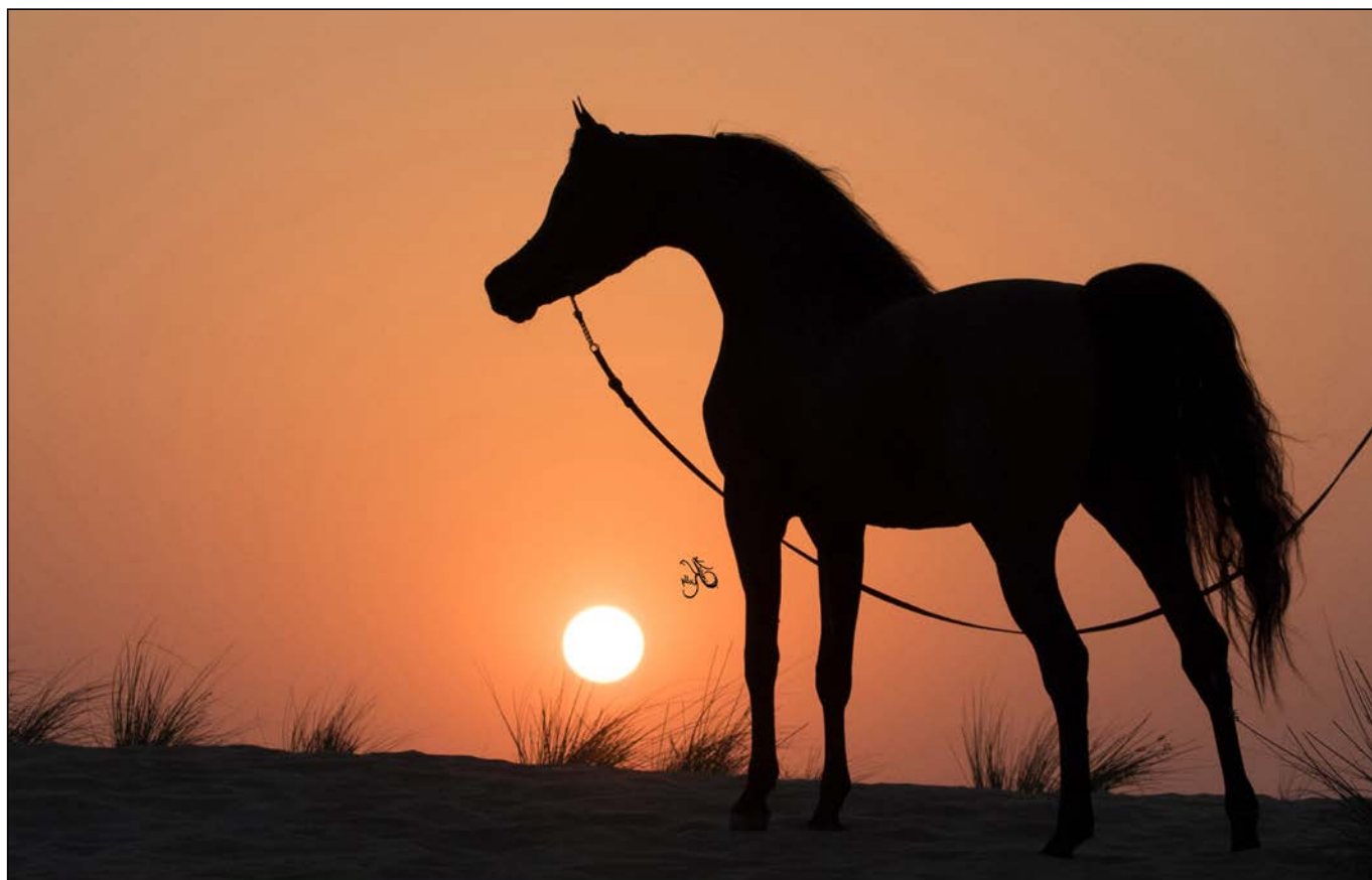
FA El Rasheem