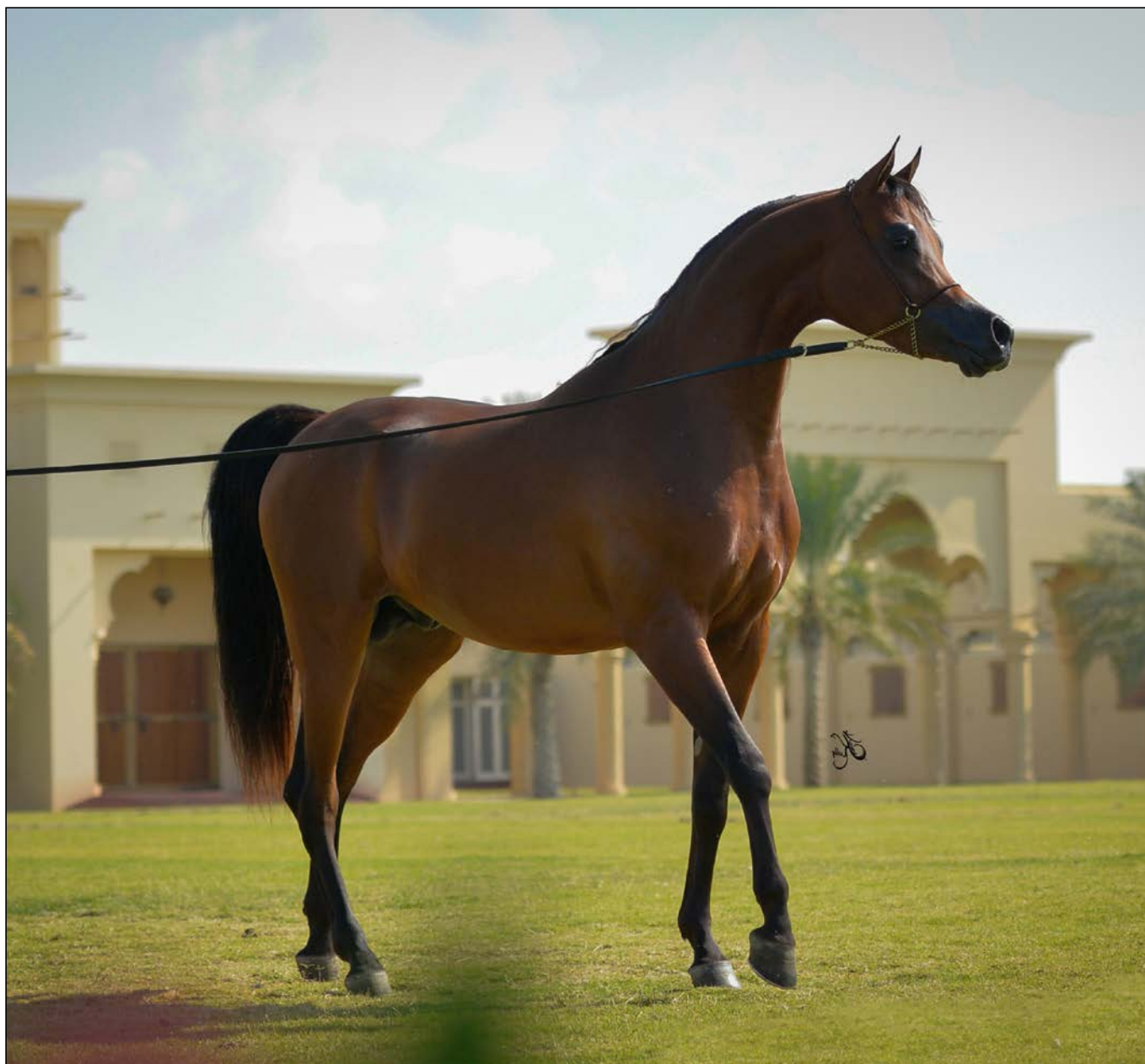
FA El Rasbeem

package, D Seraj had all the ingredients necessary to make an impression; and he certainly did in his yearling year! Naturally showy, this grey colt won his class at the 2016 Ajman Show and took the Gold Yearling Male Championship. At his 'home' show, the Dubai International Arabian Horse Championships, D Seraj was successful once more, as he again won his class and took the Yearling Male Championship title.