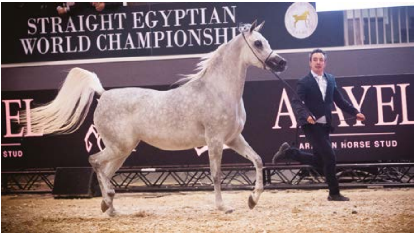
TB Fayza (Jamil Al Rayyan x TB Helwa), Gold Champion at the int. EE in Bergamo and Top Five at the SEWC in Milan 2019. Bred and owned by Tre Balzane Stud.