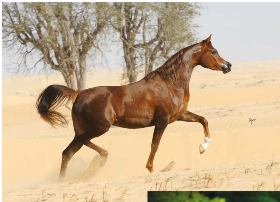
AV Dalia ( AV Dolimba x Ajman Moniscione ) 2009 chestnut, mare