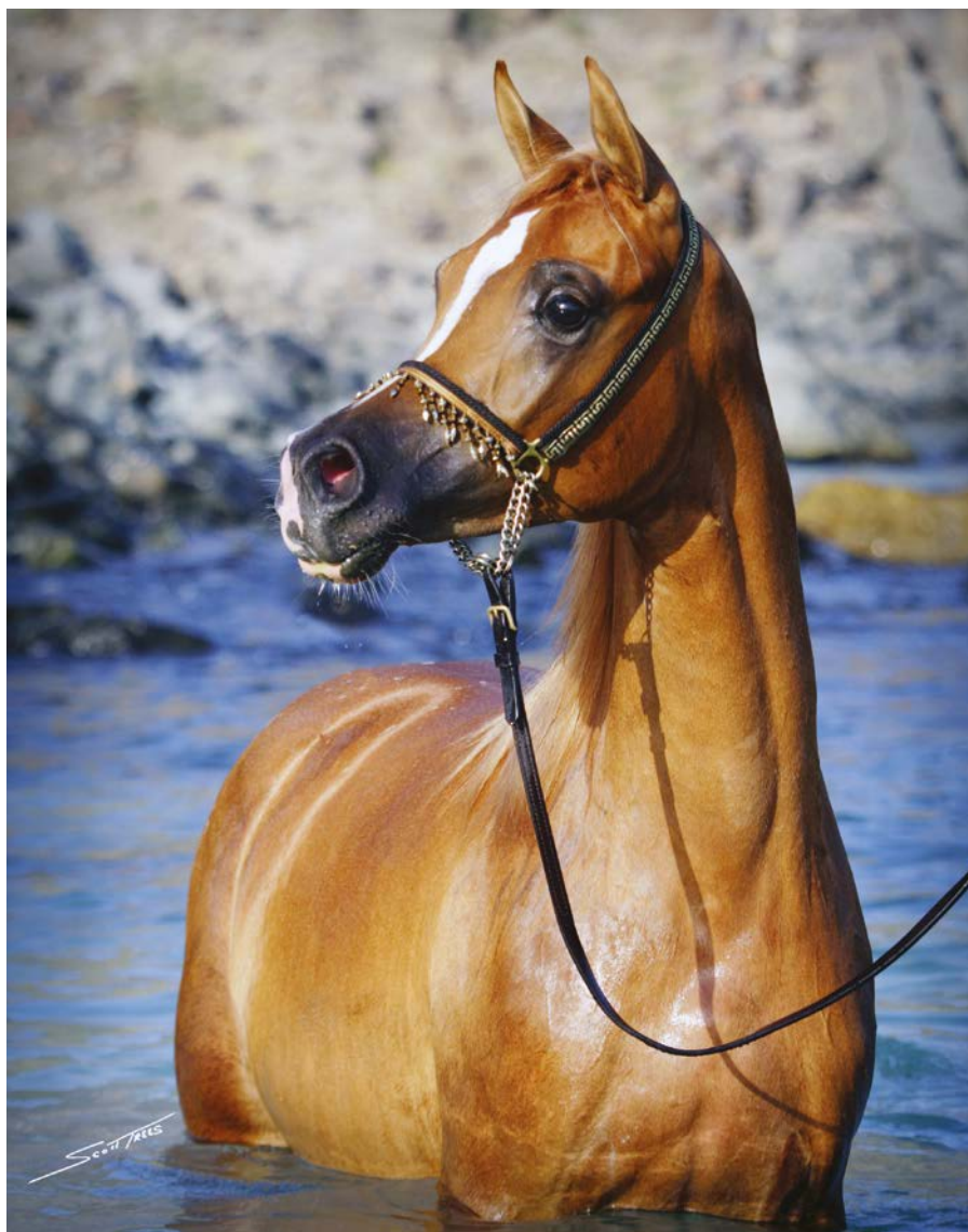
Baila De Djoon OS