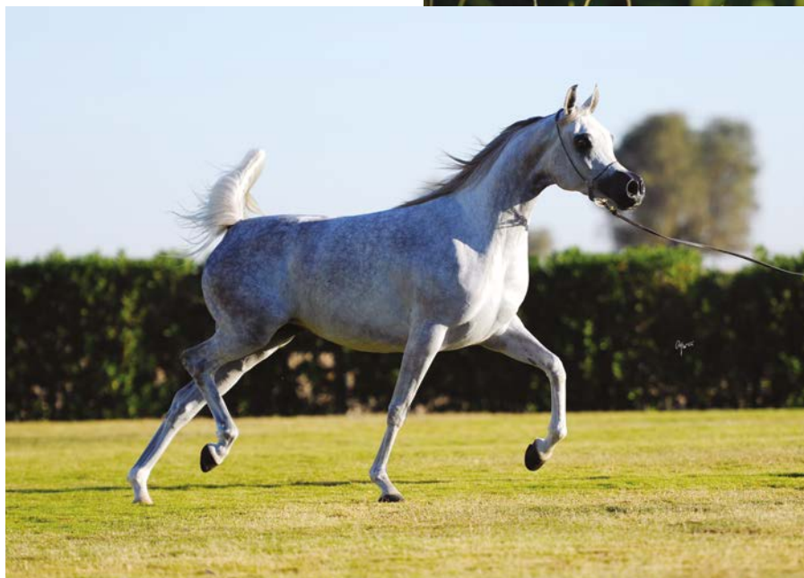
D Reem ( Ajman Moniscione x Kastilia M.A.F. ) 2011 grey, mare