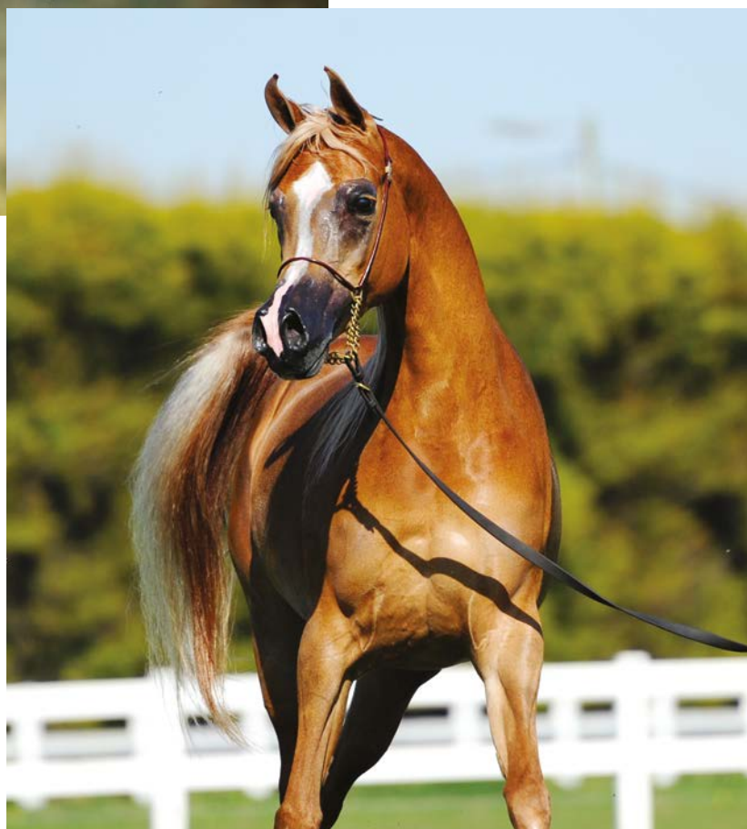
RP Grace Kelly (Ajman Moniscione x Pamira Bint Psyttadel) 2009 chestnut, mare