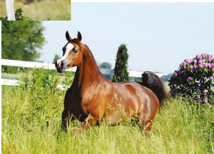
Alma Al Tiglio ( Ajman Moniscione x Amanda Al Tiglio ) 2008 chestnut, mare