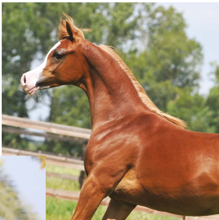
Calypso OS ( Ajman Moniscione x AB Nastrapsy ) 2010 chestnut, stallion