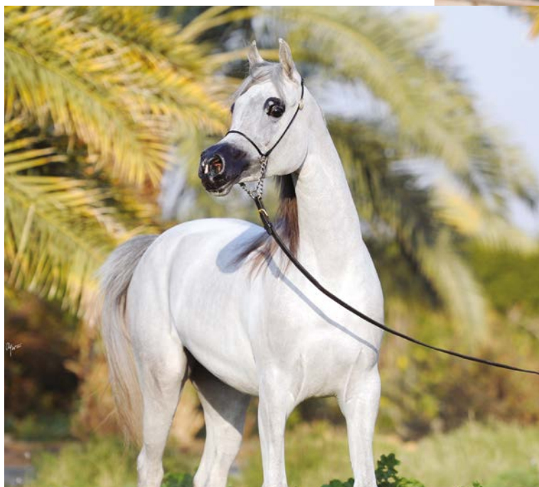
Aijana OS ( Ajman Moniscione x Mikaella PIN ) 2012 grey, mare