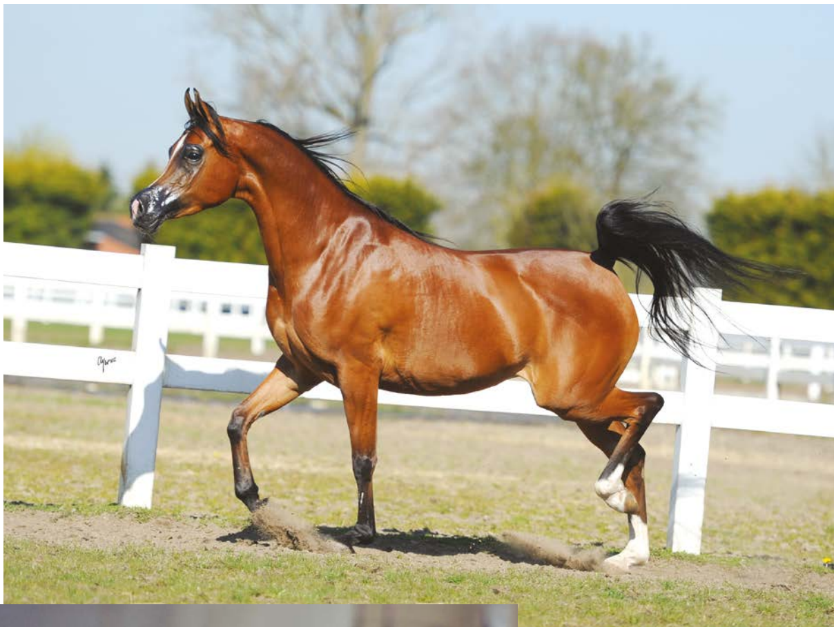
Dana Al Mobamadia (Ajman Moniscione x Felicia Psyche) 2009 bay, mare