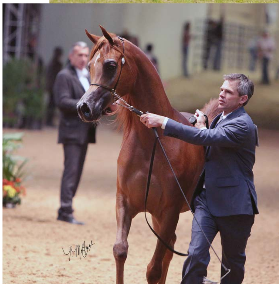
Elle Flamenca (Ajman Moniscione x Allamara MA) 2013 chestnut, mare