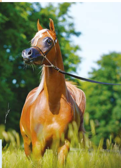
Delight's Diva RB ( Ajman Moniscione x Honey's Delight RB ) 2012 chestnut, mare