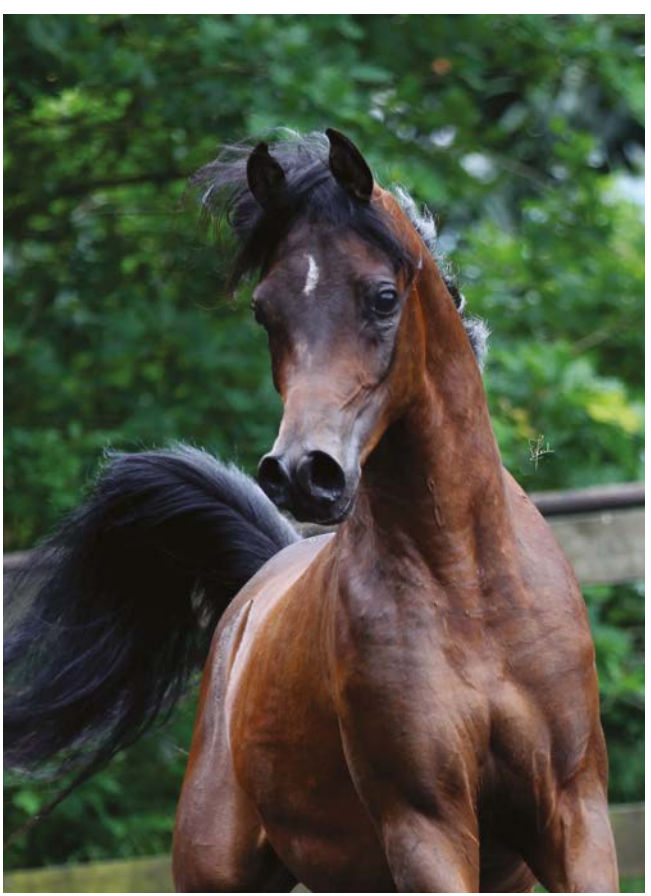
NK Nizam (NK Hafid Jamil x NK Nadirah), full brother to NK Nadeer