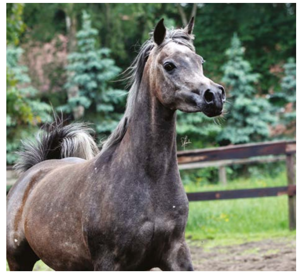
NK Habiba (NK Nadeer x Ansata Ken Ranya)