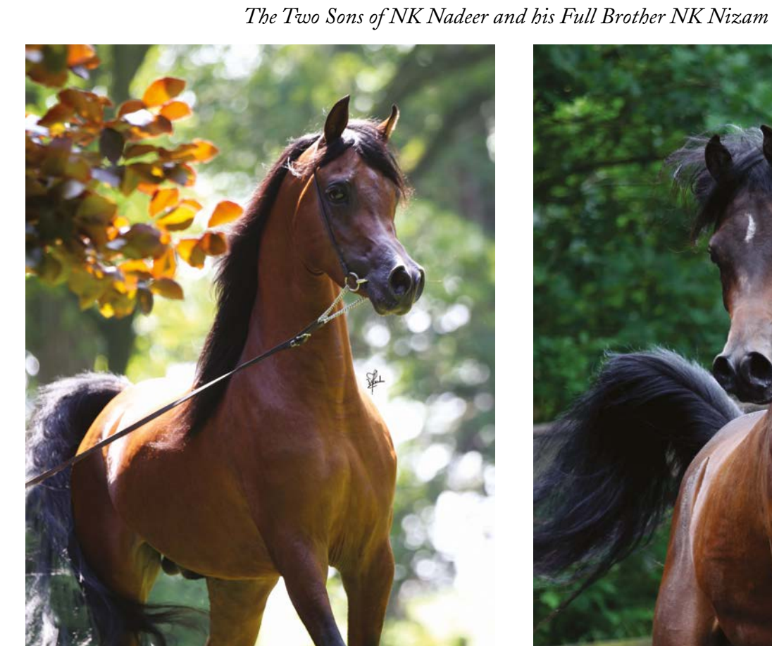
NK Nabhan (NK Nadeer x NK Nerham)