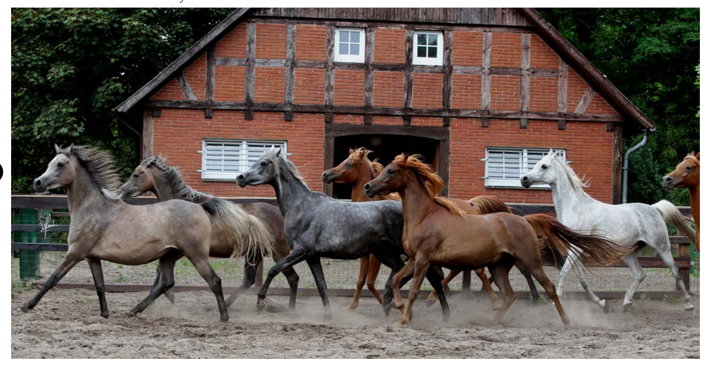
The broodmare band at the Katharinenhof

It is quite astonishing that the four original mares which were chosen in the 1960ies were able to continue as valuable