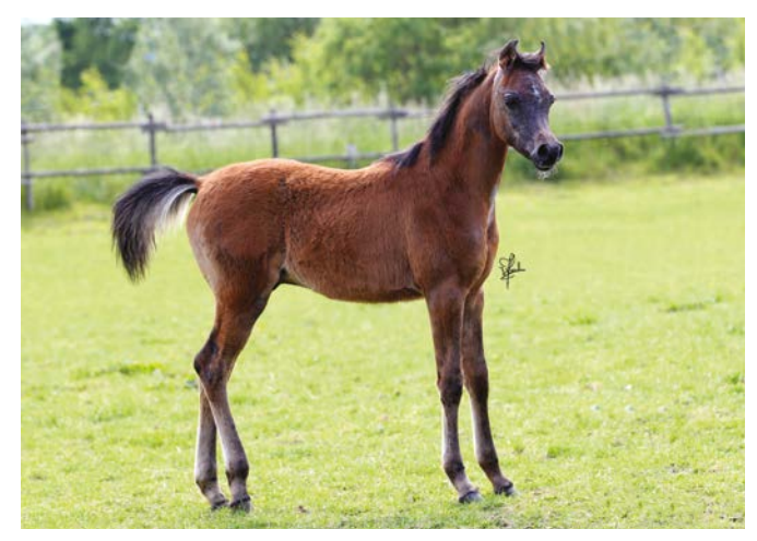
Majd Al Qusar (NK Nadeer x Mashahana Al Qusar), bred and owned by Al Qusar Stud