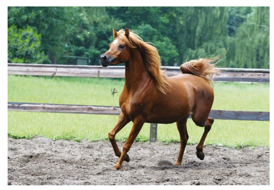
NK Nina (NK Nadeer x NK Bint Bint Nashua)

"His sire Hafid Jamil has produced males and females of excellent quality and is one of those stallions who are in fact able to produce both sexes. His sons can be found in many countries, like Egypt, Kuwait, Qatar, Italy, and Great Britain. They all display and also reproduce this special look of Hafid Jamil, whose strongest part is his very particular Arabian type. It's not easy to find another horse anywhere which is comparable to him in this respect. A lot can be said about shortages in his conformation - however, by breeding him to well-chosen mares, offspring of the highest quality in both type and conformation will be produced. NK Nadeer's mother, NK Nadirah, is considered the "pearl" in Katharinenhof's herd. She is a mare which knowledgeable breeders would rate as a broodmare of the highest quality: this means a mare who will