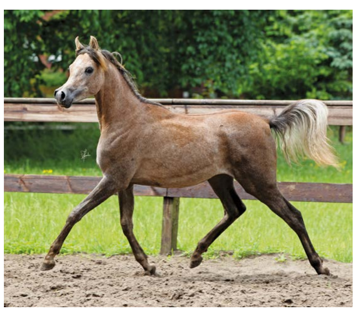
NK Nazli (NK Nadeer x NK Nasrin)