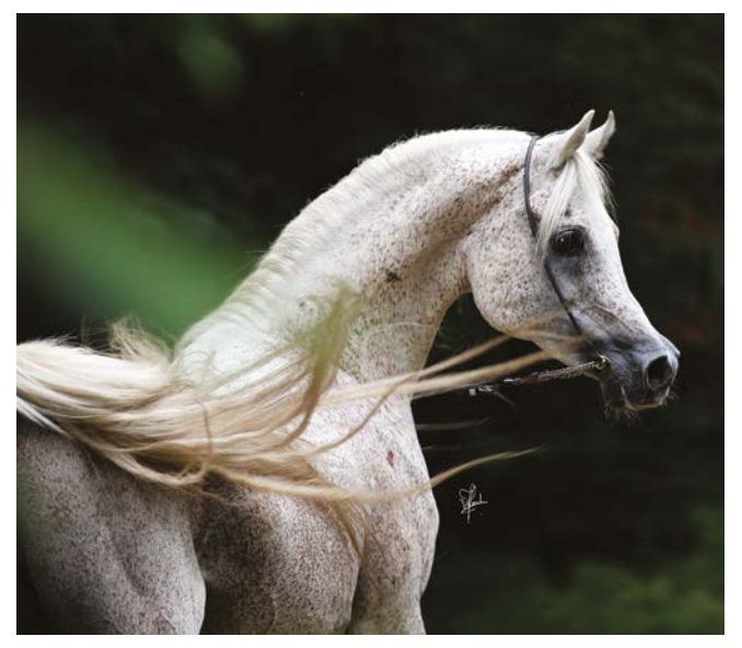
NK Hafid Jamil (Ibn Nejdy x Helala)