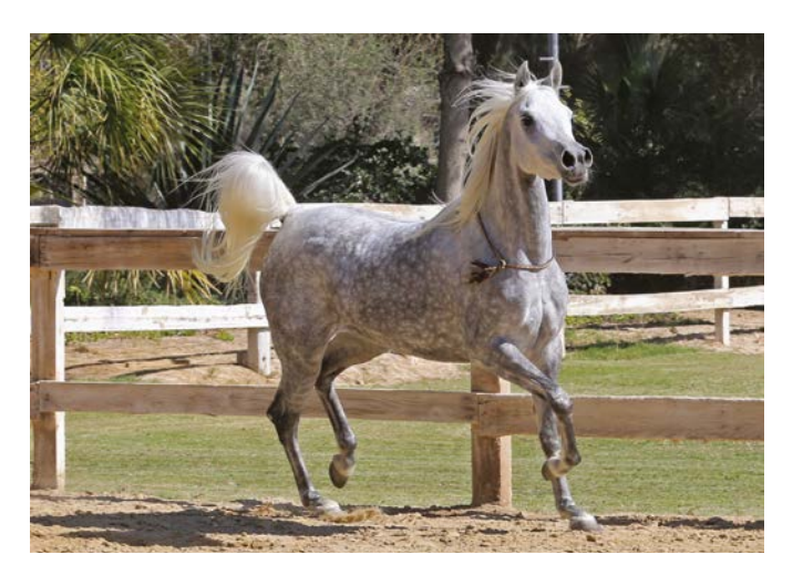
NK Aya (NK Nadeer x NK Aziza), owned by Mahmood Al Zubaid, El Adiyat Arabians, Kuwait

broodmares for 6 generations. None of them needed to be culled or replaced by another mare family for displaying traits which were not liked or which would create doubts as to whether the horses were fit or sturdy enough and were actually eligible for a breeding program which was designed to be closed sooner or later.