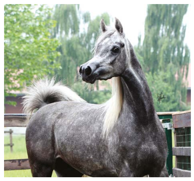
NK Nachita (NK Nadeer x NK Bint Bint Nashua)