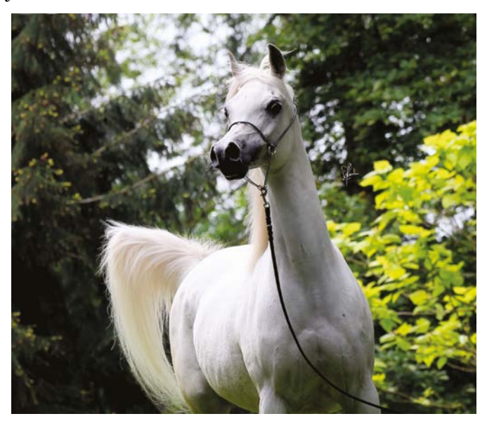
NK Nadirah (Adnan x Nashua)

ANSATA HALIM SHAH GASB*2797 Grey 1980 HANAN GASB*276 Bay 1967 SALAA EL DINE GASB*5170 Grey 1985 NEJDY GASB*8627 Grey 1988 ALAA EL DIN EAO*352 LOTFEIA GASB*8364 Chestnut 1956 BINT KAMLA EAO*122 Grey 1967 Chestnut 1956 IBN NEJDY GASB*16524 Grey 1992 NAZEER RAS*247 Grey 1934 BUKRA RAS*384 Grey 1942 GHAZAL AV*48 Grey 1953 GHAZALA GASB*815 Grey ALAA EL DIN EAO*352 1973 HANAN AV*544 Bay Chestnut 1956 MONA EAO*521 Bay 1956 1967 NK HAFID JAMIL GASB*23362 Grey 1996 *ANSATA IBN HALIMA++ AHR*15897 Grey 1958 ANSATA ROSETTA AHR*70167 Grey 1971 ANSATA HALIM SHAH GASB*2797 Grey 1980 SALAA EL DINE GASB*5170 Grey 1985 ALAA EL DIN EAO*352 HANAN GASB*276 Bay 1967 Chestnut 1956 MONA EAO*521 Bay 1956 HELALA GASB*13084 Bay 1992 MADKOUR I GASB*555 Grey 1971 HANAN GASB*276 Bay 1967 *JAMILLL AHR*268275 Grey 1975 ANSATA GLORIANA GASB*13434 Grey 1986 *ANSATA IBN HALIMA++ AHR*15897 Grey 1958 ANSATA GHAZALA AHR*137116 Grey 1976 ANSATA GHAZIA AHR*237262 Grey 1981 NK Nadeer