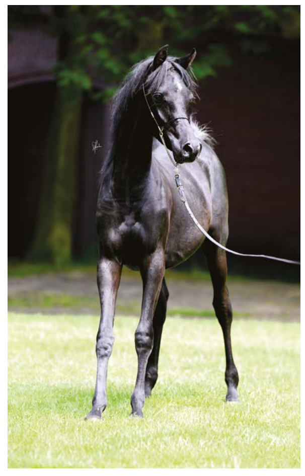
NK Nounou (NK Nadeer x NK Bint Bint Nashua)