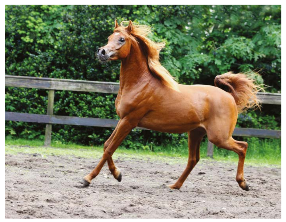
NK Naeem (NK Nadeer x NK Bint Bint Nashua)