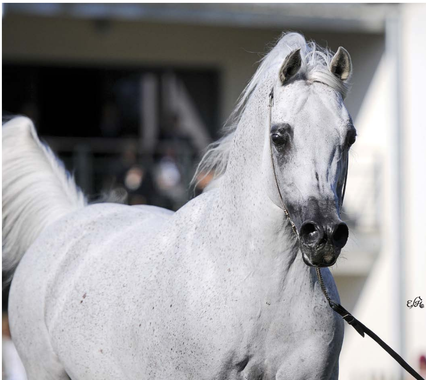
Ekstern, Janów Podlaski 2011.

neck – although it was nice and shapely, it was a bit short and thick. Later, during training and on the track (he raced as a three year old for one season) this changed. But definitely he was a very promising horse from the very beginning”.