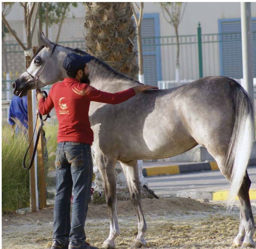
Perfinka, Qatar 2015.