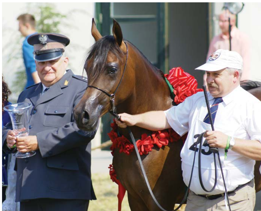
Piacolla, Janów Podlaski 2013.

During 2005–2007 Janów Podlaski got plenty of their own Ekstern get, which later stood out at shows. Among them we find Polon (out of Pianosa/Eukaliptus) and Prado (out of Pęta/Visbaden), the mares Altamira (out of Altona/Eukaliptus), Biruta (out of Bajada/Pamir), Cenoza (out of Celna/Alegro), the afore mentioned Pepita, Sefora (out of Sawantka/Pepton), Bohema (out of Bogini/Arbil), Wołogda (out of Wanilia/Alegro), Atma (out of Altona/Eukaliptus), Sarbia (out of Samura/Ararat). Białka Stud used