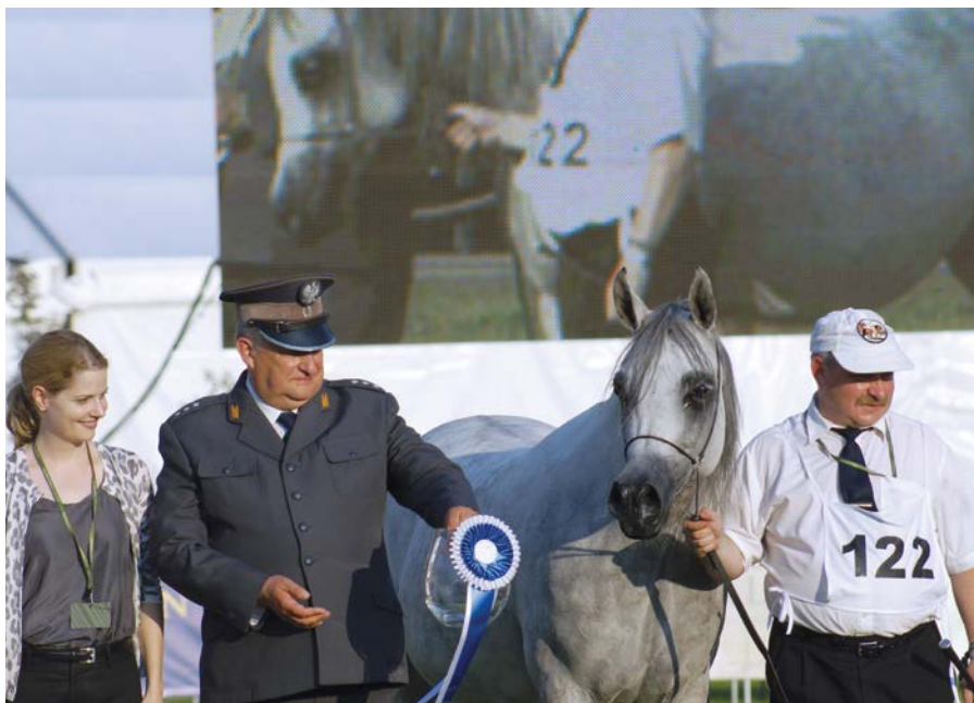
Palanga, Janów Podlaski 2010.