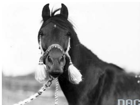
Kuhailan Haifi.