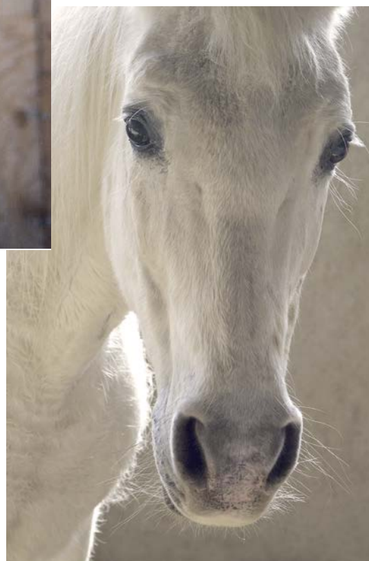
Ernestyna, Michałów 2014.