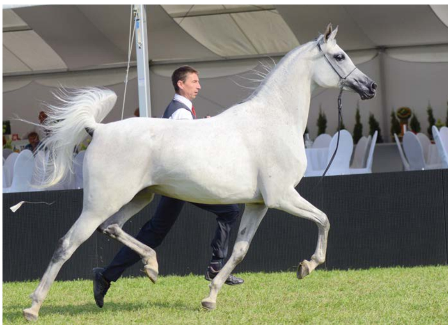
Wilda, Al Khalediah European Arabian Horse Festival 2014