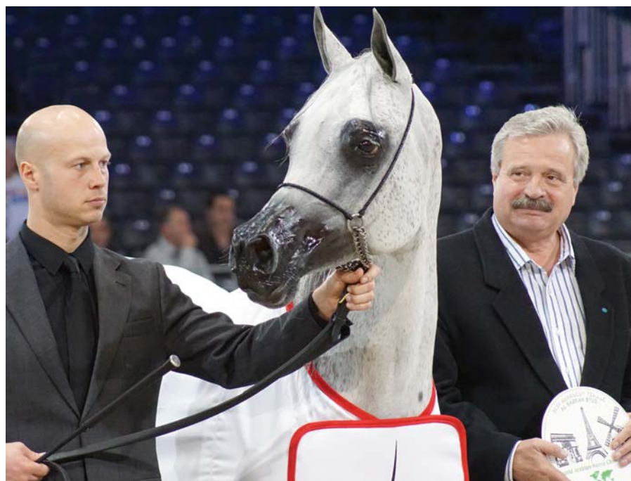
Pepita, Paris 2014.