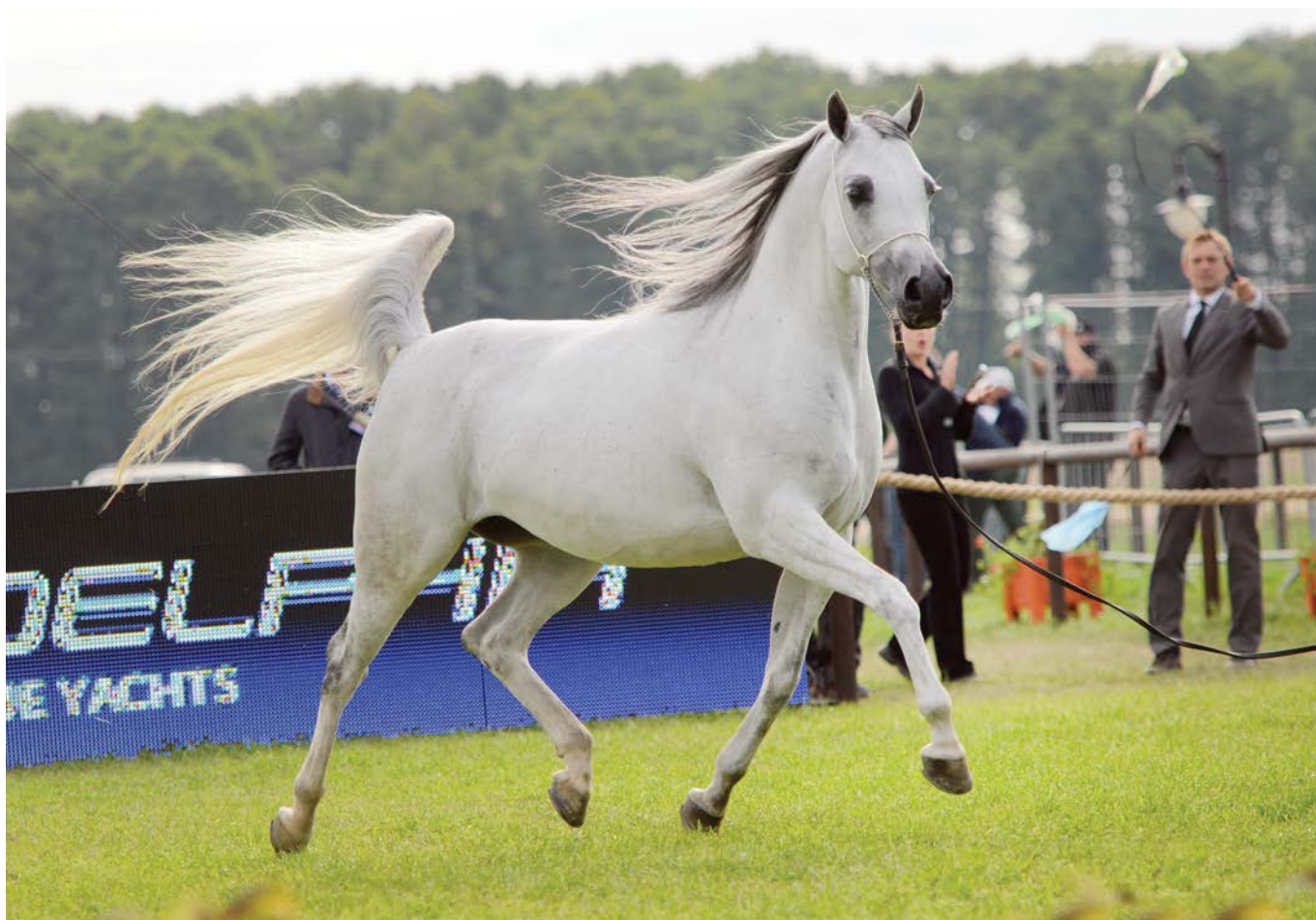
Psyche Victoria, Al Khalediah European Arabian Horse Festival 2014.