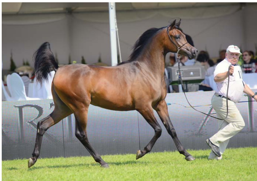
Pustynia Kahila, Al Khalediah European Arabian Horse Festival 2014.