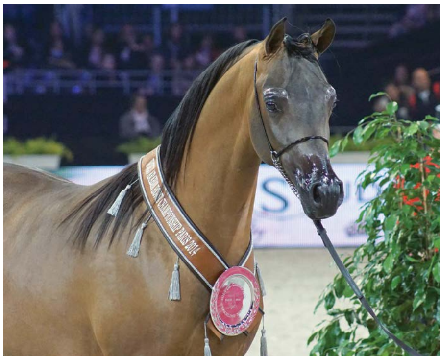
Morion, Paris 2014.