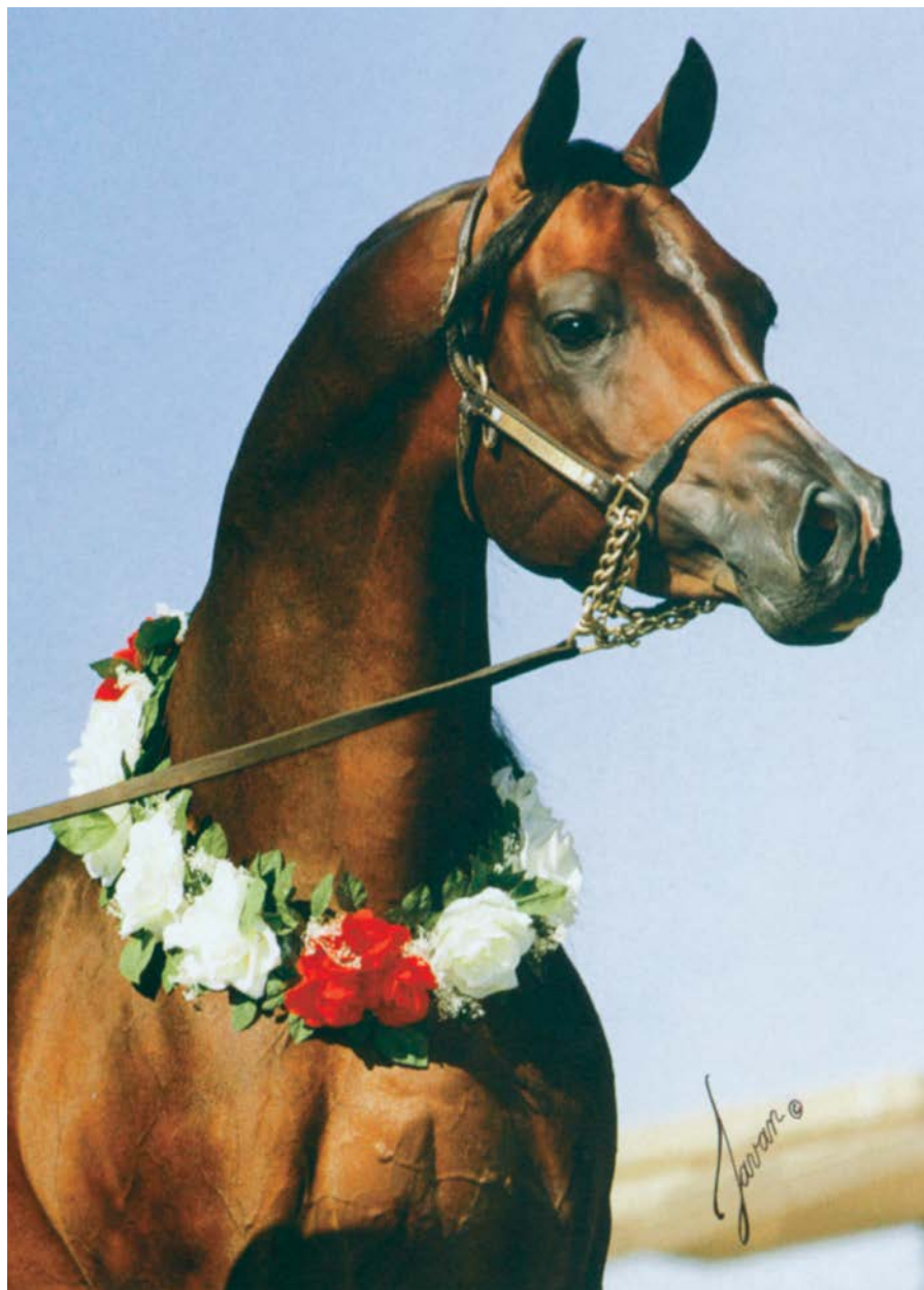
Thee Desperado, the charmer.

the way of the destiny he seemed to sense inside.