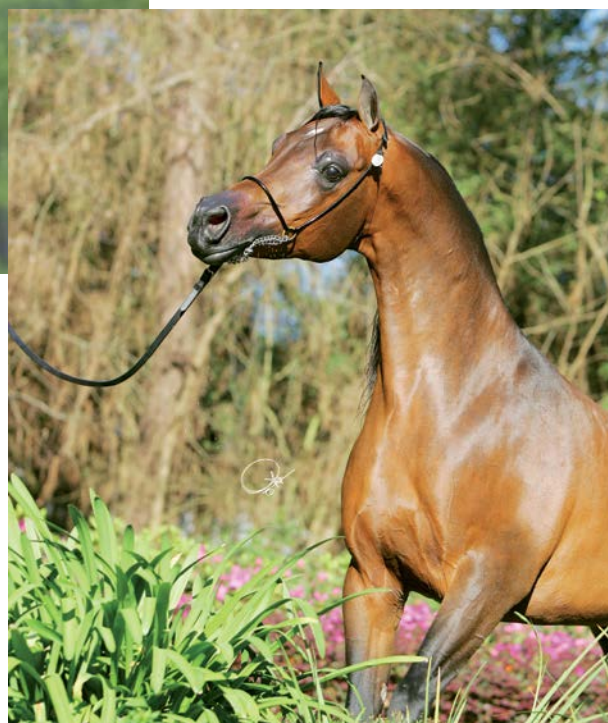
Insignia DeSha 2000 bay stallion (x Jubillee )