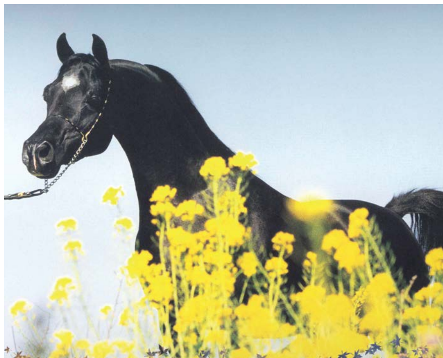
Windsprees Mirage 1996 black stallion (x GL Lady Mirage)