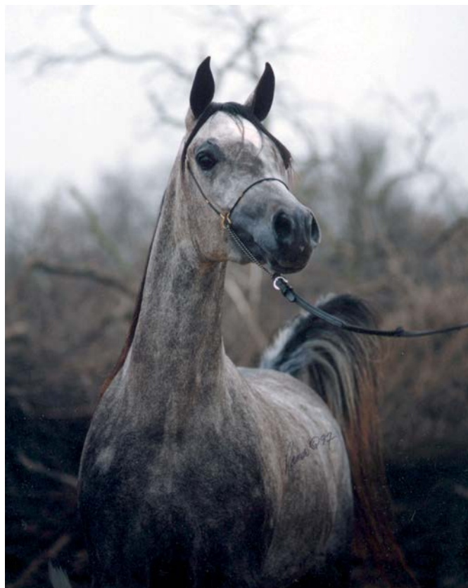
Deserree 1994 grey mare (x PH Maroufina)