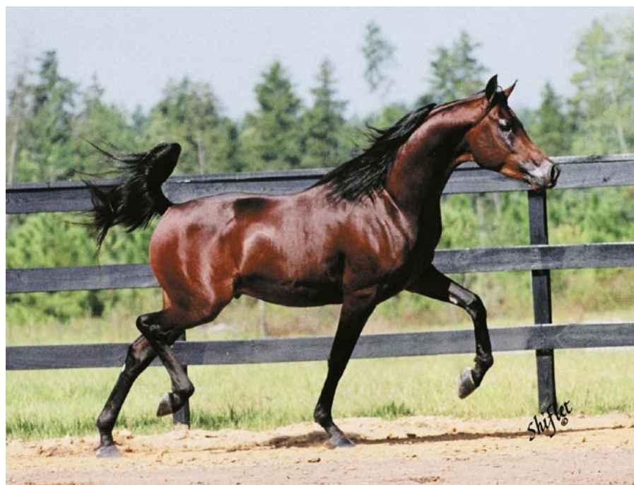
BG Maasai 1994 bay stallion (x DM Mimosa)

is famed for one particular dish of the most sought after bouquet of flavors that you remember forever, and the secret is found in their recipe. A good recipe finds a unique way to blend strong flavors that would stand on their own into a new and memorable flavor.