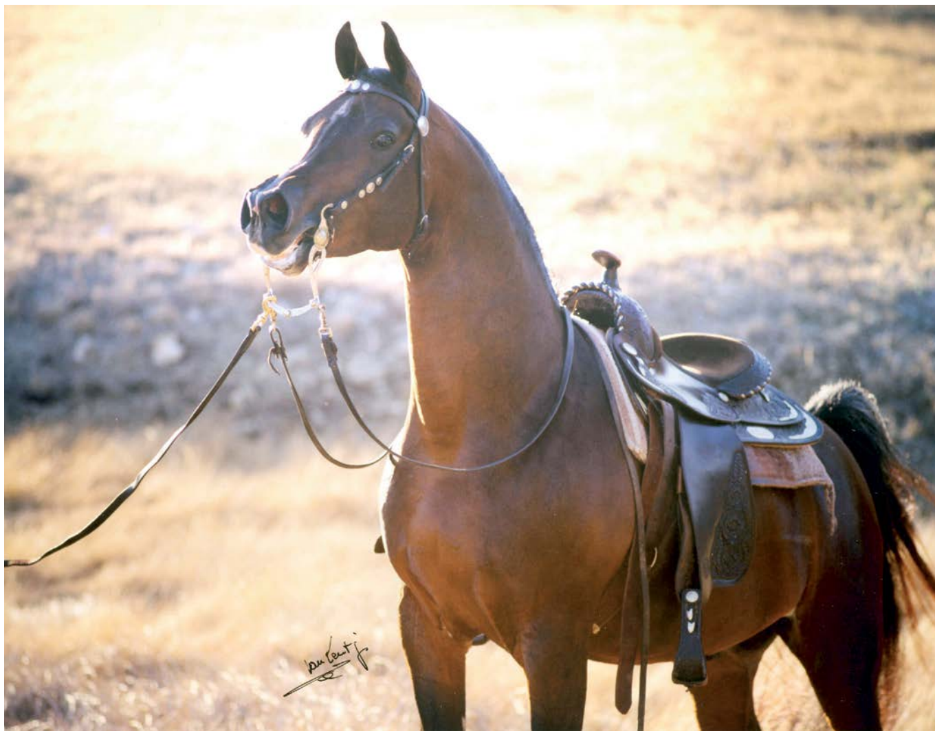
Thee Desperado 1989 bay stallion (The Minstril x AK Amiri Asmarr) with western saddle. Despite all the fanfare about him and his long halter-winning career, he enjoys being ridden around the farm.

mare. On April 5, 1989 she produced a beautiful bay colt with the most uniformly perfect markings, balanced proportions and overall excellent quality. But that did not impress AK Amiri Asmarr one bit because she wanted nothing to do with motherhood and did not want this little bay colt anywhere near her. However the boldness of this youngster was to foretell of a “Desperado” who would make a name for himself no matter what his mother thought.