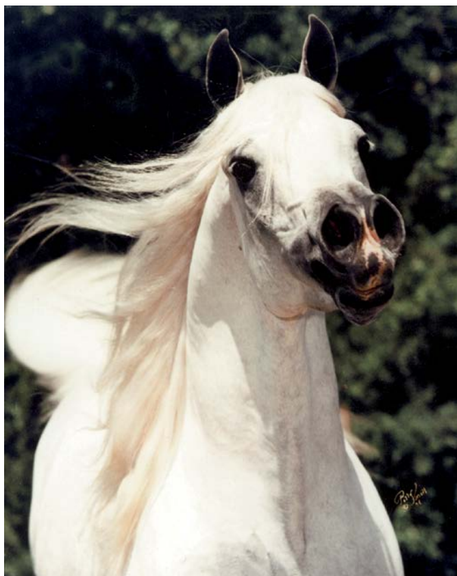
Ruminaja Ali 1976 grey stallion (Shaikh Al Badi x Bint Magidaa by Khofo) Multi U.S. National championship winner and an international patriarch in Arabian breeding. He is the paternal grandsire of Thee Desperado.