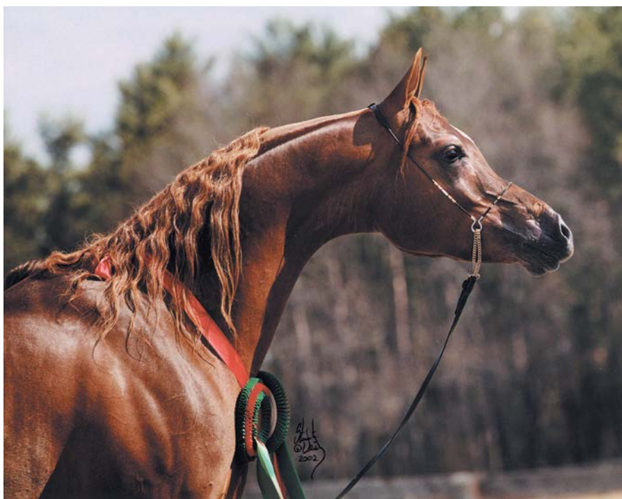
True Colours 1997 chestnut stallion (x Dabeda)

This amalgam produced a very handsome kind of horse that is the total package for many admirers of the Arabian horse and obviously he has attracted a lot of attention. To see him in person, even now at age 20 there is a