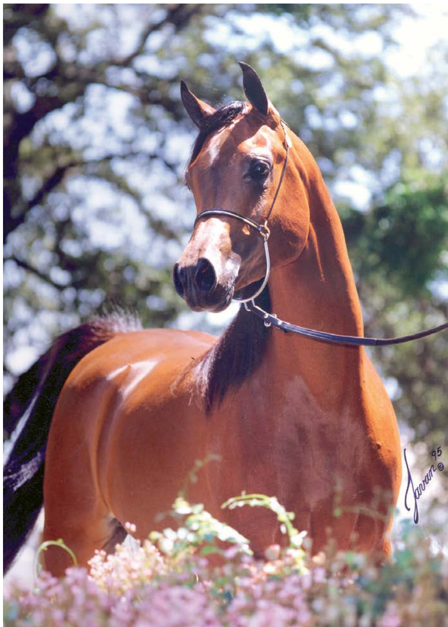
BJ Thee Mustafa 1993 bay stallion (x Khalili El Bahar)