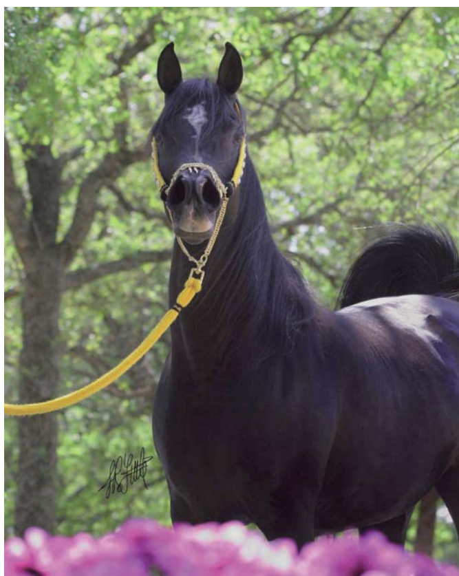
Queen Sheeba 1996 black mare (x MinstrilsGabriella)