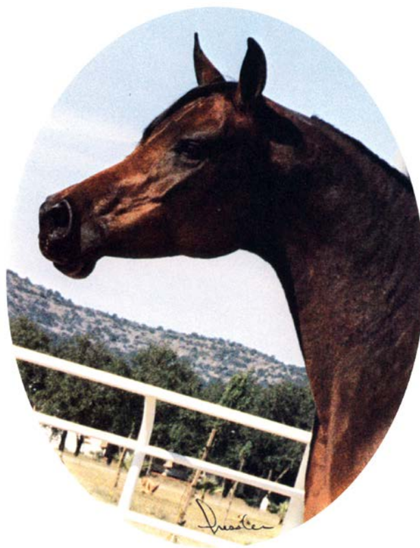
Nagliah 1972 bay mare (Ibn Hafiza x Nabilabh). She was a lovely mare with large dark eyes. She is another outcross element in the pedigree of Thee Desperado also having no Nazeer or Moniet El Nefous breeding. She is the tail female line of Thee Desperado and he shows much of her facial character and rich mahogany bay color.