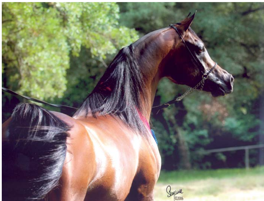
Atiq Haleeb (Laheeb x Hila B) grey stallion bred by Idan Atiq Egyptian Stud in Israel. A Supreme National Champion of Namibia and Supreme West Cape Champion at Worcester, South Africa. He traces to Fadl through both Fa-Habba of the Nile family and Habba, the dam line of Laheeb.