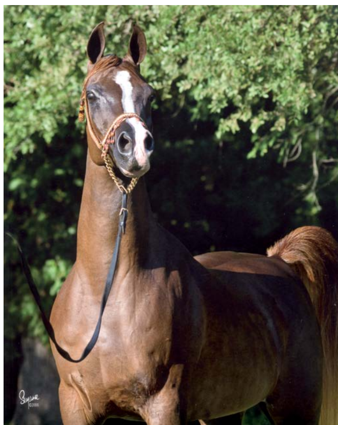
Sweet Eloise 1998 chestnut mare (x Kuhaylah Nitaya)