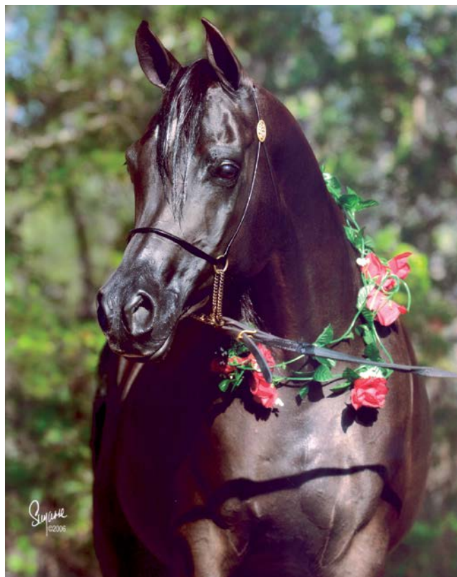
Rhapsody In Black 1994 black mare (x Aliasahm RA)