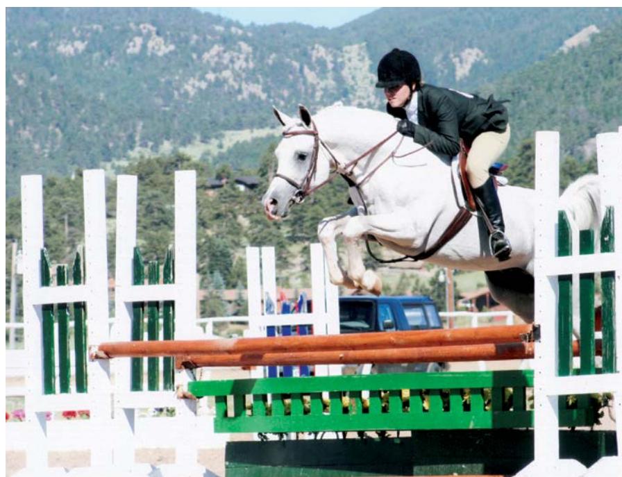
SA Thee Moon Dancer 1997 grey stallion (x AK Shalina)

recipe for Thee Desperado? From the beautifully proportioned Ibn Galal, who traces to Yosreia on both sides of his pedigree, and from the mare Bakria who is a Hadban Enzahi on both sides of her pedigree. The careful weaving of Morafic in the pedigree also introduces each time his immortal grand dam Moniet El Nefous, the undisputed queen of Egypt and a very strong source of classic beauty in the recipe. Her blood is intensified when Morafic was bred to his full sister in blood Bint Mona producing the legendary sire The Egyptian Prince, sire of Thee Desperado's dam. Yet for all the careful blending by line breeding these strong elements in the recipe, the female lines of both the sire and dam of Thee Desperado are relatively outcross having no lines to Nazeer in their pedigree. This is represented by the non-Nazeer mares Bakria, grand dam of The Minstril, and Asmarr grand dam of Thee Desperado. In each of these mares are multiple lines to the Rabdan El Azrak blood, noted for