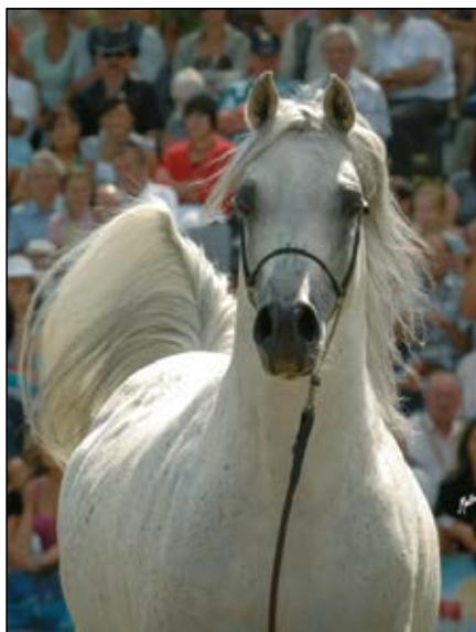
Ekstern 2008 WAHO Trophy