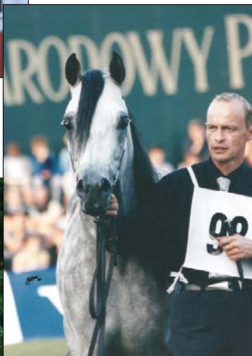
Ekstern: 2000 Polish National Show