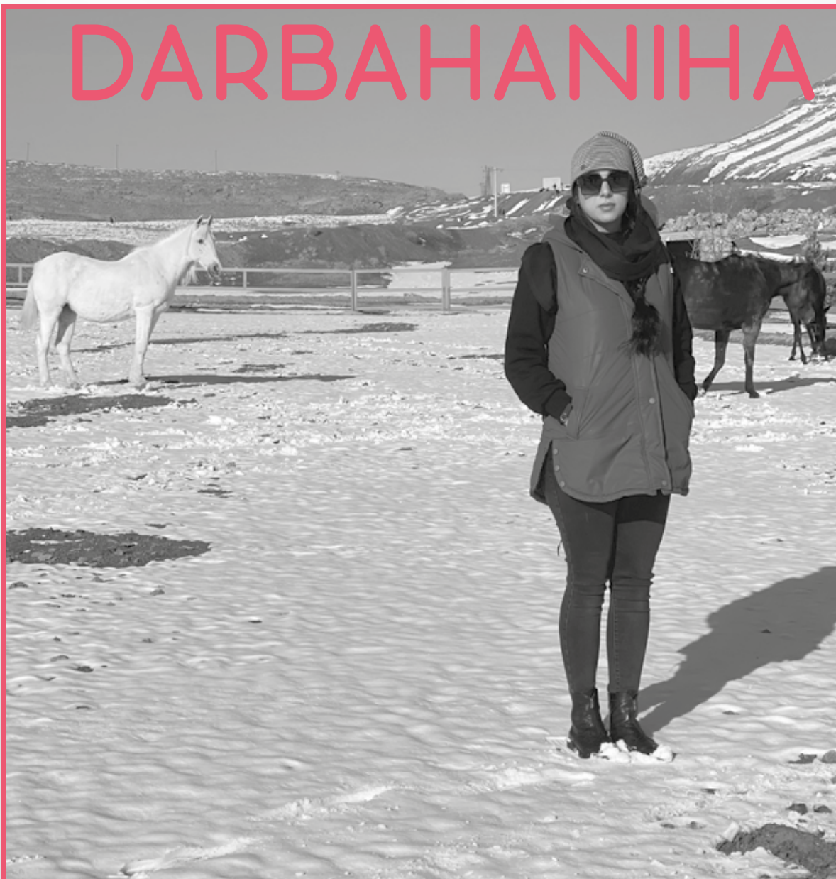
Horse trainer and horse photographer