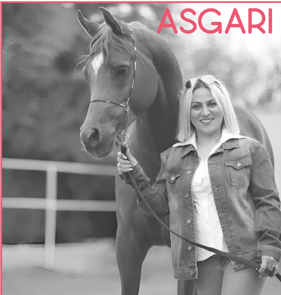
Arabian horse breeder