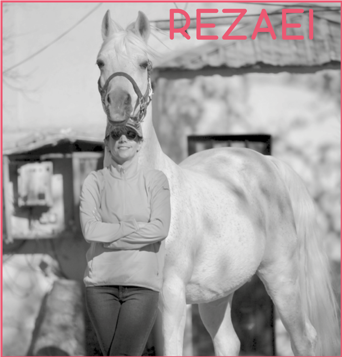
Riding instructor and Arabian horse trainer