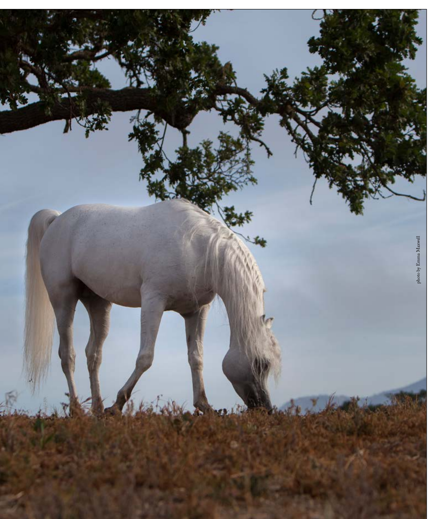
Inabian Stallions (1) of the World N