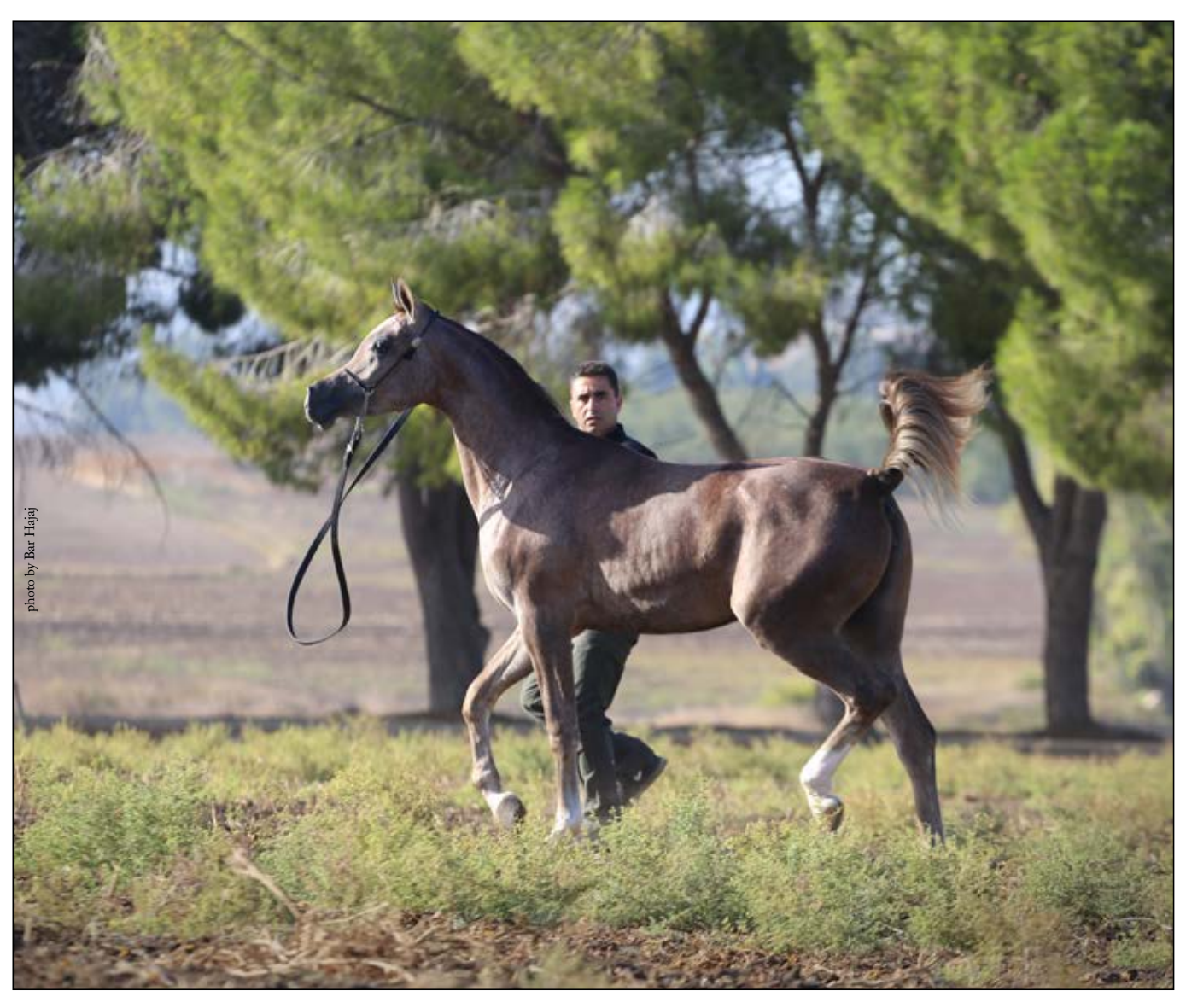
Sajda AA (x Safiyyah AA)

thirty registered purebred foals in Israel before his return to Europe. This was unfortunately followed by his tragic and untimely death in 2009. Three Al Ayad foals from the Ariela program, Al Ayal AA (x The Vision HG), Nashwah AA (x Insha Sha Latifah), and Baha AA (x Baaraaqa AA) have since become highly-acclaimed international halter stars and have helped to create an outstanding legacy for their sire.