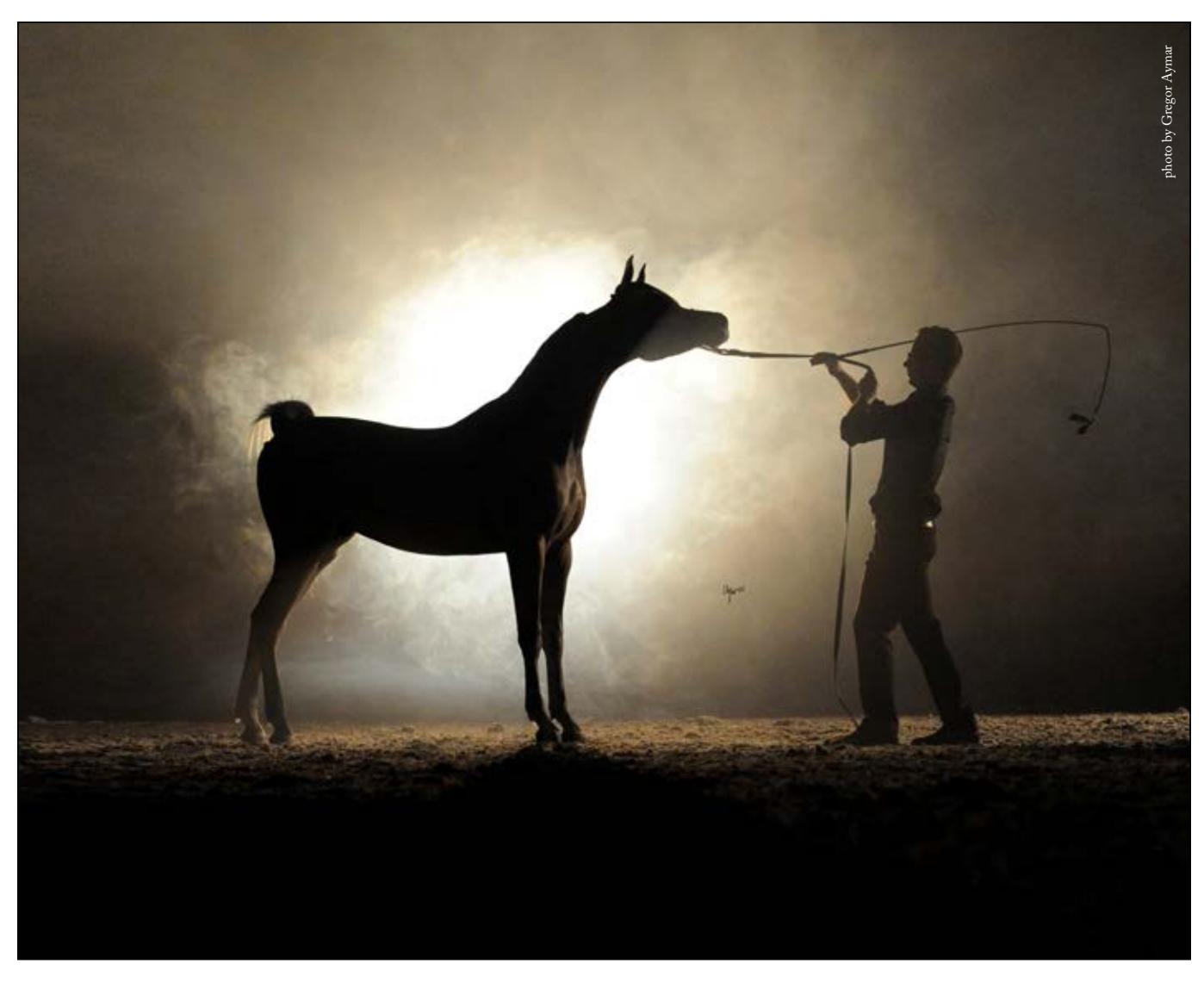
Shaheen AA (x Saniyyah RCA)

to be a very complete straight Egyptian horse. However, when I saw him for the first time at Aljassimya in California last April, I discovered that, contrary to most cases, the images I have seen of him did not reflect the whole superior quality of this stallion. He was even better in real life than in his pictures.