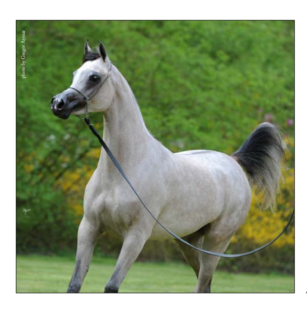
Nardin AH (x Nijmat Al Sachra)