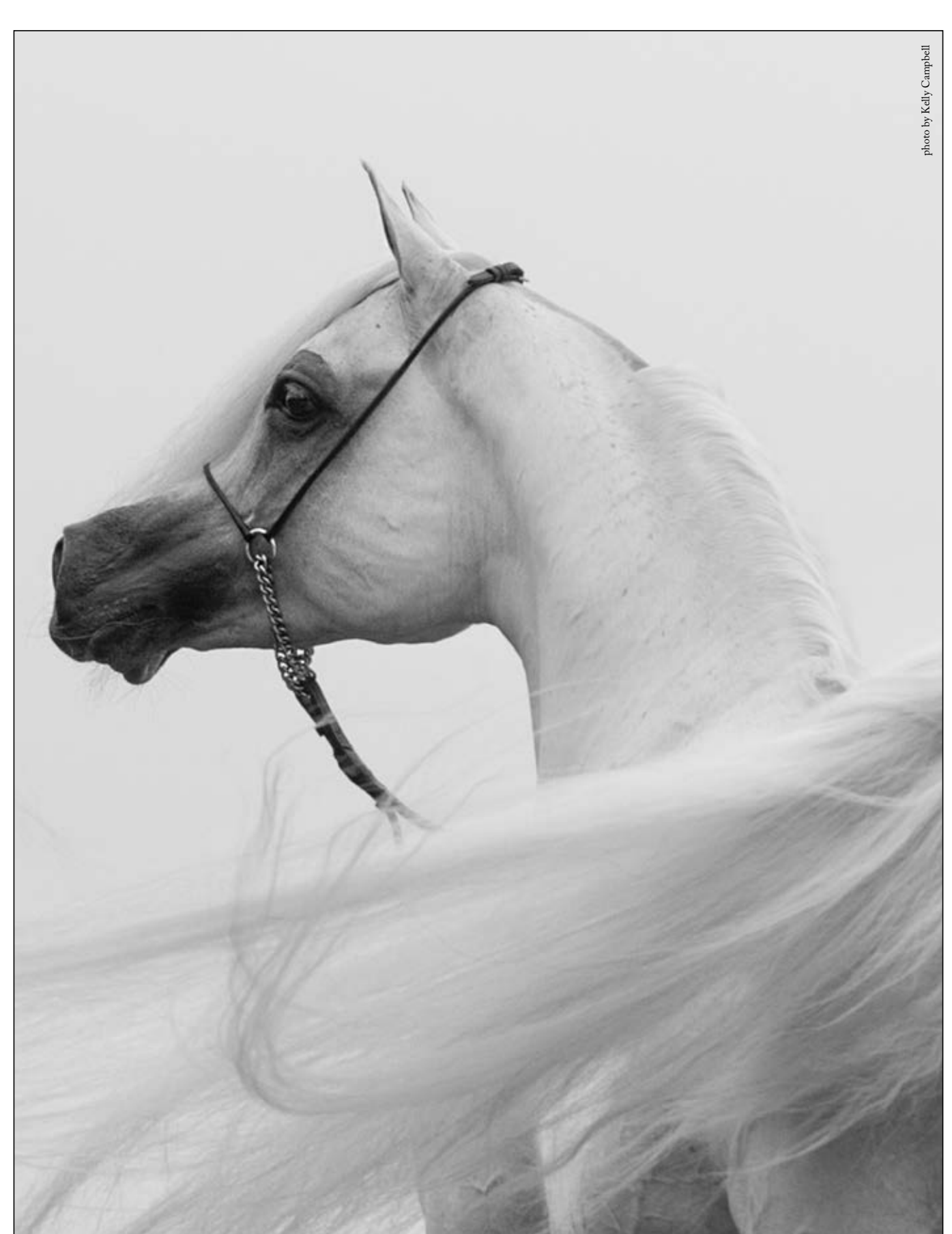
Arabian Stallions (9) of the World XII -