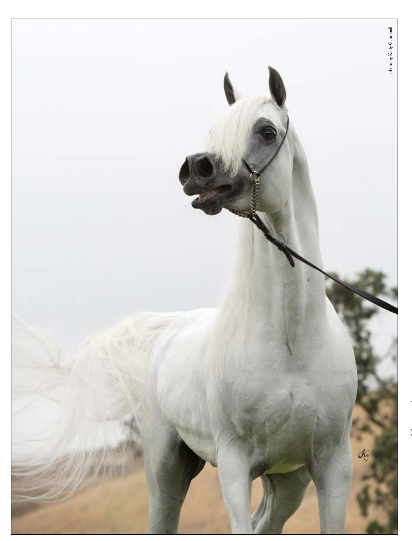
Arabian Stallions (2) of the World XII —