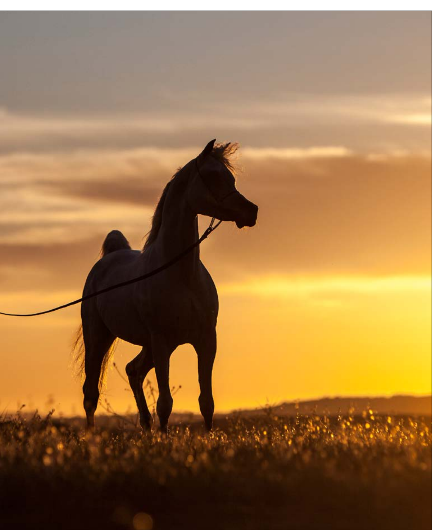
Arabian Stallions (1) of the World XII