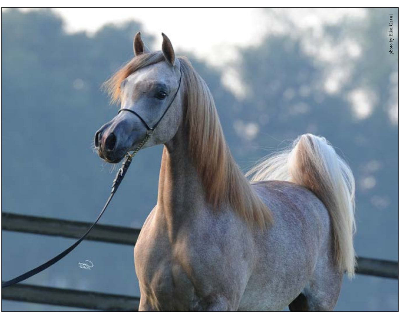
Soraya AA (x Saniyyah RCA)

just the moment we asked it of him, a characteristic that is always of value in a horse. In Scottsdale his timing was right on the mark, and we were very proud of his Unanimous Champion Stallion performance. It was a sad moment to see him go, but on the other hand his stamp on the Aljassimya program is clearly engraved on his foals who will carry his memory into the future."