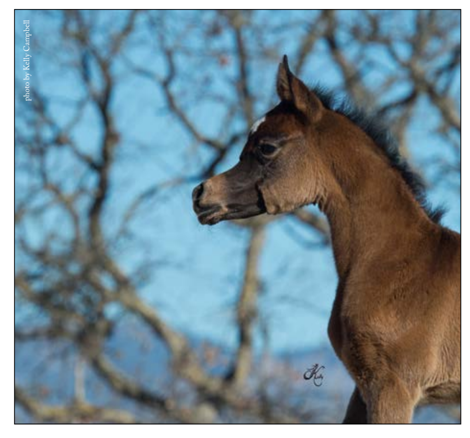
Tuhfet Aljassmiya (x Psynderella)