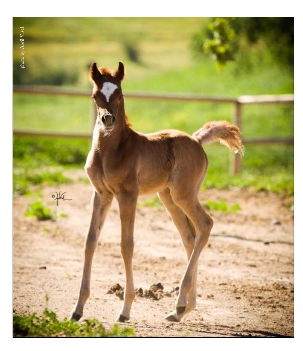
Ayyar Aljassmiya (x Jade Lotus SMT)

2014 Al Ayal traveled to California to serve as guest herd sire at Aljassimya, where he delighted the exceptionally professional staff by exceeding even their highest expectations. His two years breeding some of Aljassimya's most important mares passed very quickly, and in early October 2016 Al Ayal returned back home to Israel.