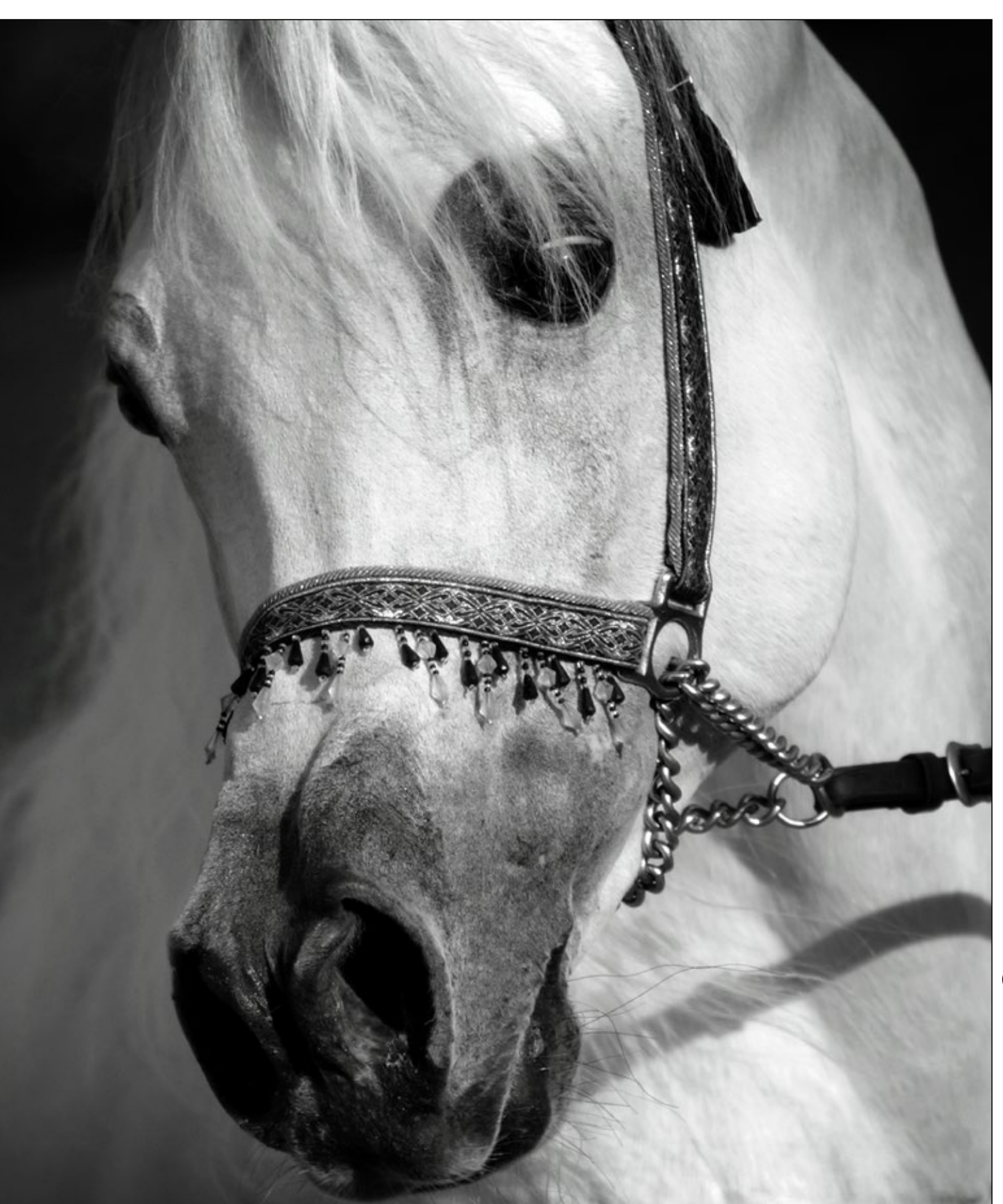
Arabian Stallions (3) of the World XIV -