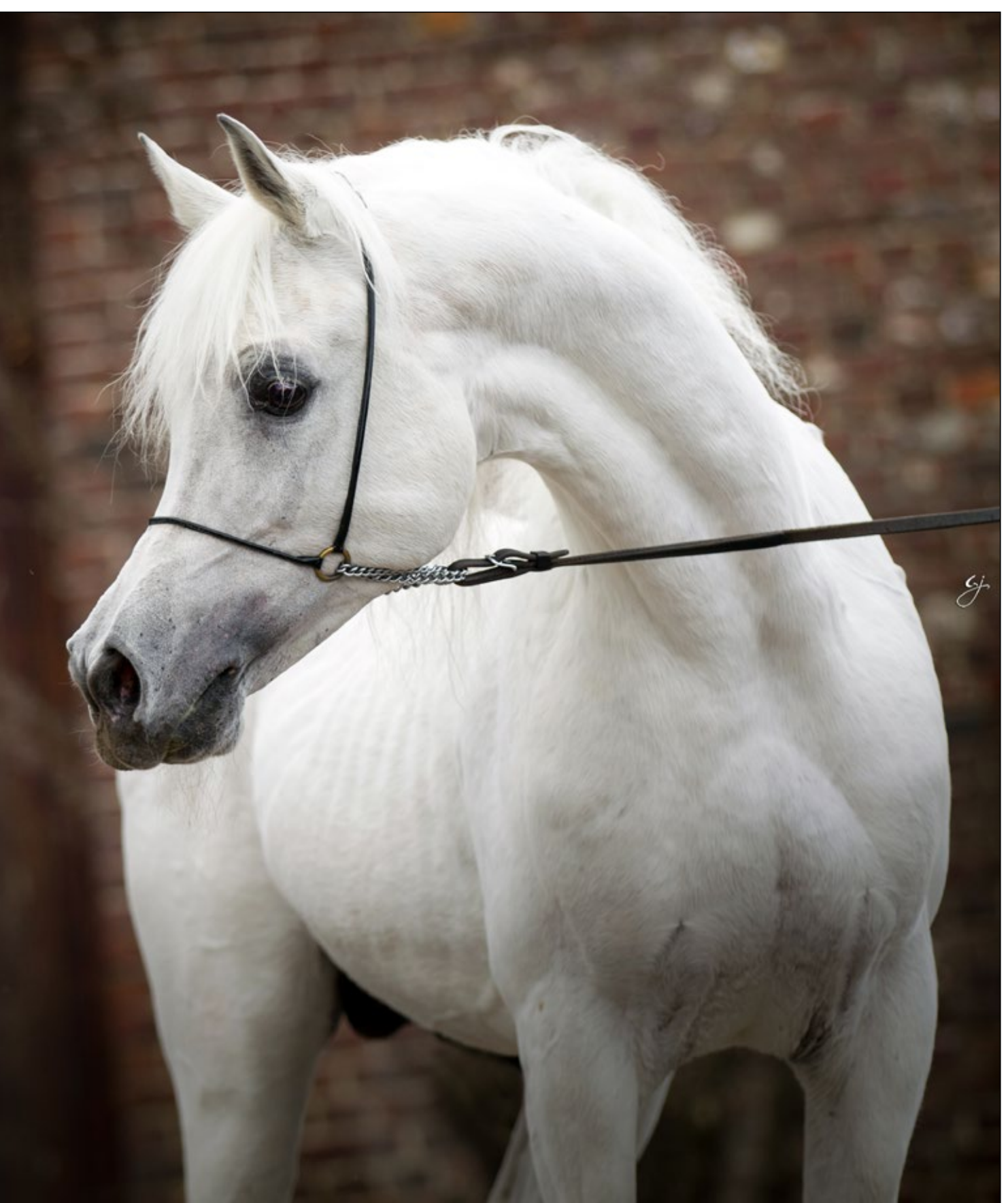
Trabian Stallions (4) of the World Mr —