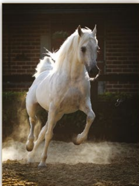
Top: Ansata Nile Echo Right: Ansata Shalim

The Straight Egyptians were not at all the sidekicks, however, just on the contrary. Two colts who were selected for Qatar in Ansata Stud of the USA were to make history, not just for Al Naif Stud, but for all of the world of Straight Egyptian breeders. They were the future unbeaten Get of Sire Champion Ansata Shalim (Ansata Halim Shah x Ansata Nefertari), and Ansata Nile Echo (Ansata Hejazi x Ansata White Nile), a horse whose influence in breeding was not limited to the gulf states but much felt in Europe, as he had not only a world class pedigree, but brilliant floating movements in trot, and enchanting charisma, both of them to a degree that has every breeder dreaming.