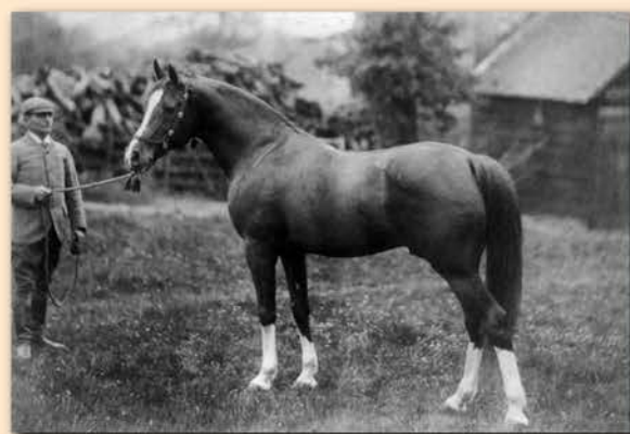
The legendary Mesaoud, foundation sire of the Crabbet Arabian Stud in England, used for his strength, type, and correctness.