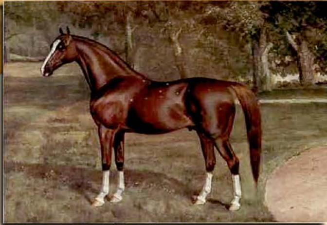
Painting of Mesaoud

conformation, powerful build, and Arabian type. After siring 100 registered foals in England, he was sold to Wladislas Kliniewski in July 1903, and soon after sold to Tersk Stud in Russia, where he spent the rest of his life. Due to such heavy use of Mesaoud in multiple established stud farms, his blood can be found in 90% of our Arabian horses today.