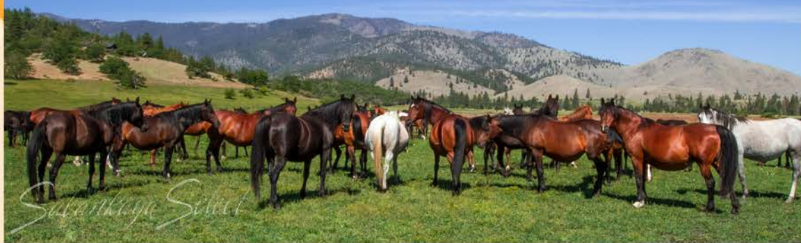
Kuhailan broodmare herd at Ottoman Arabians in the Northern California.