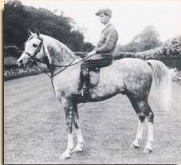
Naseem was a keystone sire of Tersk Stud