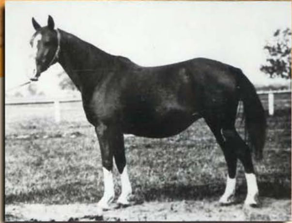
Gazella II is the most important mare line from Poland

Another horse with a lot of white who contributed much to the breed was the famous foundation mare named Gazella II. And three more horses benefitting the breed were Naseem, Muscat, Padron, and Solon.