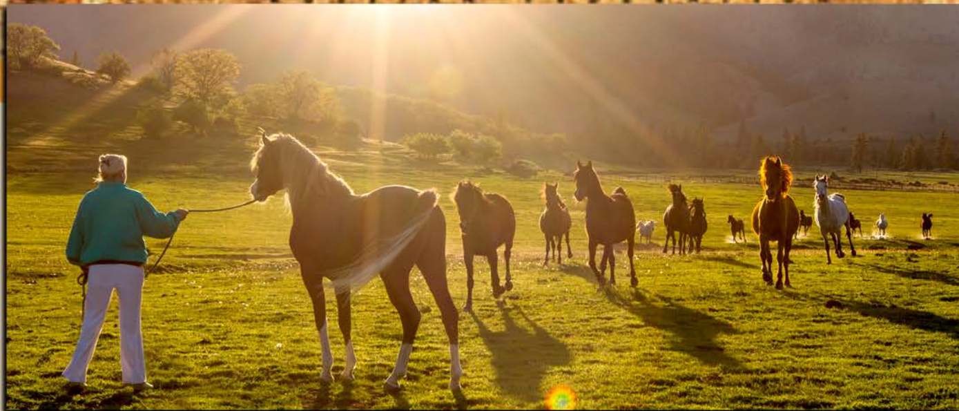
Chera and Calypso call out to the herd to see who is ready for in-hand breeding 2013--no stud chain, no whip, perfect gentleman, and we bred two-three mares per trip.

Mustafa was even more impressed with what Zientarski had to say about Kuhailan Haifi's incredible stamina under saddle—perhaps even more noteworthy than Zientarski's initial reaction upon meeting the horse. His depiction of the horse's undeniable ability to outrun (and, sadly, outlive) many of the horses that accompanied him on the long trek back to the seaport was impressive. While the other horses actually dropped dead from thirst and exhaustion on the 500 mile gallop through the deep sand without food and water, Kuhailan Haifi reached the seaport as if only warming up, as though, Zientarski said, he were ready to do it all over again!