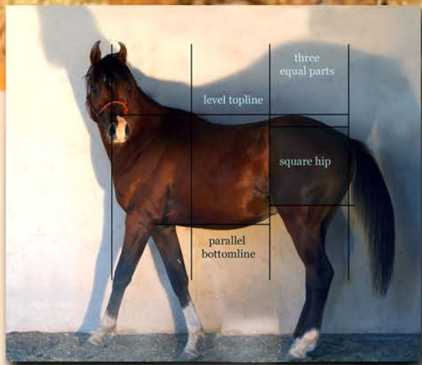
SS A Lot of Nabeg (Calypso OS x SS A Lot of Spark) 2014 Bay Colt at 16 months demonstrates the square body and phenotype he inherited from his ancestors Menes, Arax, and Nabeg.

Calypso's bay foals came from mares of all colors, not just the bays, and do not look as much like him (especially in facial expression). They do not have as much white.