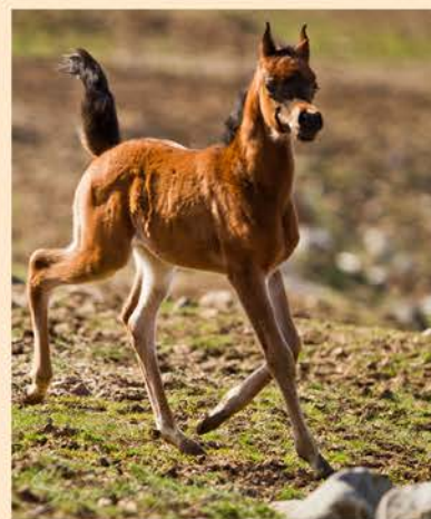
below: Kuhailan Mares of Ottoman Arabians