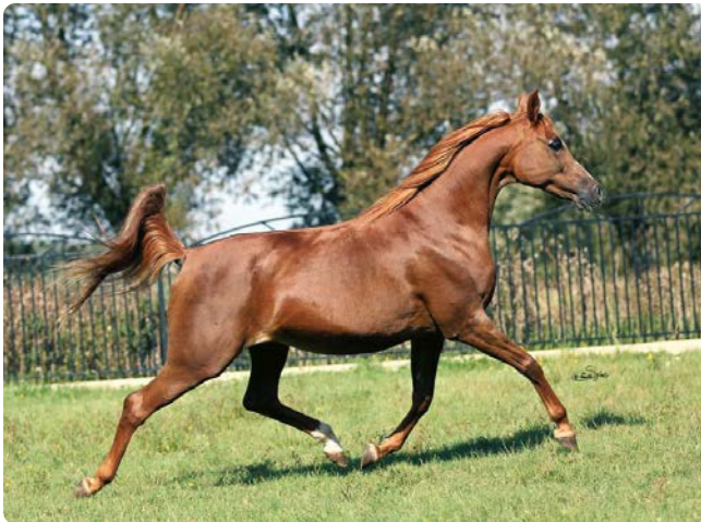
GINERVA (WERBUM X GEORGIA / MONOGRAMM)