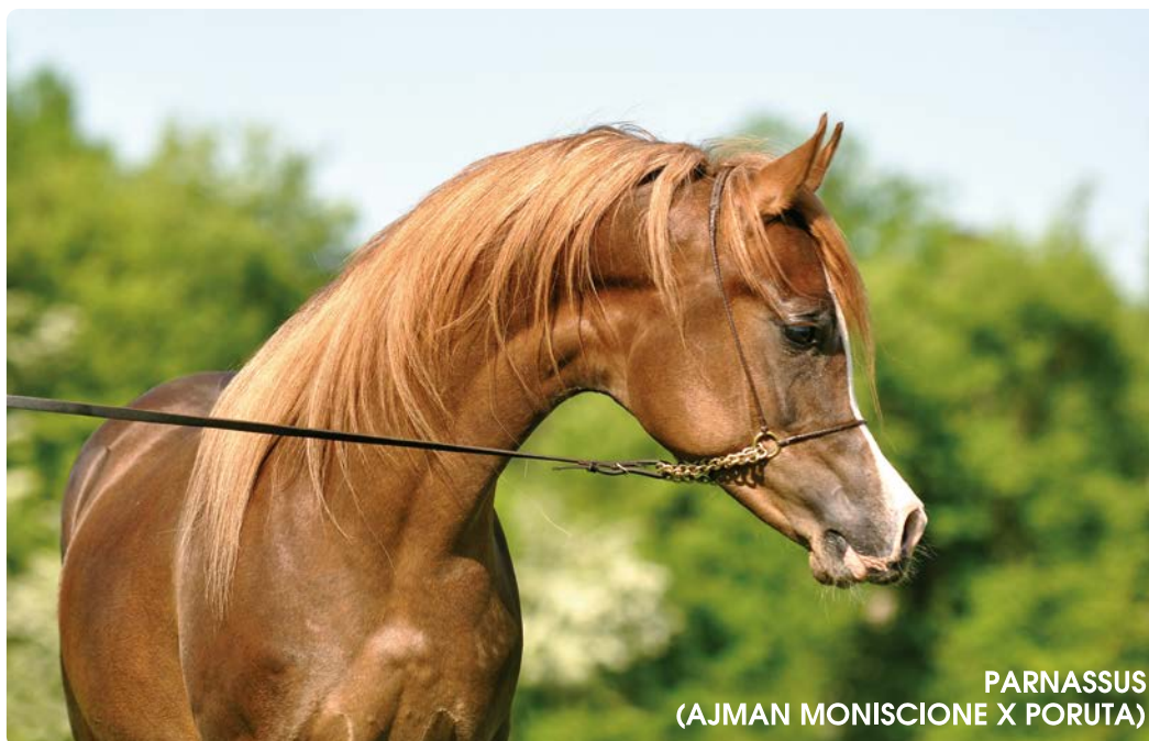
PARNASSUS (AJMAN MONISCIONE X PORUTA)