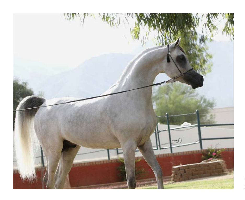
MARSAL AL SHAQAB (Marwan Al Shaqab × Miss El Power JQ) 2010 Grey Stallion