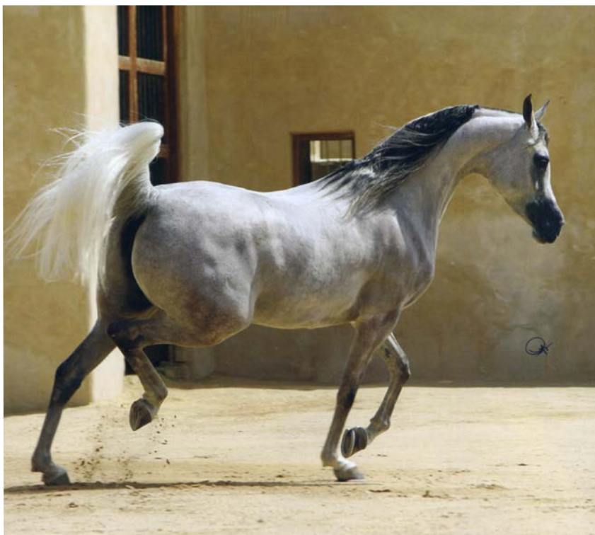
ABHA MYRA (Marwan Al Shaqab x ZT Ludjkalba) 2009 Grey Mare