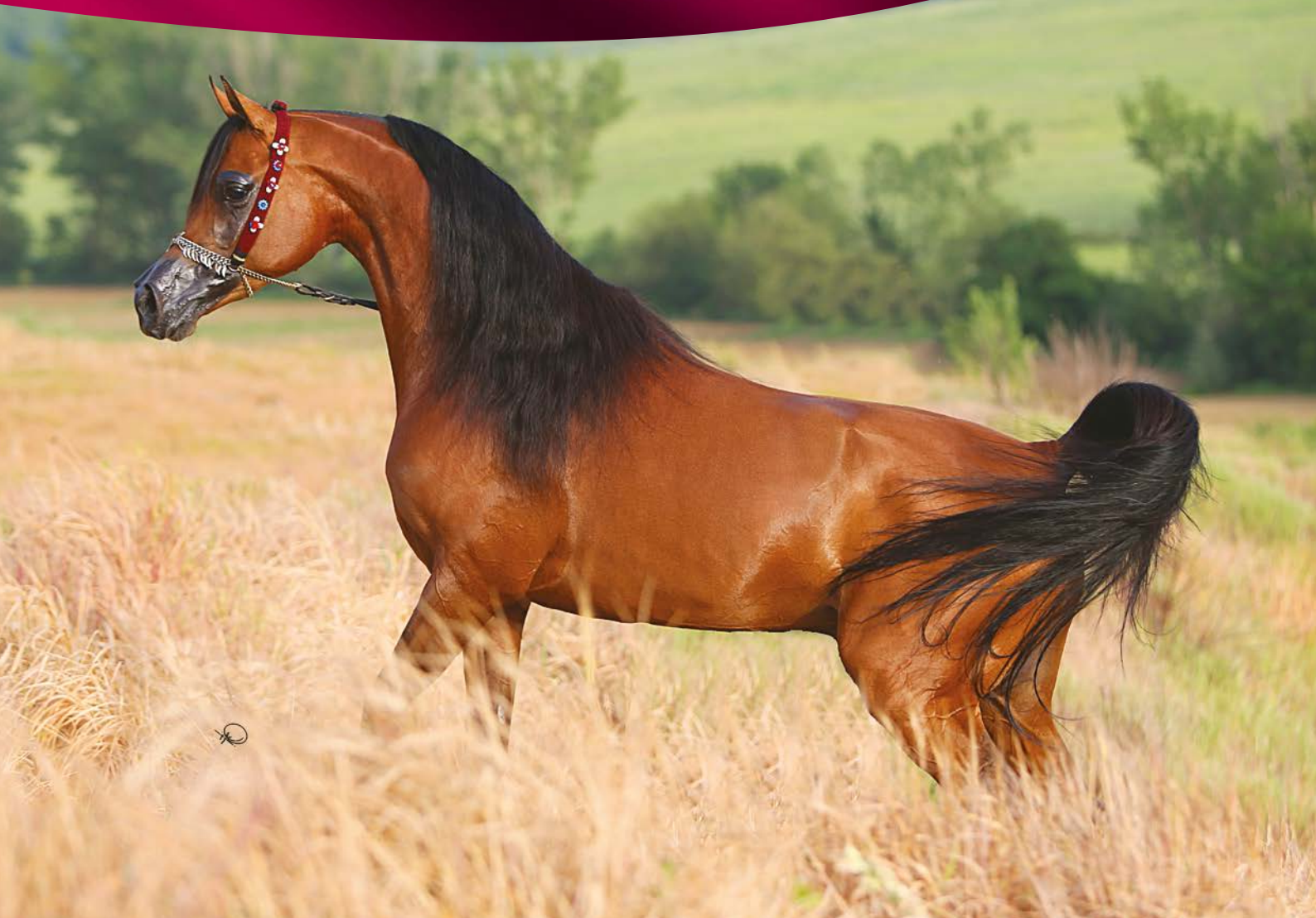
FADI AL SHAQAB (Besson Carol x Abha Myra) 2008 Bay Stallion

straight Egyptian herds was a pivotal moment, like providing the pond on which the moonlight will shine.