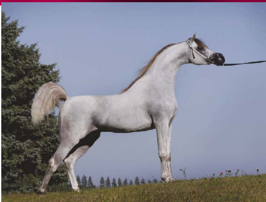
HARIRY AL SHAQAB (Marwan al Shaqab x White Silkk) 2010 Grey Stallion