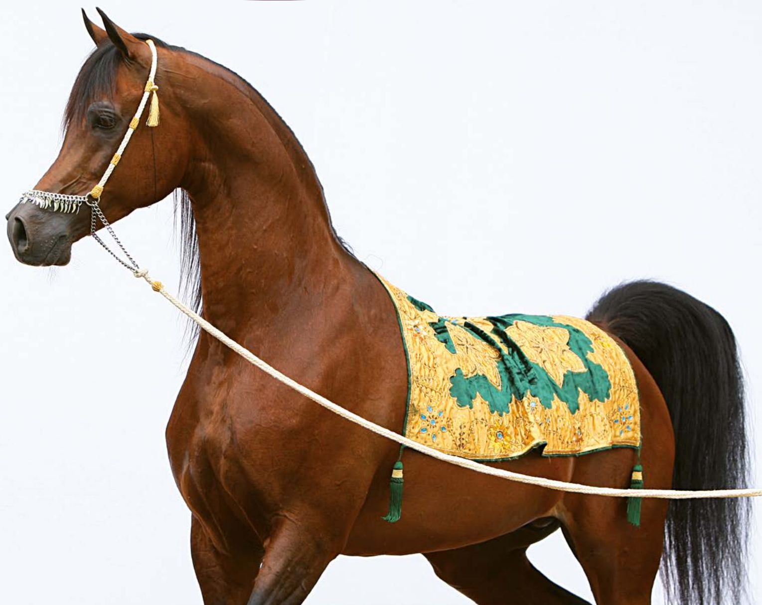
MARWAN AL SHAQAB (Gazal Al Shaqab x Little Liza Fame) 2000 Bay Stallion