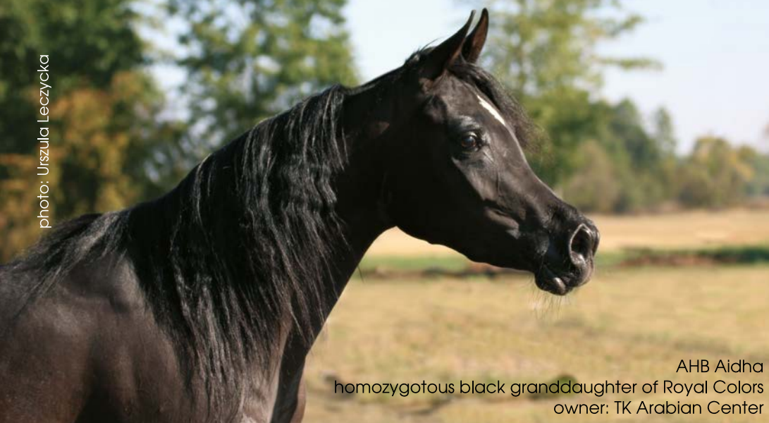
AHB Aidha homozygous black granddaughter of Royal Colors owner: TK Arabian Center

and is challenging mare to breed for the future. At last but not least we have homozygous black AHB Aidha , granddaughter of Royal Colors. She came to us from Italy this year and the shape of her exotic face fulfills all our dreams about beautiful black Arabian horse. There are a few people interested to buy her from us but we want to breed her to Magic Magnifique first as we know that she will produce for us a black foal with any black stallion.