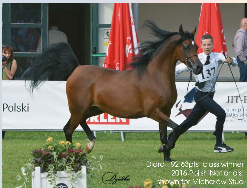
Diara - 92.63pts, class winner 2016 Polish Nationals, shown for Michałów Stud