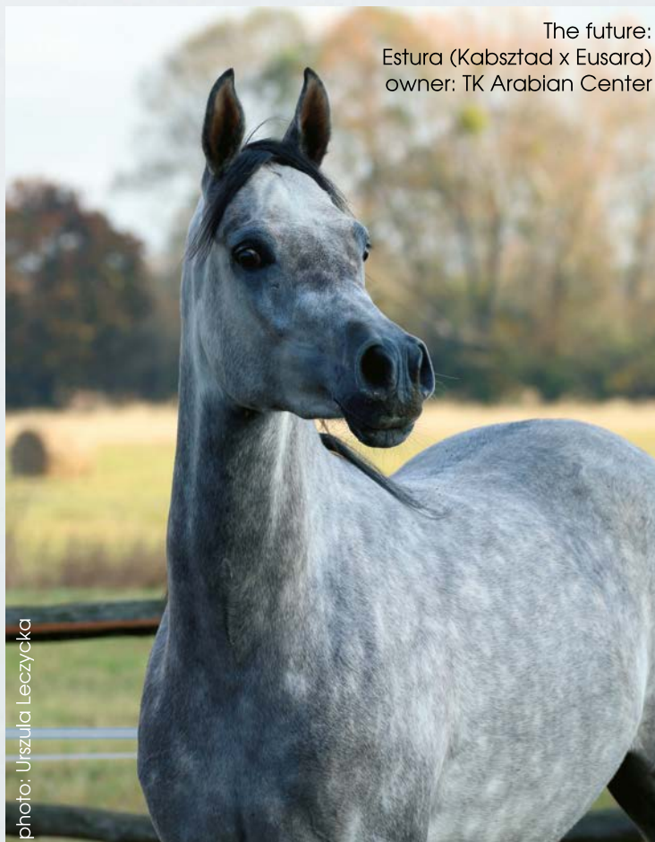
The future: Estura (Kabsztad x Eusara) owner: TK Arabian Center

One of our biggest achievements we have reached quickly and we are very proud of is a big interest of people worldwide in our horses already. I'm glad that more experienced breeders like our horses and we don't have a problem to sell them whenever we decide to. In the consequence of our first summer presentation for visitors