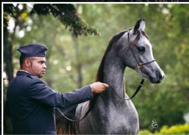
Abyad AA (Nader al Jamal x Al Amal AA)