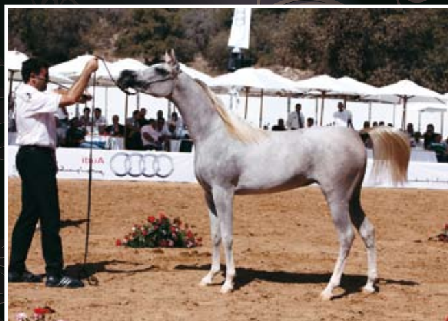
SA El Sahara (Nader al Jamal x Al Duqa AA, by Al Maraam)