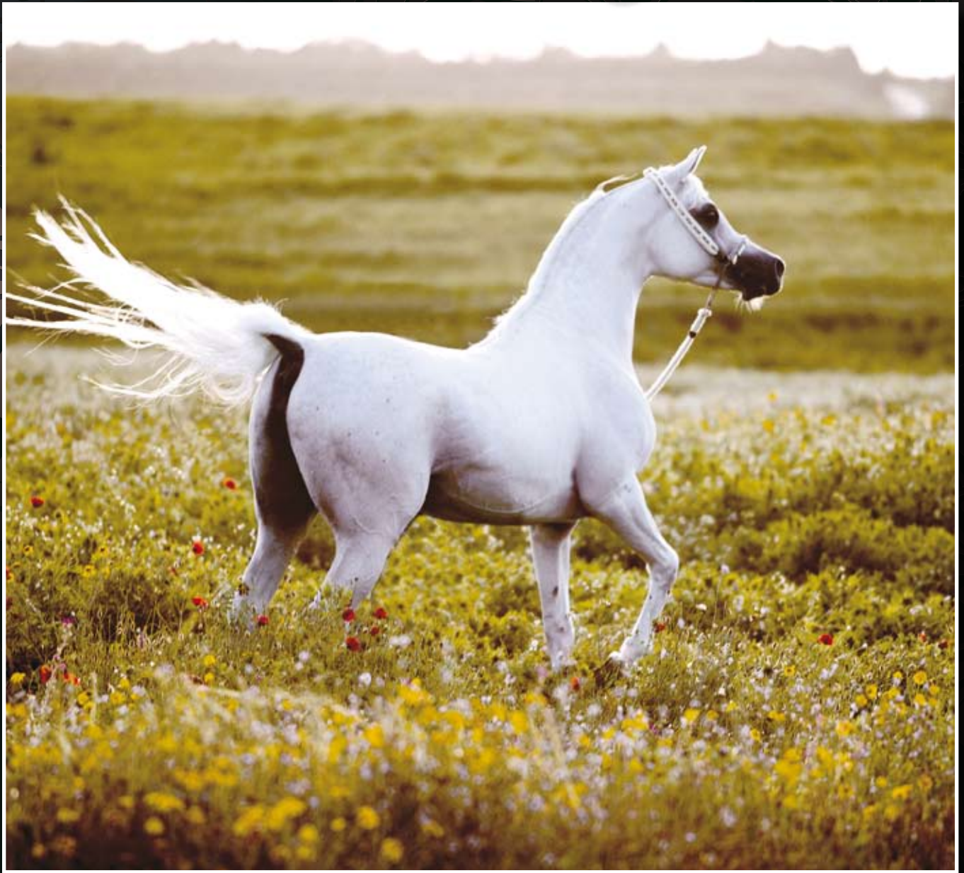
Nader al Jamal (Ansata Sinan x Savannah CC)