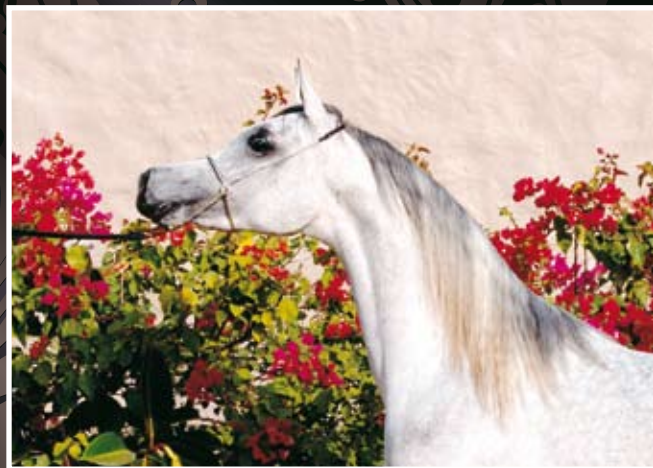
Lutfina AA (Nader al Jamal x Latifah AA)