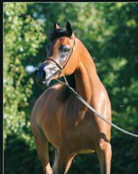
Marc's Star KA owned by Knocke Arabians - BE