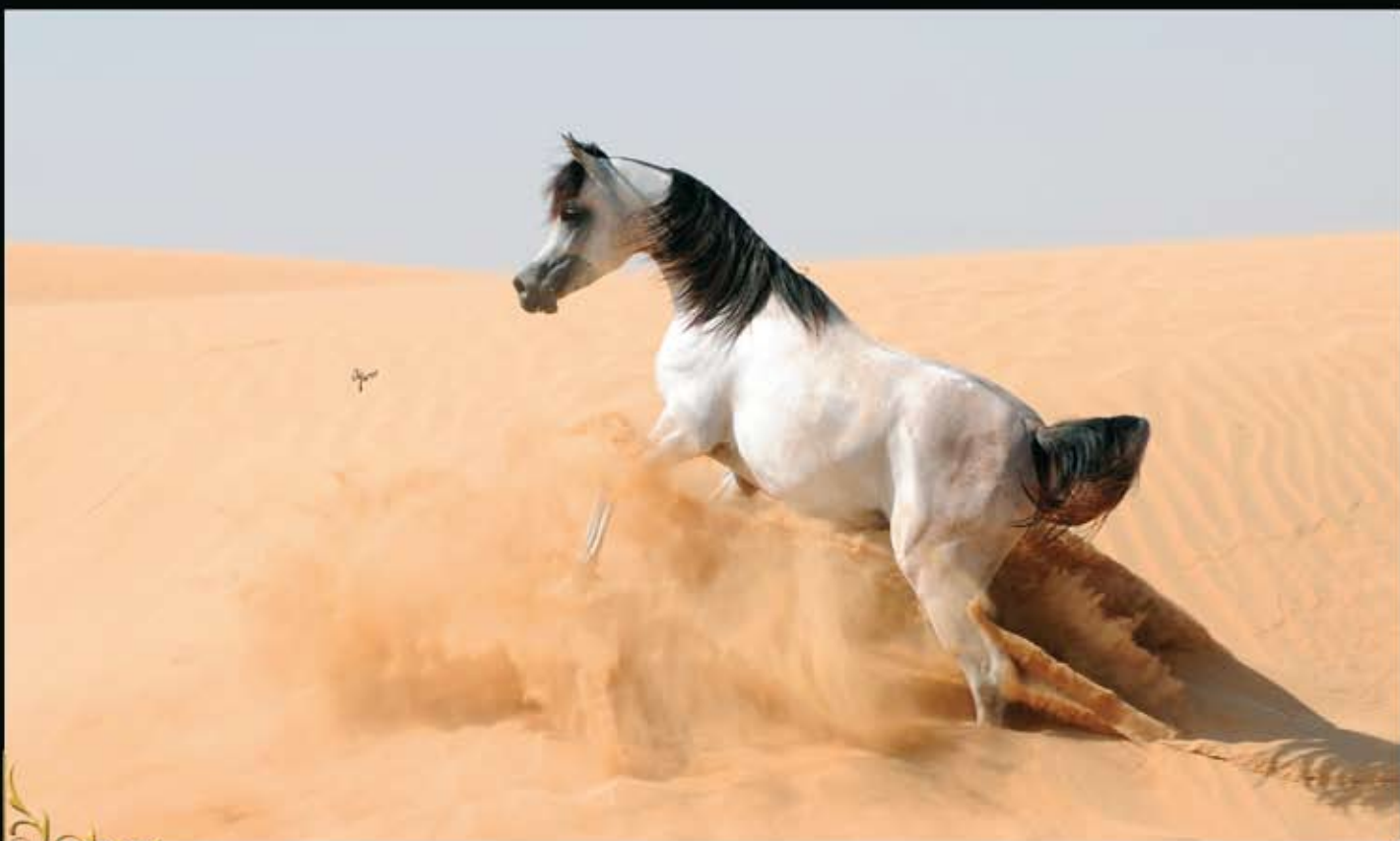
D Myas - owned by Dubai Arabian Stud - UAE