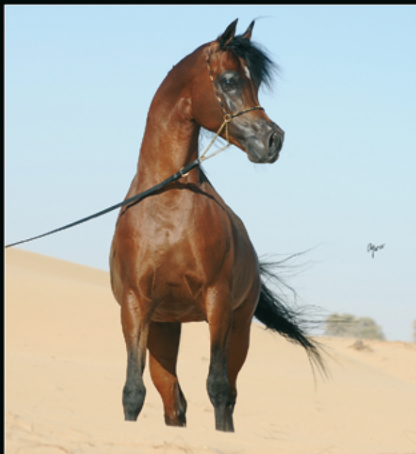
QR Marc in the desert of Dubai

The cooperation done with Dubai Stud to let QR Marc being shown in the Middle Eastern shows had its debut in Abu Dhabi this year where QR Marc started off with winning his first show of the year, at the International Abu Dhabi show, scoring the highest points of the show and claiming his champion title unanimously. Pleasing the crowd and everybody involved with scoring straight 20's on type and for the first time, he also took the well-deserved 20's and 19.5's for movement. Building up the impressive total score of 94 points! In Dubai show he did the same with all 20 in type and gave to all the people the impression that the King is here !