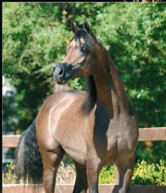
Emanos KA - owned by Knocke Arabians - BE

During the European Championships, it was again Wieza Mocy that took the Gold medal with the Junior Fillies and Equator claimed the title of Gold Champion with the Junior Colts!