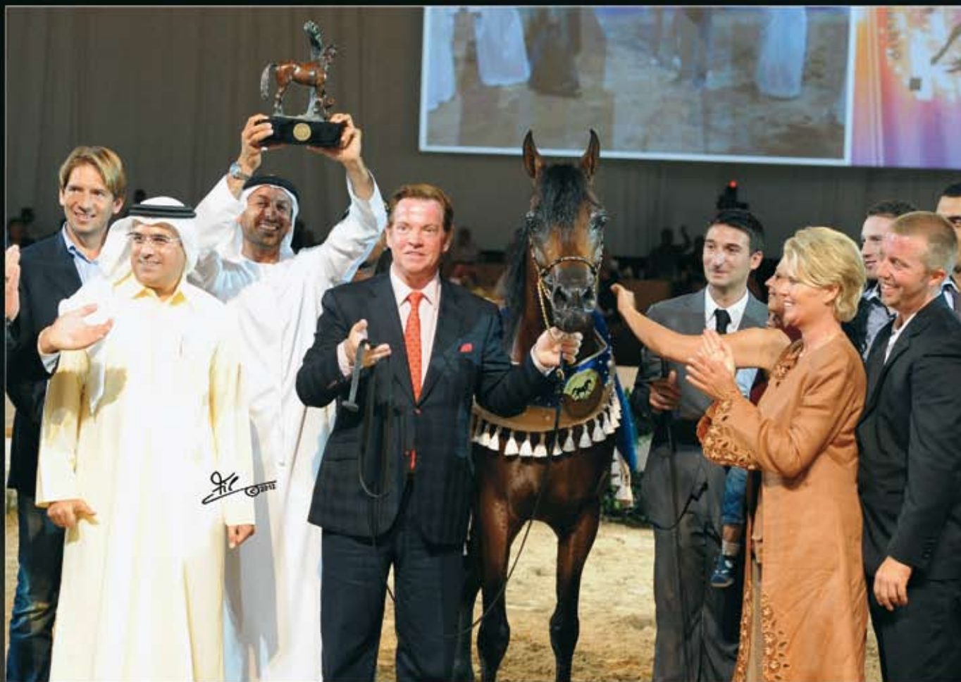
QR Marc winning the Gold Champion Stallion Title at the prestigious Dubai International Show 2012