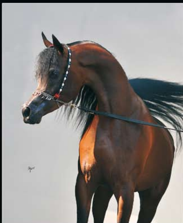
Emerald J - owned by Al Jalawiyah Stud - KSA

We also remember the great victory at the Bialka Junior Spring Show, where Wieza Mocy took the Gold medal, as well did the impressive colt Equator that continued his victory by being named Polish National Champion colt and at the All Nations Cup where he achieved a Bronze Medal with the junior colts! Also at the show in Prague – Czech Republic, his offspring was named gold medal winner (Palatina) and Silver medal winner (WW Indih).