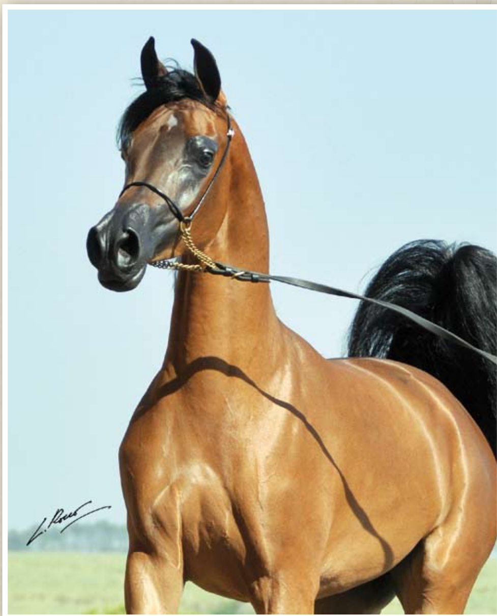
*Margueritte (Marwan Al Shaqab x Majaarani)