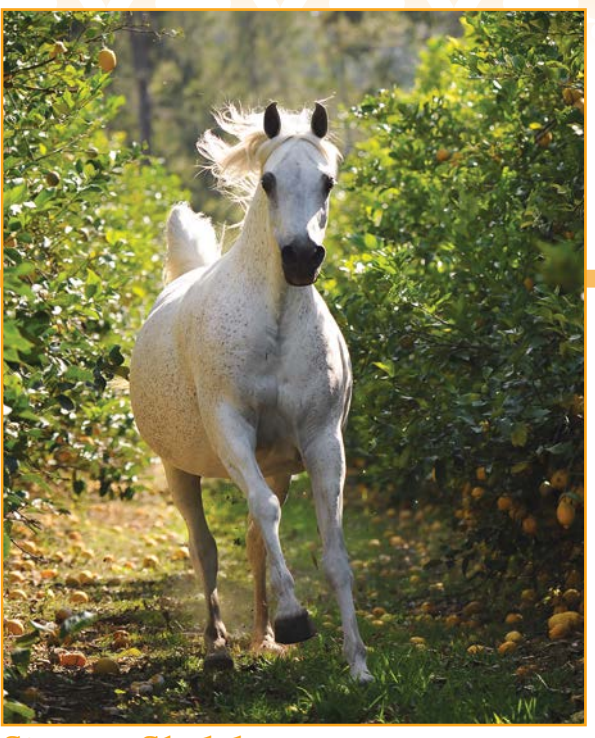
Simeon Shalal (Asfour x Simeon Simona) 2000 Mare