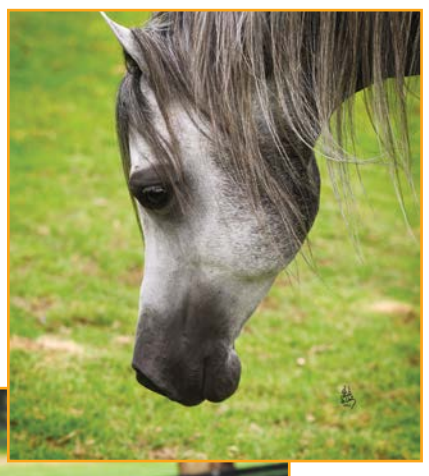
Simeon Shifran (Asfour x Simeon Shavit) 2007 Stallion