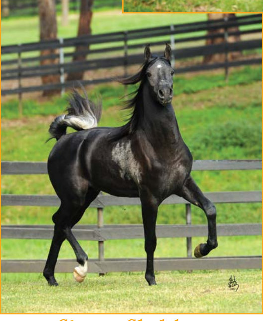
Simeon Shulchan (Anaza Bay Shahh x Simeon Saadia) 2011 Colt