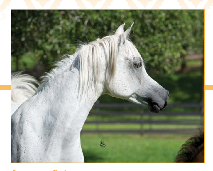
Simeon Salit (Asfour x Simeon Shavit) 2003 Mare