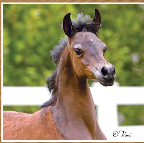
MANDELA AL HAWAJER (RFI Farid x Jameelah Al Hawajer)