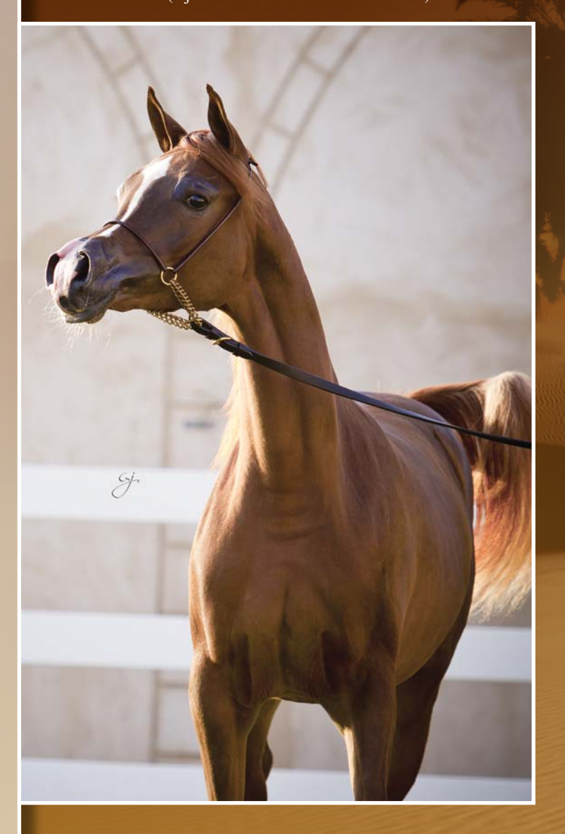
MESK AL HAWAJER (GM Justin x Lluckystar)