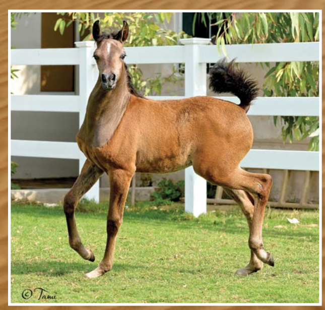
MAZYONAT AL HAWAJER (RFI Farid x Diammond Lil)