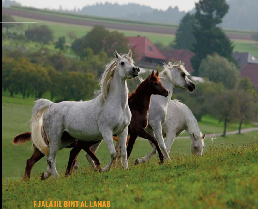
F JALAJIL BINT AL LAHAB