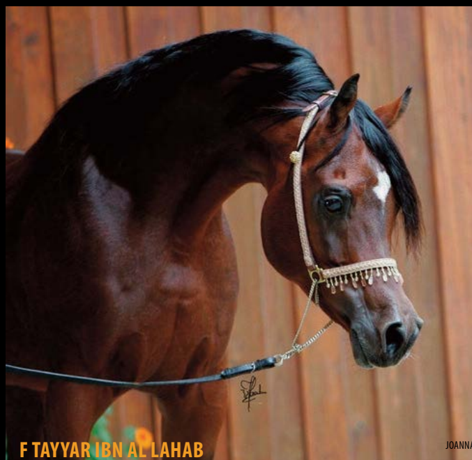
F TAYYAR IBN AL LAHAB

(Al Lahab x F Tahani Bint Shamaal) Int. Show Champion