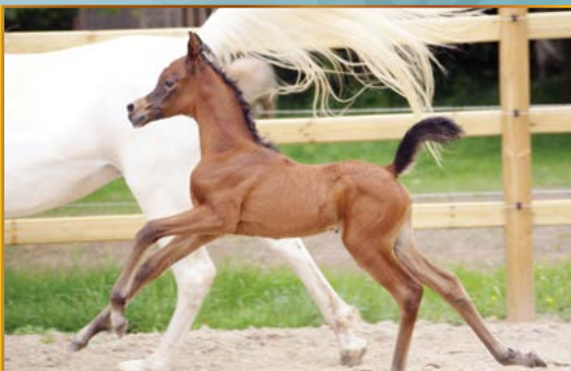
NESJ EL MISS KANZIE (x Nesj El Khisaya)