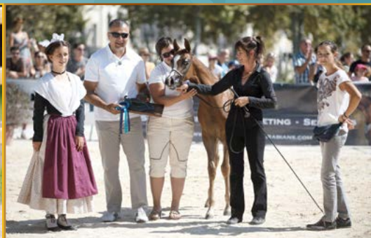
TZAR KENZA (x Najma Noora)