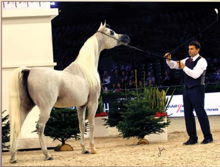
Emandoria during the 2013 World Championship in Paris. Where not only was she crowned as the new World Champion Mare, but also as the 2013 Triple Crown Champion Mare