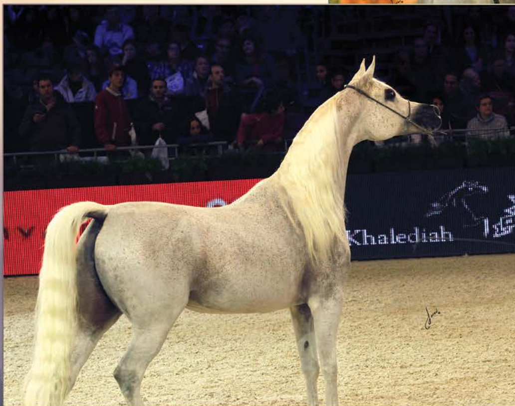
Emendoria 2013 World Champion Mare