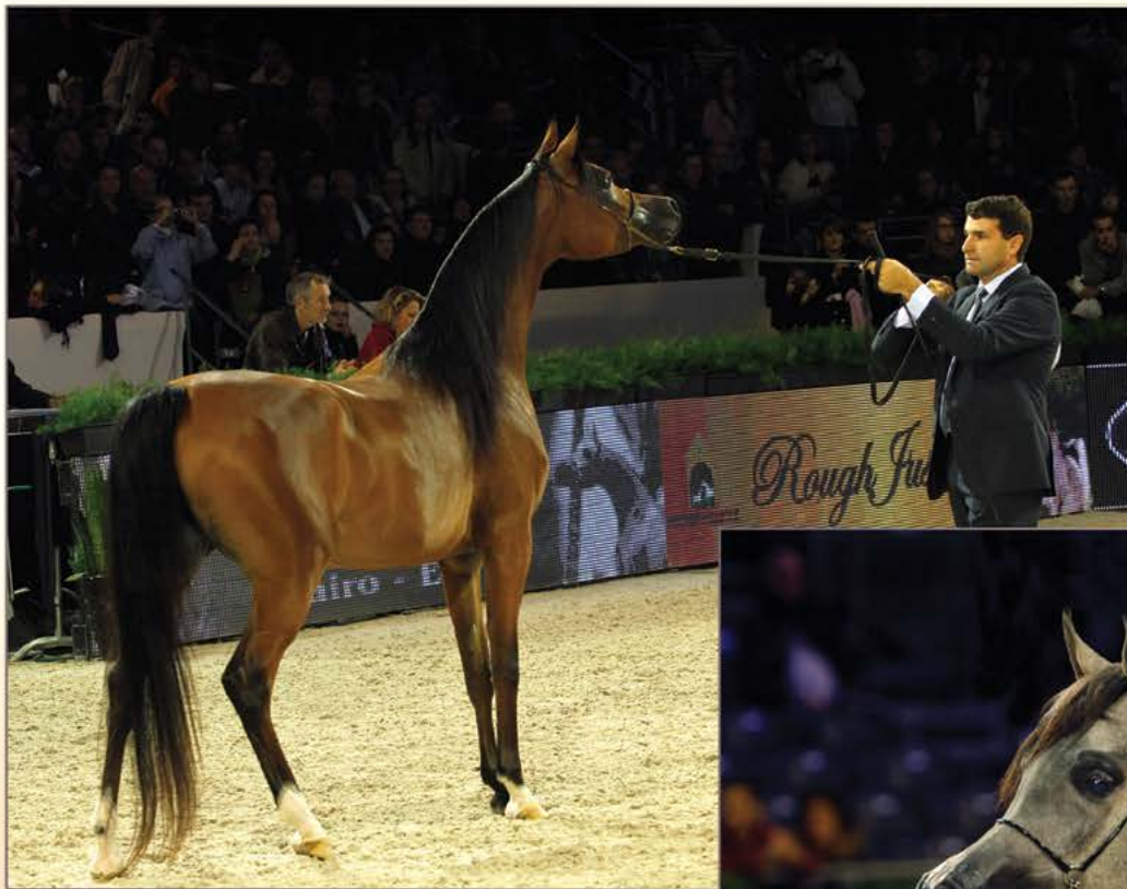
Aj Sawahi 2011 & 2013 Unanimous World Champion Filly