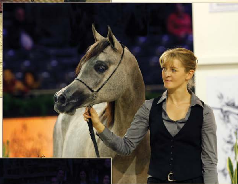
Antaris OS 2013 World Champion Yearling Colt