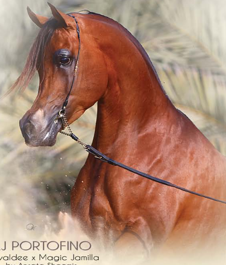
AJ PORTOFINO Vervaldee x Magic Jamilla by Ansata Shaamis