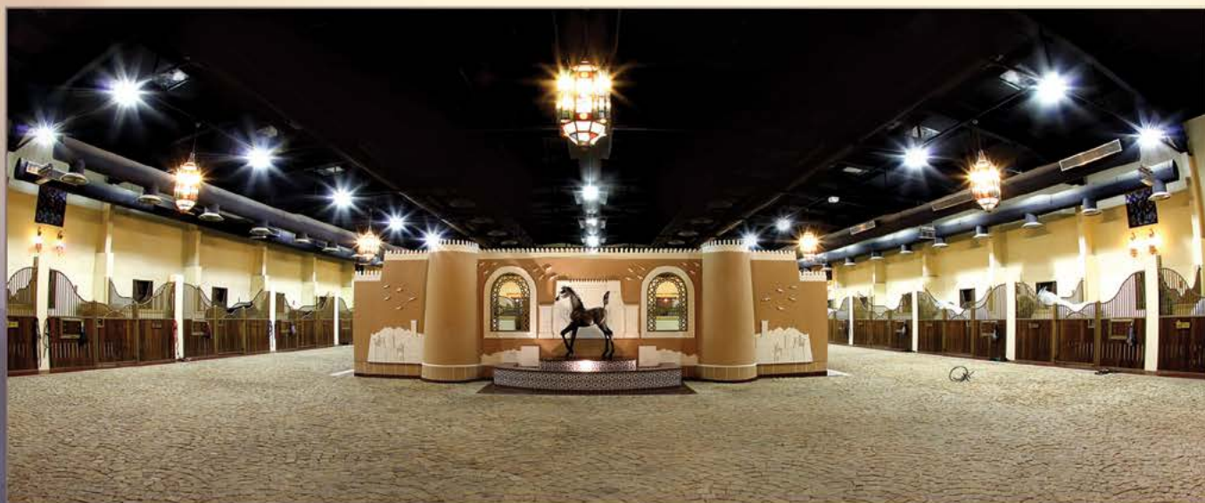
The Majestic Mare Stable of Ajman Stud