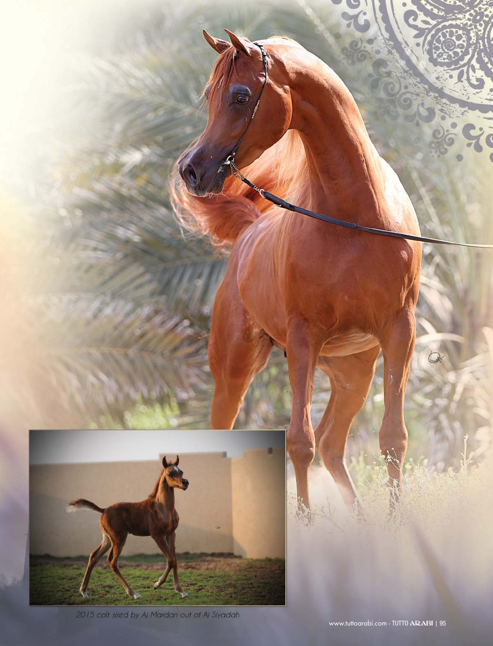
2015 colt sired by Aj Mardan out of Aj Siyadah