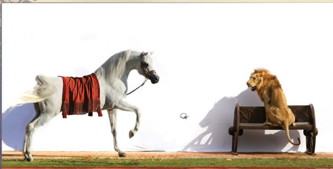
Ajman Stud - Home of Royalty