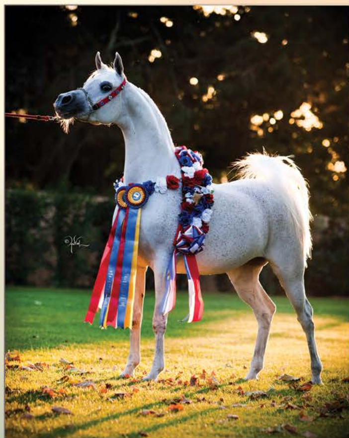
Panarea by Palawan 2011 Las Vegas & US National Champion Mare