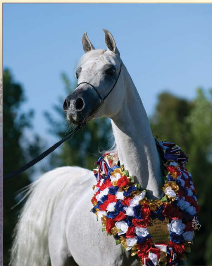
Eagleridge Passionata 2010 Las Vegas & US National Champion Mare

Ajman Stud has twice earned U.S. National Champion Mare titles...and it happened in back-to-back years. In 2010, Eagleridge Passionata (*Sanadik El Shaklan x River Oak Dimity) followed up her earlier Las Vegas championship with the coveted title of U.S. National Champion Mare. The very next year, Ajman returned with Panarea by Palawan (WH Justice x Palawan) to capture the 2011 crown. It was an unprecedented display of the depth of the Ajman Stud program. Horses owned and shown by the farm have won National and International championships on five continents against the finest horses from scores of nations. In 2005, the United Arab Emirates won the All Nations Cup due to the Ajman wins alone with Champion Junior Filly Bess Fa'izah, Champion Senior Mare Psyches Amber Gem and Senior Champion Escape Ibn Navarrone-D. In 2012, and again at the All Nations Cup, the Ajman bred and owned entries of AJ Asyad, AJ Mardan and AJ Siyadah were named Gold Champion Yearling Filly, Gold Champion Yearling Colt and Gold Champion Junior Filly respectively. Two very impressive and rare accomplishments from Ajman Stud. From Qatar to Menton, from Paris to Scottsdale, from Dubai to Las Vegas... the Ajman Stud will continue, in 2015, to dominate in show arenas around the world.