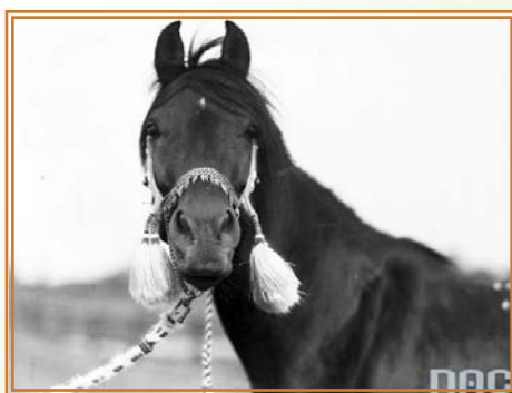
Ku hailan Haifi.