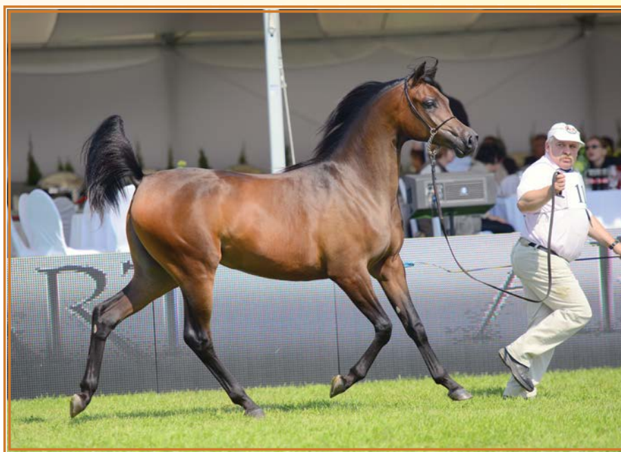
Pustynia Kahila, Al Khalediah European Arabian Horse Festival 2014.