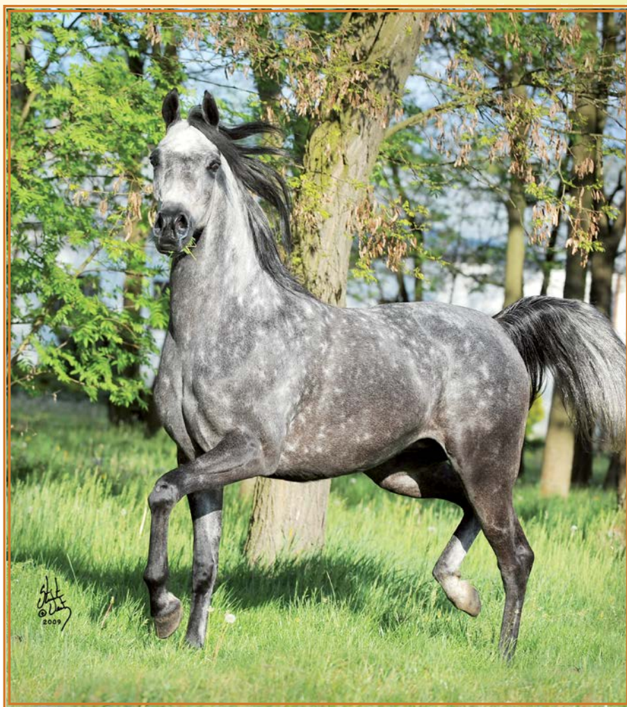
Pinta.