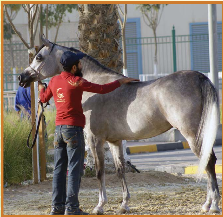
Perfinka, Qatar 2015.

out of politeness will say that it is high. But many times I have heard opinions that the judges exchanged between themselves and they were those of admiration, recognition, respect. The best proof of the quality of the show is that some horses that have claimed awards at title shows never became Polish National Champions. The best example is Kwestura, who won the World Championships twice, but was never a Polish National Champion Mare”.