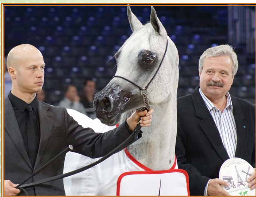
Pepita, Paris 2014.