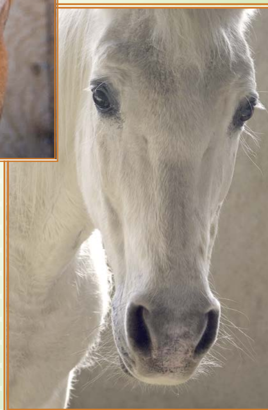
Ernestyna, Michałów 2014.