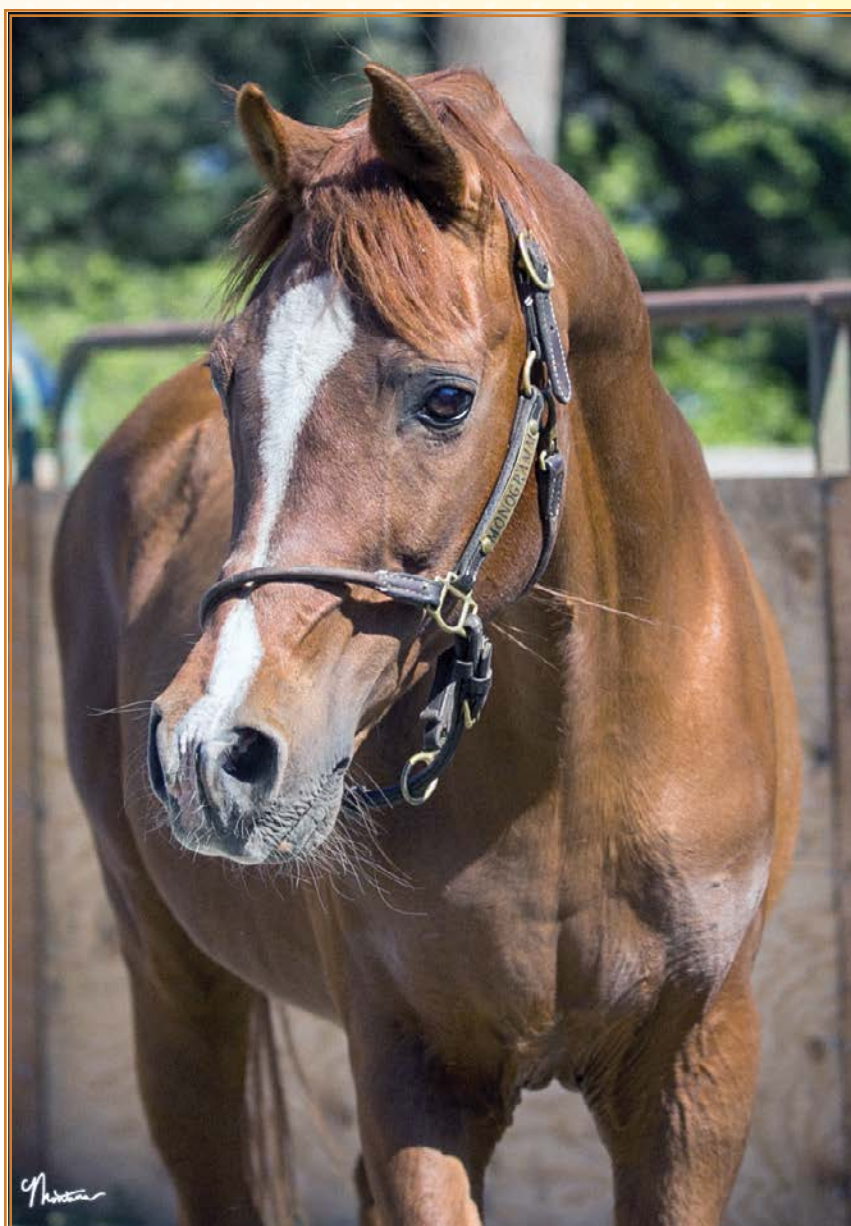
Monogramm, 2014.