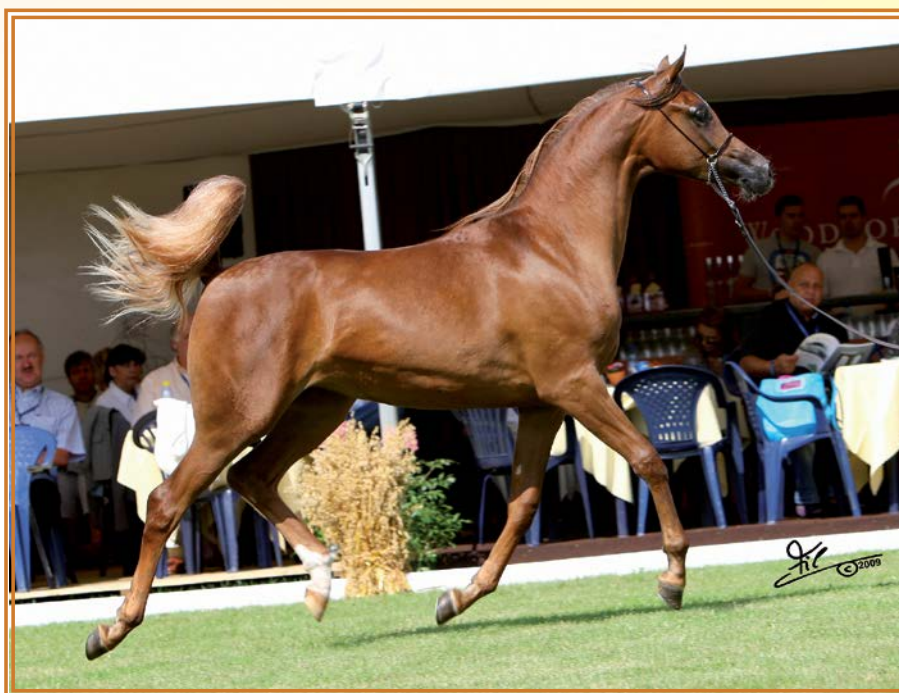
Wieża Róż

Mare at the 3rd Autumn Show (2008). Two years later this success was repeated by Paema (out of Pasyrna/Piaff). In turn Piaweia (out of Powiewna/Wachlarz) became in 2011 Alsace Champion and Best in Show.