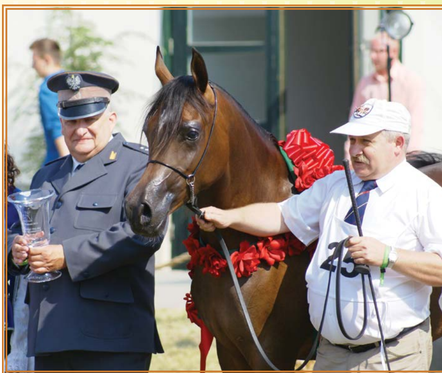
Piacolla, Janów Podlaski 2013.

During 2005–2007 Janów Podlaski got plenty of their own Ekstern get, which later stood out at shows. Among them we find Polon (out of Pianosa/Eukaliptus) and Prado (out of Pętla/Visbaden), the mares Altamira (out of Altona/Eukaliptus), Biruta (out of Bajada/Pamir), Cenoza (out of Celna/Alegro), the afore mentioned Pepita, Sefora (out of Sawantka/Pepton), Bohema (out of Bogini/Arbil), Wołogda (out of Wanilia/Alegro), Atma (out of Altona/Eukaliptus), Sarbia (out of Samura/Ararat). Białka Stud used Ekstern on a wide scale during 2003–2005 and 2007. Born as a result was the colt Celsjusz (out of Carina/Pesal), Polish National Junior Champion and Autumn Show Reserve Champion in Janów. Others included Herlina (out of Heroldia/Eukaliptus), Perita (out of Perforacja/Ernal) and Cirilla (out of Cirka/Borek).