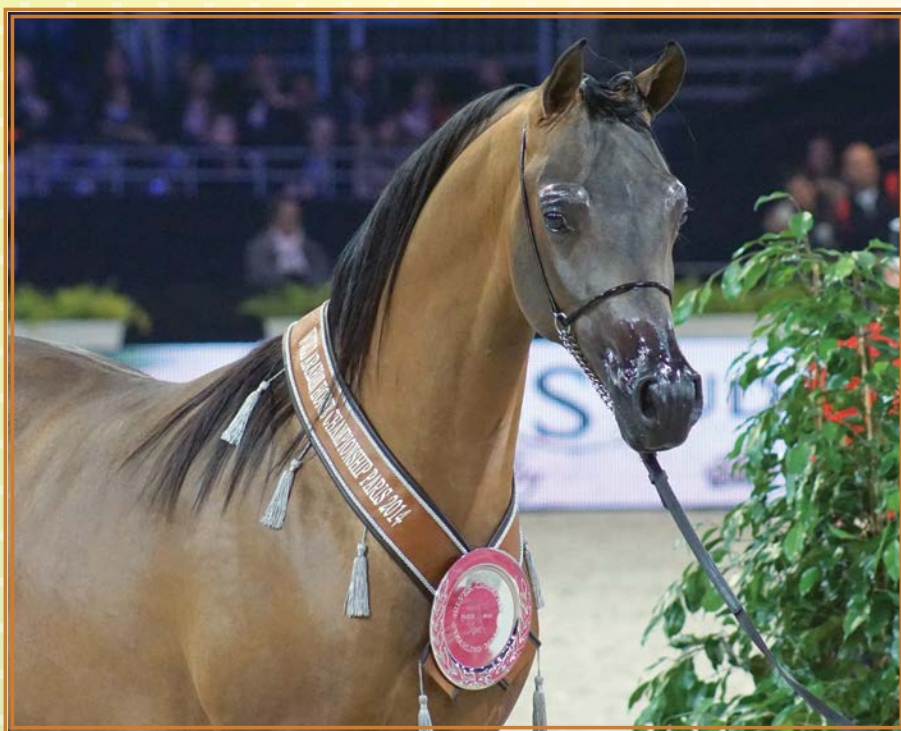
Morion, Paris 2014.