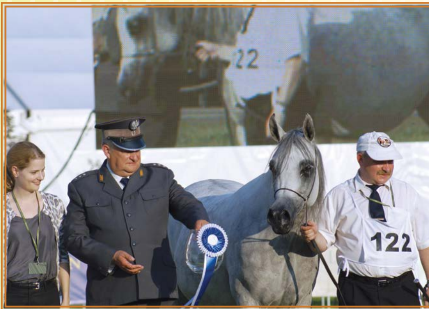
Palanga, Janów Podlaski 2010.