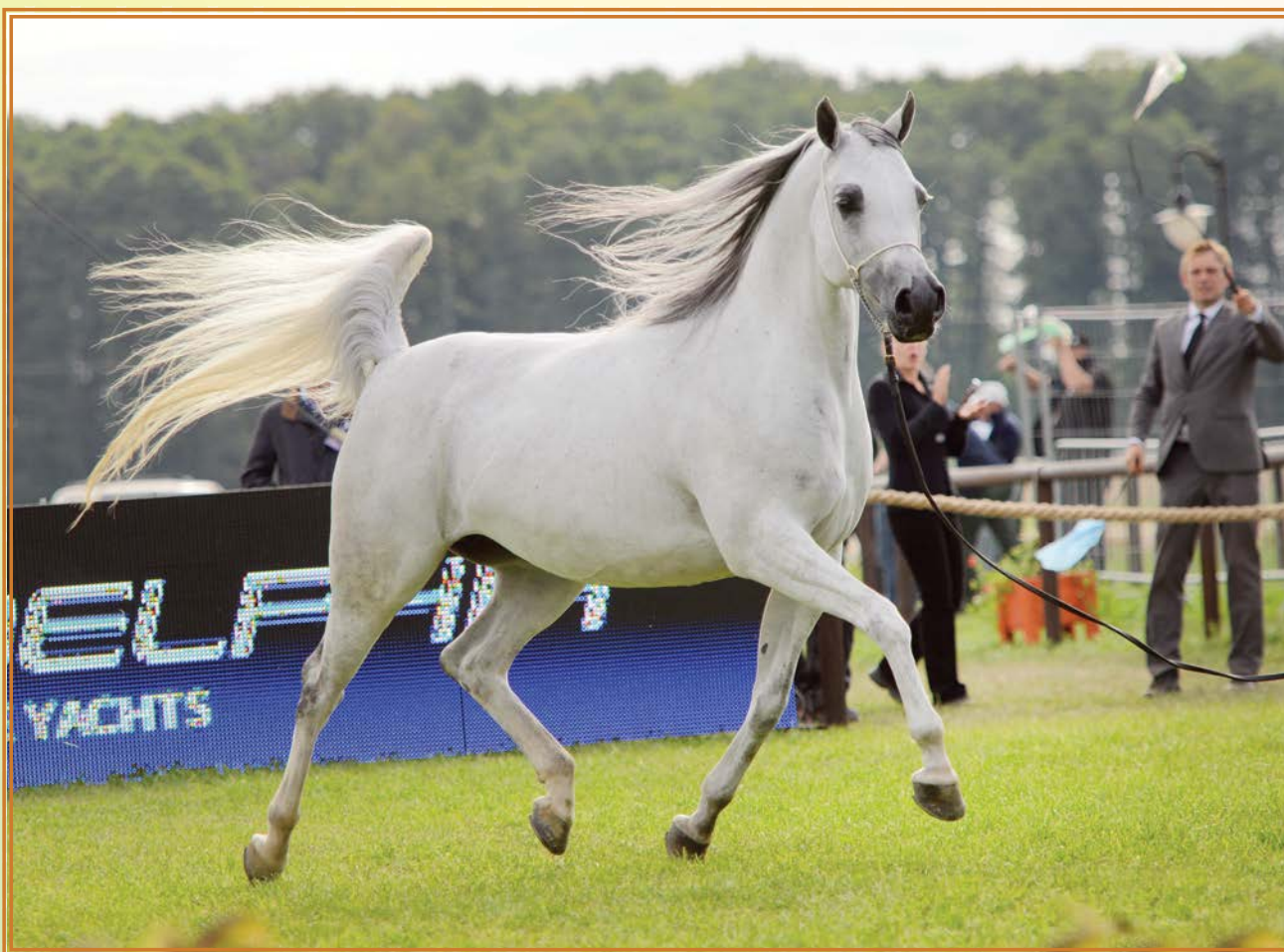
Psyche Victoria, Al Khalediah European Arabian Horse Festival 2014.