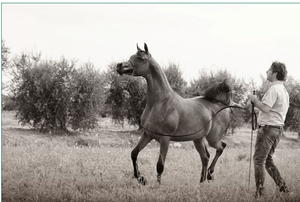
QUTUZ ALJASSMYA by Al Ayal AA ex Minwah by Kahil Al Shaqab