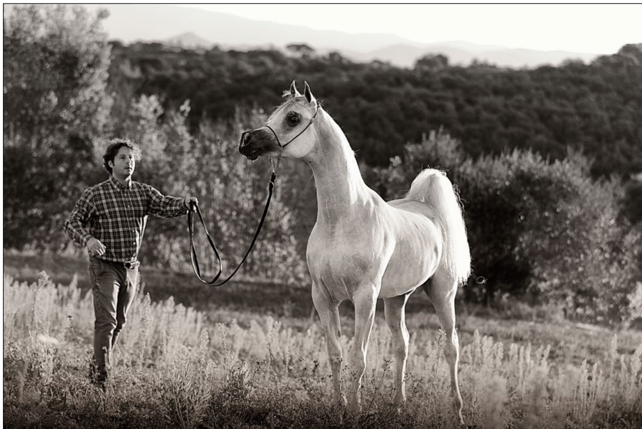
ARRAAB ALJASSIMYA by Al Ayal AA ex Om El Aisha Aljassimya by WH Justice