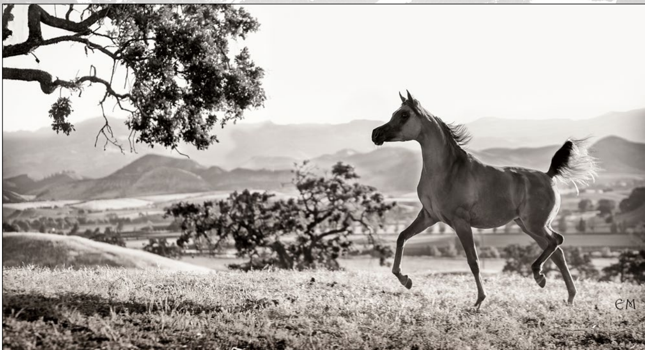
Sweira Aljassimya by SMA Magic One