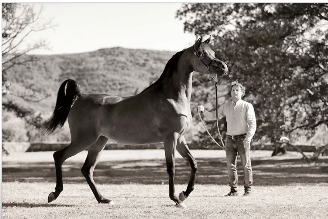
BALADA AL ALFABIA by EKS Alihandro ex ZT Magna Psyche by ZT Magnanimus

The blood of the great Marwan Al Shaqab blood has been woven into the breeding program just as successfully the other way round, by breeding Aljassimya Farm's 2013 World Champion Minwah by Kahil Al Shaqab to Al Ayal AA. The beautiful bay yearling colt Qutuz Aljassimya is a horse who needs to do no more than stand still to exhibit his flawless conformation; neck, withers shoulders, ribs, loin, croup, gaskin, knees, hocks, cannon, pasterns, feet - you would have trouble finding a better model. Topped off with his short dished head, huge black eye and short shapely ears, he is a colt to please the most demanding of observers. A good mover at home and in public, he has been Silver Champion at all three outings - in Scottsdale, Menton and Chantilly, and will not be backing down for the World