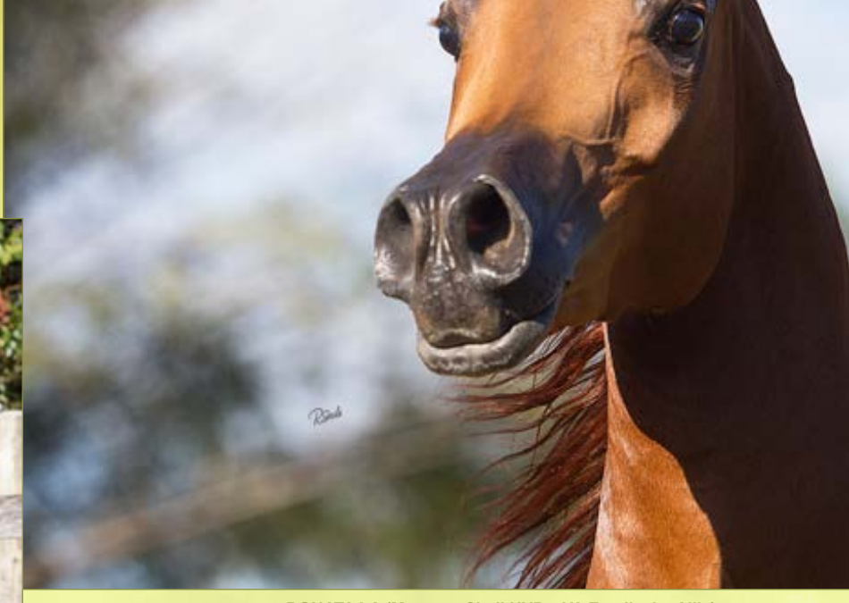
DONATA LA (Magnum Chall HVP x VA Exotika by Alija) will be shown at Haras Cruzeiro Open House 2019