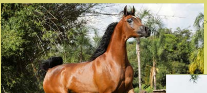
FAENA LA (Hdb Sihr Ibn Massai x Yasmin HWM) 2019 Brazilian National Filly Contender