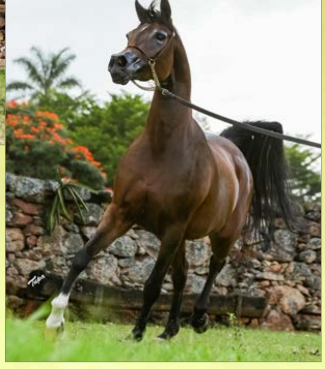
YASMIN HWM - 2019 Brazilian National Senior Mare Contender

In addition, every year after the show Haras Cruzeiro opens its doors to the breeders and Arabian horse lovers that want to know their stud and excellence better.