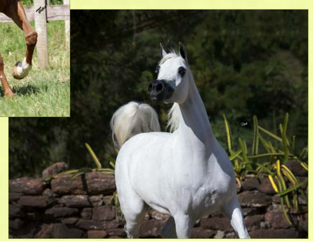
TURCHIYA MPE – Italian National Champion, Top Ten and Best Head in Paris will be shown at Haras Cruzeiro Open House 2019