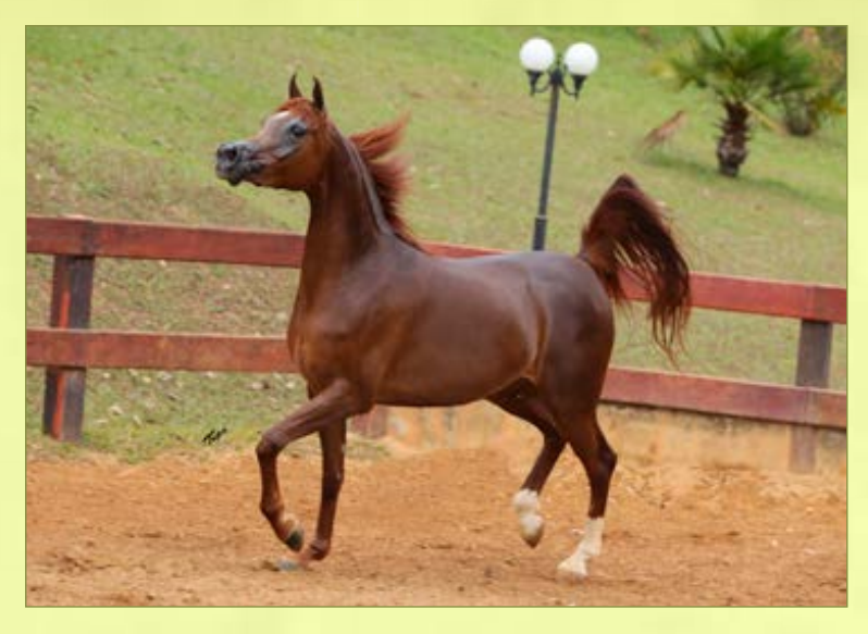
FLORA LA (Hdb Sihr Ibn Massai x FT Havanna El Keav)