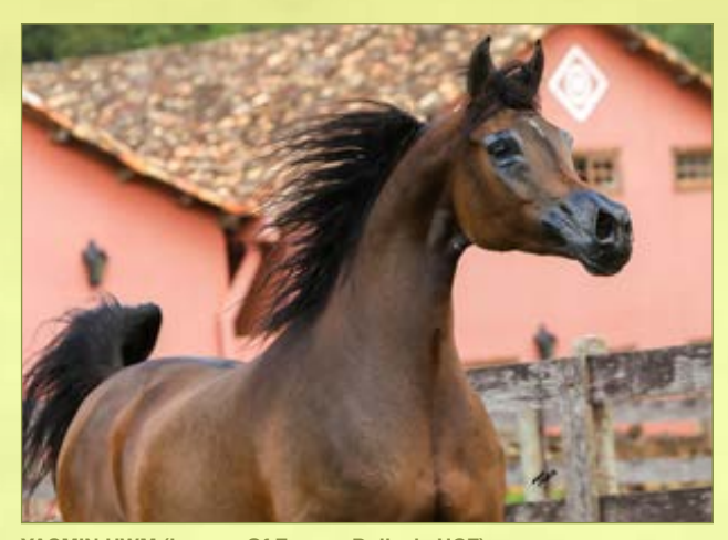
YASMIN HWM (Legacy Of Fame x Dollysia HCF) 2-time Brazilian National Champion