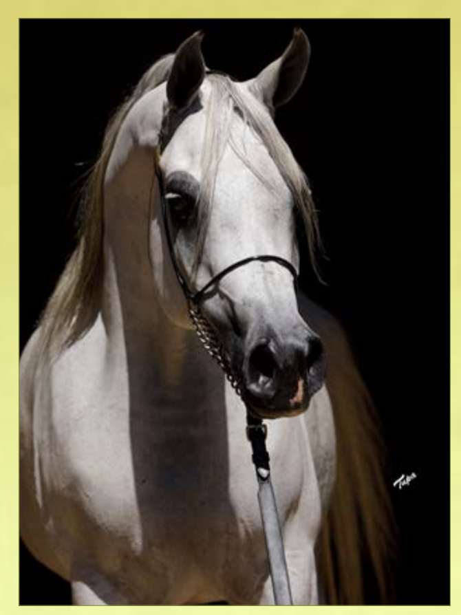
GHS MARY ROSE (WH Justice x Bajah Badiya) 2011 Brazilian National Reserve Champion Filly

In the following years some important investments were made to import some individuals that were fundamental to the breeding program of Haras Cruzeiro: among them, the rare grey, swan necked Shariba (Gazal Al Shaqab x Thee Rahiba) – Brazilian National Champion Mare with one of the most exciting performances ever at a Brazilian National Show -, her maternal sister, the white beauty Turchiya MPE (WH Justice x Thee Rahiba) - 2010 Champion Filly in Verona Class A Show, Best Head and 2nd in Class in Aachen and Best Head and 2nd in Class in Paris, the 2011 Brazilian National Reserve Champion Filly GHS Mary Rose (WH Justice x Baja Badiya), FT Havanna El Keav (Keav Power x Hillary CVM), VA Exotika by Alija (Ajman Moniscione x MA Alija), the flashy chestnut daughter of Magnum Chall HVP, Donata LA and the Multiple National Champion Yasmin HWM (Legacy of Fame x Dollysia HCF).