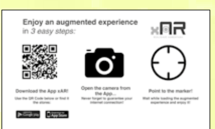
POINT TO THE PICTURE

MS MAGNOLIA (Marwan Al Shaqab x MPA Psynata)