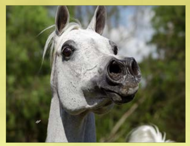
SHARIBA (Gazal Al Shaqab x Thee Rahiba) Brazilian National Reserve and Gold Champion Mare

In the following years some important investments were made to import some individuals that were fundamental to the breeding program of Haras Cruzeiro: among them, the rare grey, swan necked Shariba (Gazal Al Shaqab x Thee Rahiba) – Brazilian National Champion Mare with one of the most exciting performances ever at a Brazilian National Show -, her maternal sister, the white beauty Turchiya MPE (WH Justice x Thee Rahiba) - 2010 Champion Filly in Verona Class A Show, Best Head and 2nd in Class in Aachen and Best Head and 2nd in Class in Paris, the 2011 Brazilian National Reserve Champion Filly GHS Mary Rose (WH Justice x Baja Badiya), FT Havanna El Keav (Keav Power x Hillary CVM), VA Exotika by Alija (Ajman Moniscione x MA Alija), the flashy chestnut daughter of Magnum Chall HVP, Donata LA and the Multiple National Champion Yasmin HWM (Legacy of Fame x Dollysia HCF).