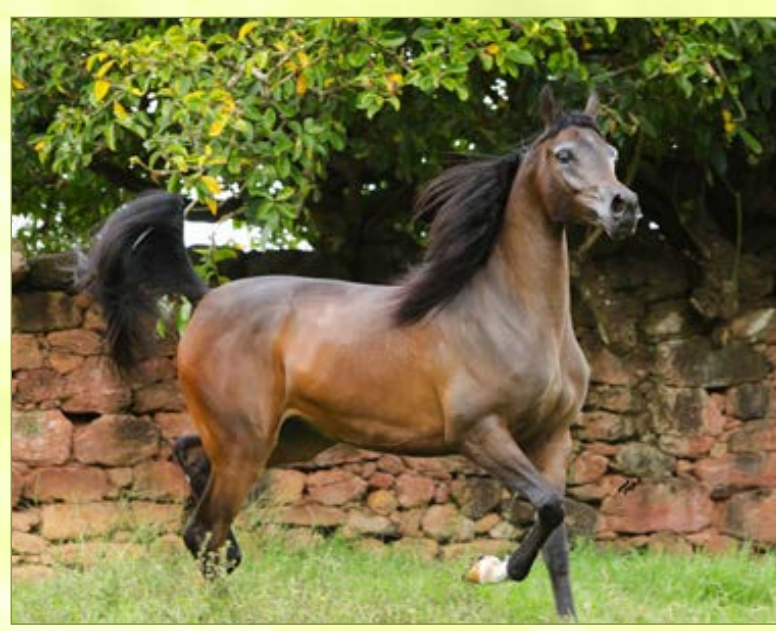
GAZALA LA – 2019 Brazilian National Junior Filly Contender