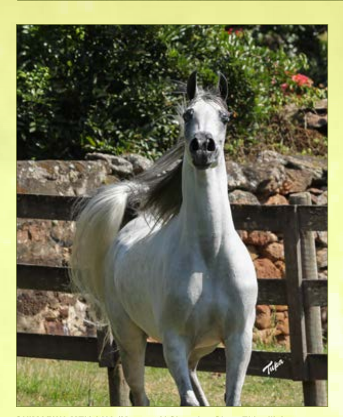
GHIMARWA MEIA LUA (Marwan Al Shaqab x Ginza El Ludjin) 2019 Brazilian National Senior Mare Contender

Haras Cruzeiro has great plans for the show this year and even if it won't be easy to beat last year's achievements, they will work very hard to raise the bar.