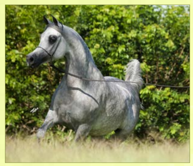
TURCHIYA MPE (WH Justice x Thee Rahiba) as a filly